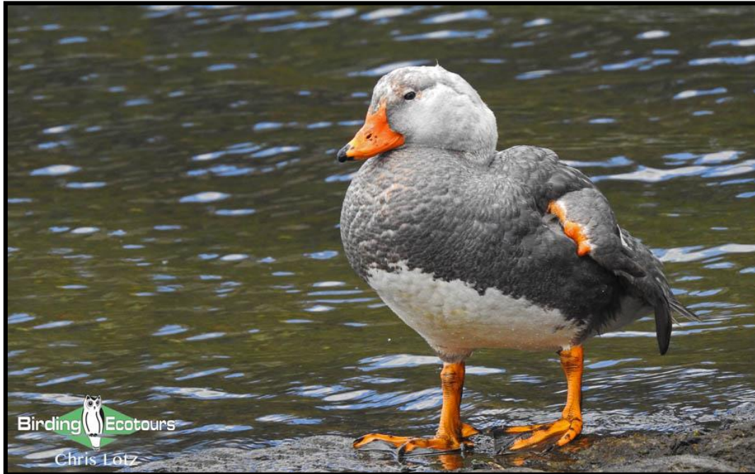
The attractive Fuegian Steamer Duck can be found near to Ushuaia.