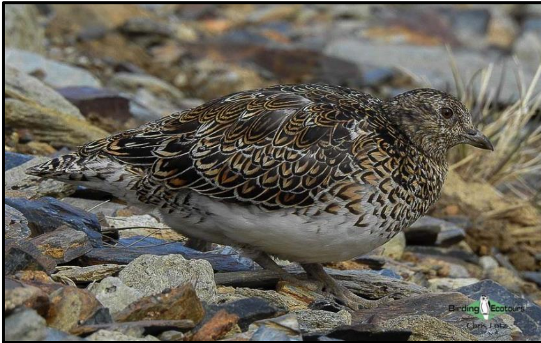
White-bellied Seedsnipe can be seen on the Garibaldi Pass.

This short tour of Tierra del Fuego, Argentina gives you the opportunity to explore southern Patagonia and the Tierra del Fuego National Park from the world's most southerly city, Ushuaia . Apart from the sheer beauty of the area, including snow-capped peaks, mountain streams, and large beech forests, there is an assortment of important bird species which will be targeted. High on this list will be the huge Magellanic Woodpecker , which inhabits beech forests in Tierra del Fuego National Park, as well as White-bellied Seedsnipe , which is found above the tree line on a nearby mountain pass. Other range-restricted species which we hope to find include Flying Steamer Duck , Upland Goose , Yellow-bridled Finch , and Patagonian Sierra Finch .