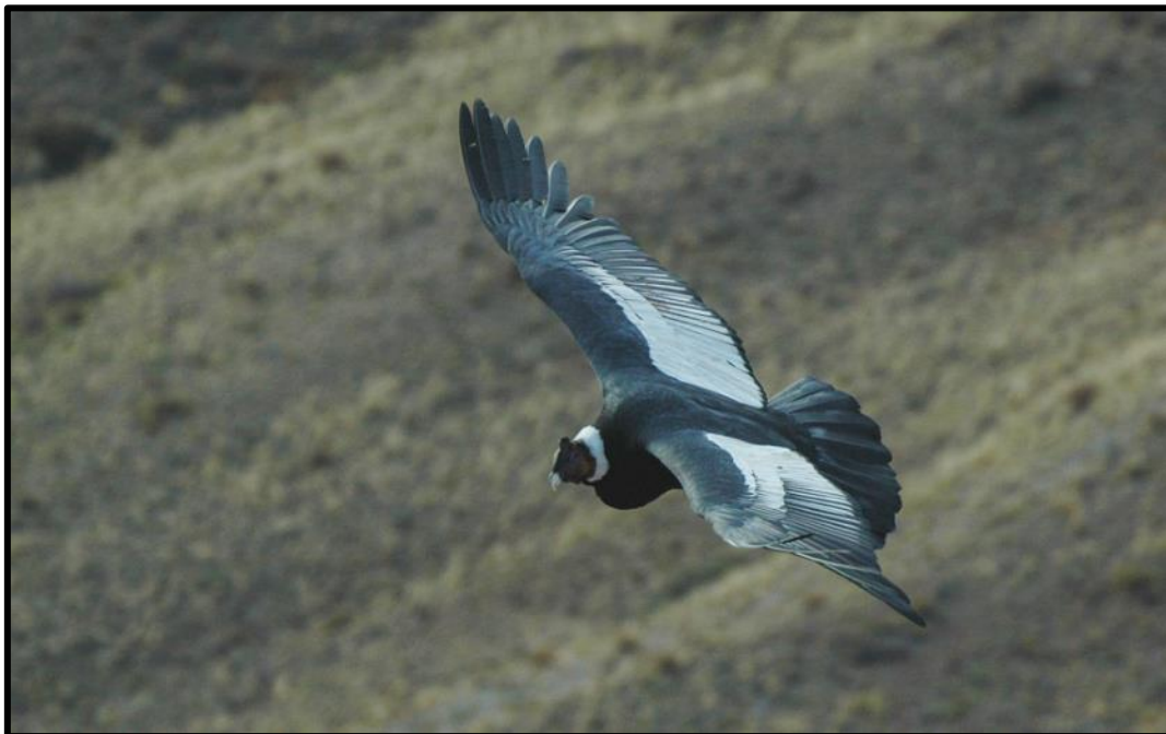
Andean Condor is an iconic bird of the high Andes.