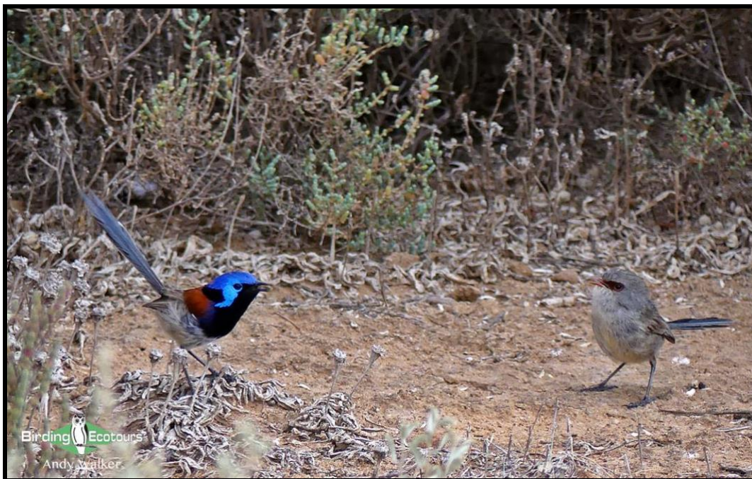
A spectacular male Purple-backed Fairywren displays to a rather drab female.