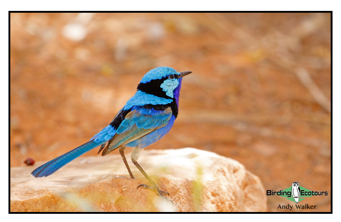
Splendid Fairywren is one of many spectacular species found around Alice Springs.

As with all our other tours this is a small-group tour. The majority of our tour will be based in Alice Springs, though we will also venture further afield to base ourselves near Uluru so we are well placed to enjoy this important feature. We will have a wide range of target birds while here, and will focus on the region's specials such as Spinifex Pigeon, Spinifexbird, Rufous-crowned Emu-wren, Dusky Grasswren, Rufous Grasswren, Banded Whiteface, Grey Honeyeater, Western Bowerbird, Black-breasted Buzzard, Diamond Dove, Grey-headed Honeyeater, Black Honeyeater, Pied Honeyeater, Slaty-backed Thornbill, White-backed Swallow, Crested Bellbird, Black-eared Cuckoo, Bourke's Parrot, Mulga Parrot, Red-tailed Black Cockatoo, Spotted Harrier, Little Eagle, Wedge-tailed Eagle, Purple-backed Fairywren, Splendid Fairywren, White-winged Fairywren, Red-browed Pardalote, and Painted Finch.