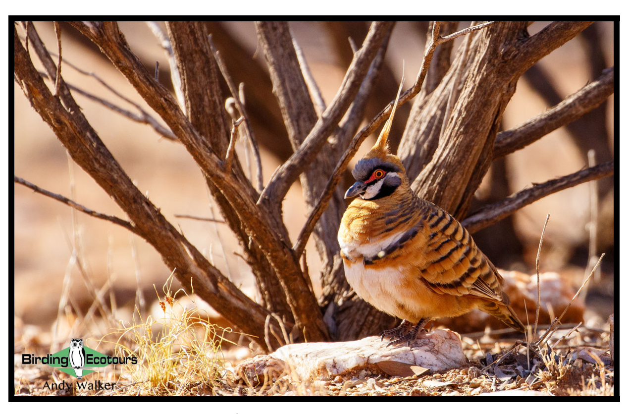
The striking Spinifex Pigeon is one of our targets on this trip.