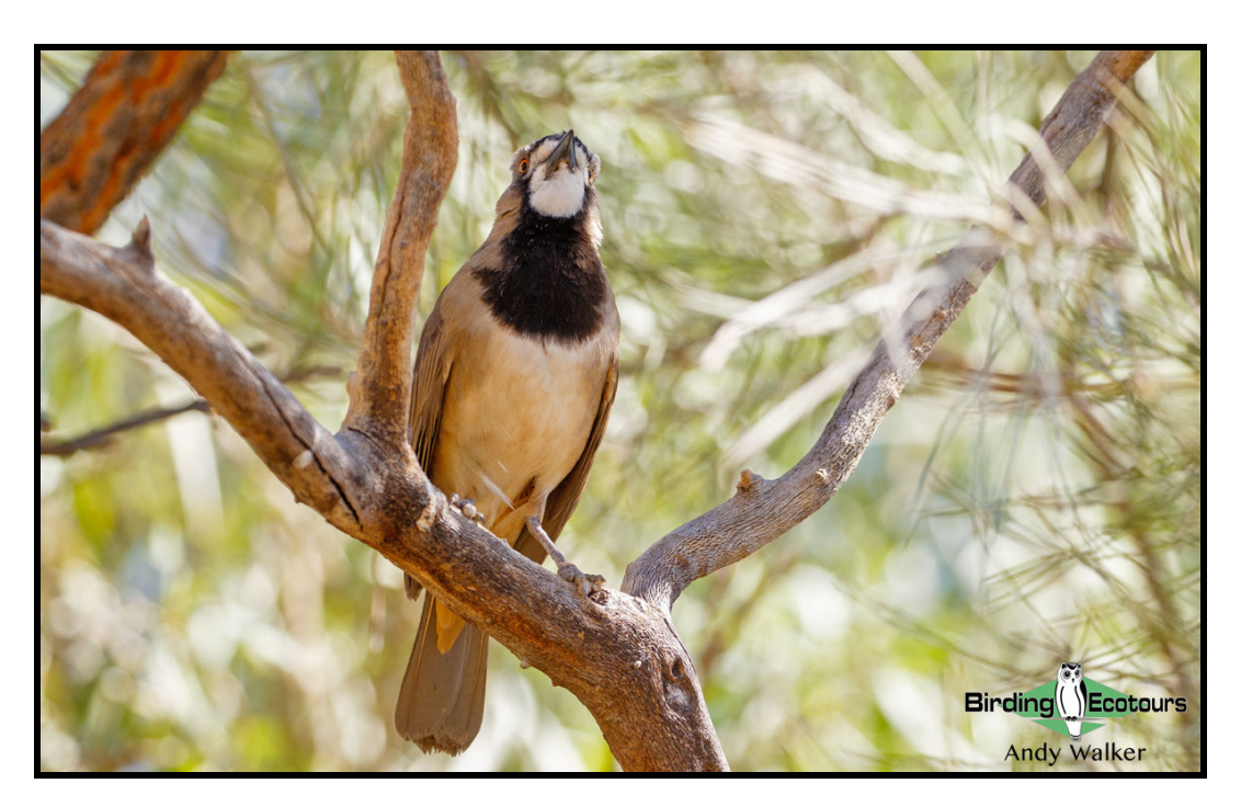
The song of Crested Bellbird is spectacular as it rings out through the desert.

We will also venture out from the city into the 'desert' areas too, where we will look for some different and highly sought-after species such as Rufous-crowned Emu-wren, Spinifexbird,