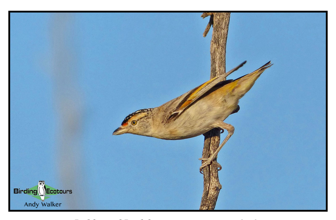
Red-browed Pardalotes are gorgeous, tiny birds.