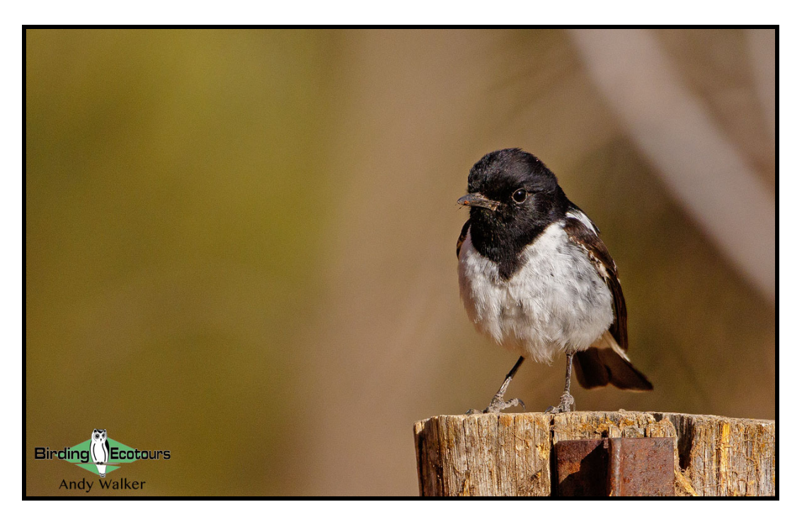
Hooded Robin is a delightful bird, and we should find this as we bird our way around Alice Springs.