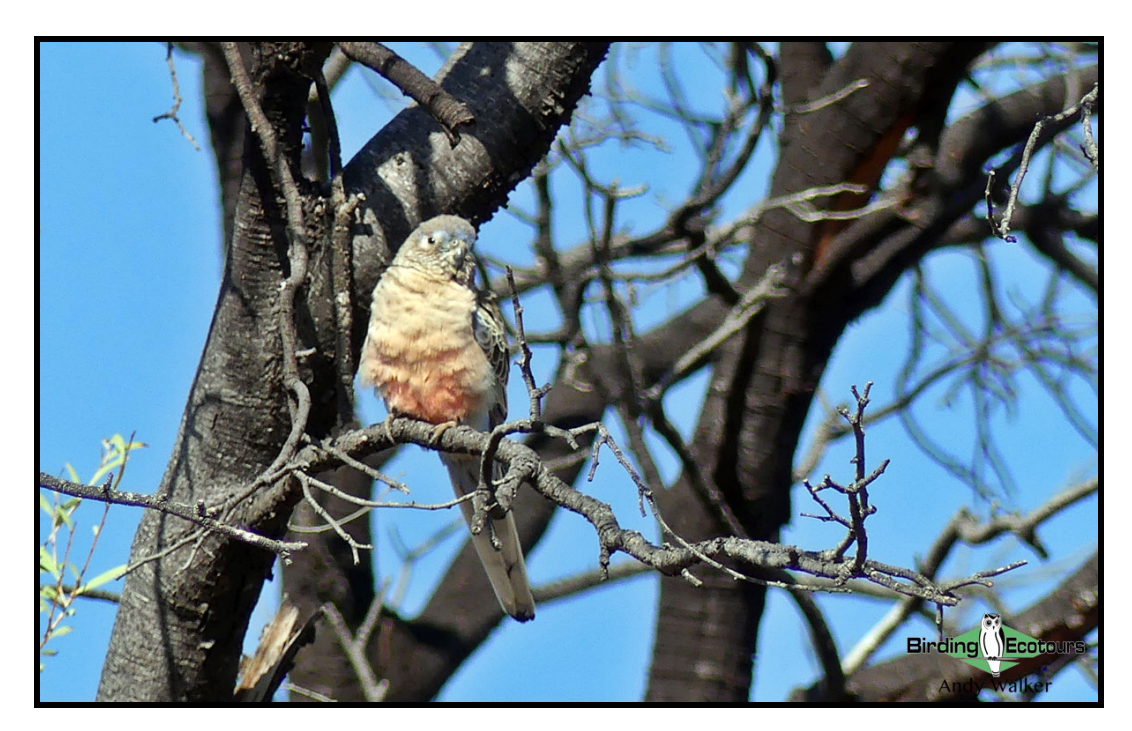
Bourke's Parrots are tough to see during the daytime as they are crepuscular. We will visit a waterhole where we will hope to see them coming in to drink at dusk.

Dusky Grasswren, Banded Whiteface, Bourke's Parrot, Crested Bellbird, Slaty-backed Thornbill, Red-browed Pardalote, and White-browed Treecreeper.