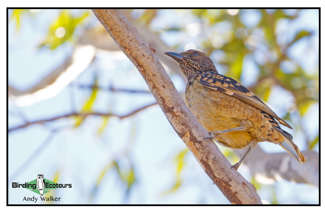
We will look for Western Bowerbird that can be found at their bowers in the city – an impressive garden bird!

Two full days birding the Alice Springs area. There are several sites within close proximity to Alice Springs (even inside the city limits) and we will have morning and afternoon sessions at a range of these sites, such as the old telegraph station, the botanic gardens, the desert park, and the local back roads. Some of the species we could find here include Spinifex Pigeon, Western Bowerbird, Grey Honeyeater, Pied Honeyeater, Black Honeyeater, Hooded Robin, Painted Finch, Black-breasted Buzzard, Little Eagle, Galah, Australian Ringneck, Diamond Dove, Black-eared Cuckoo, Crimson Chat, Splendid Fairywren, Mistletoebird, Rainbow Bee-eater, Zebra Finch, Grey-crowned Babbler, White-browed Babbler, Torresian Crow, Little Crow, Australian Boobook, and Red-browed Pardalote.