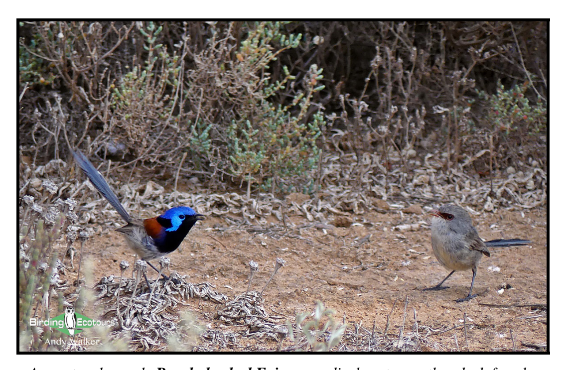
A spectacular male Purple-backed Fairywren displays to a rather drab female.