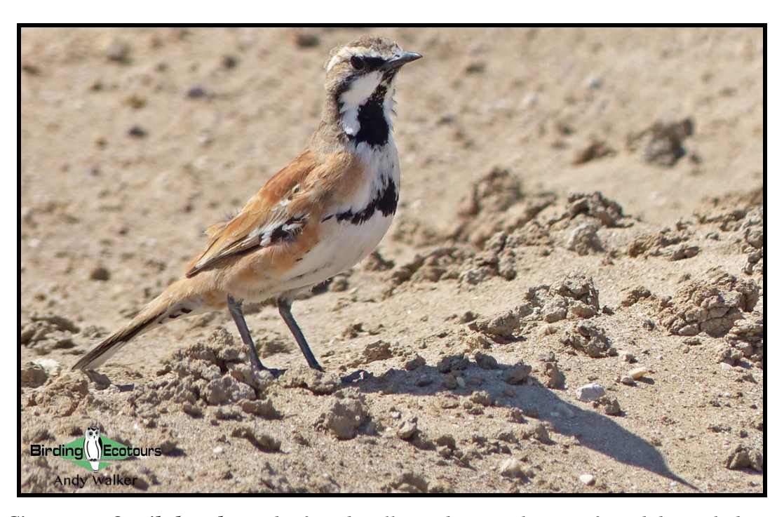
Cinnamon Quail-thrush can be found walking about in their preferred desert habitat.