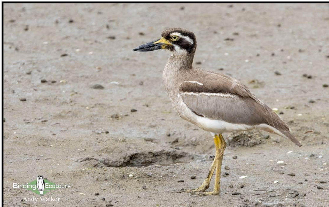
A sighting of Beach Stone-curlew would be a highlight.