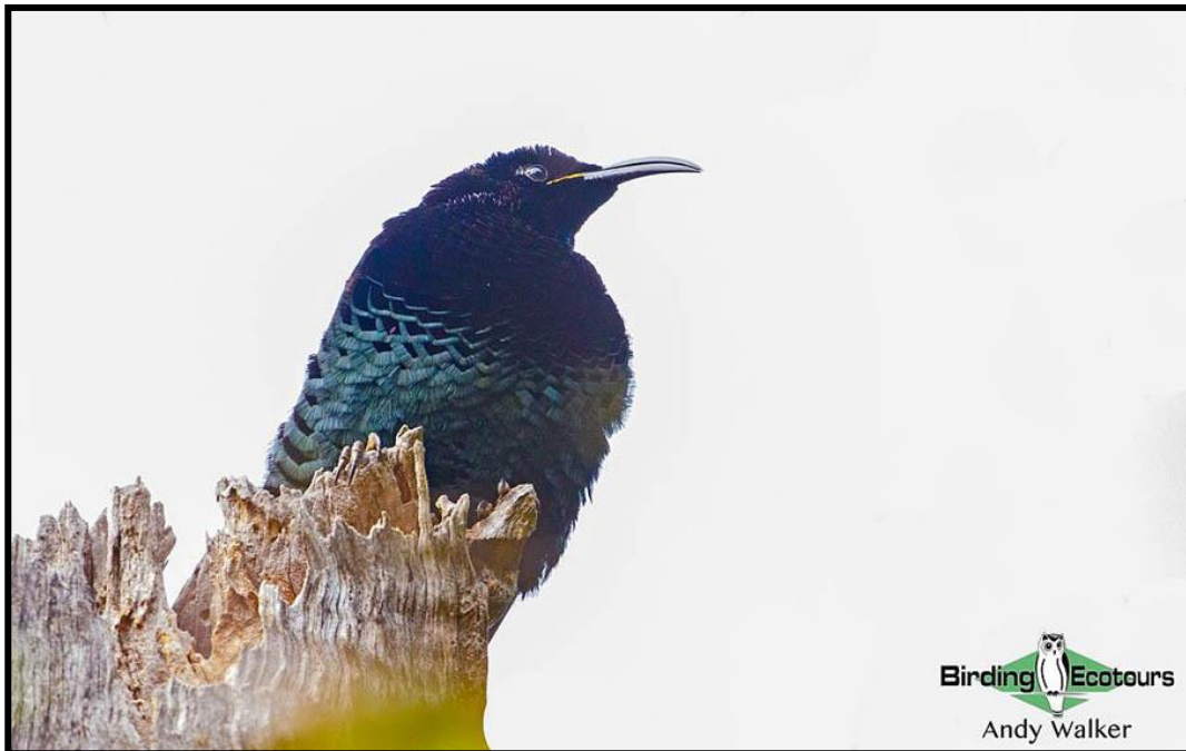
The Lamington area will offer us our first chance at seeing a bird-of-paradise; this being a Paradise Riflebird .