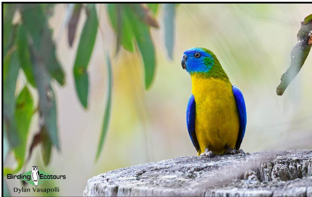
Parrots are sure to continually impress during this tour, this is Turquoise Parrot .