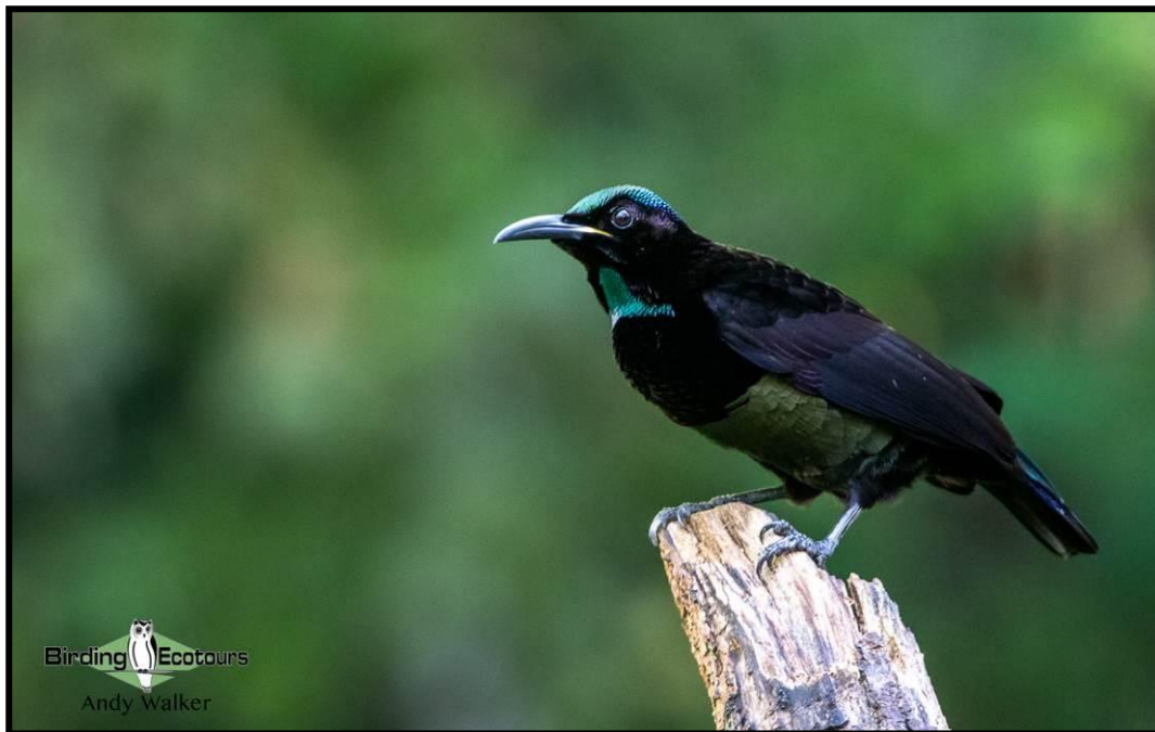
One of the other birds-of-paradise possible on this tour – Victoria's Riflebird.

The early morning activity around our accommodation is usually a wonderful experience and we will look for, and listen to Spotted Catbird , Victoria's Riflebird , Yellow-breasted Boatbill , Australian Golden Whistler , Grey-headed Robin , Superb Fruit Dove , Wompoo Fruit Dove , Brown Cuckoo-Dove , Macleay's Honeyeater , Scarlet Myzomela , and Forest Kingfisher .