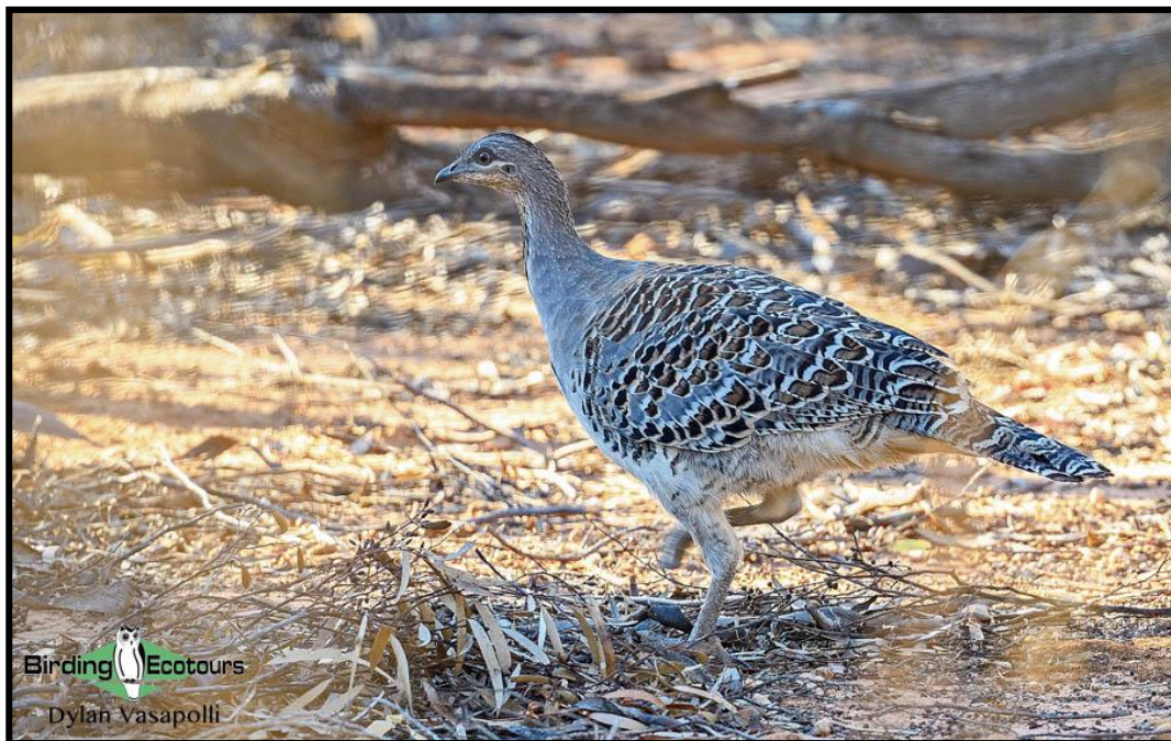
A top target while in mallee habitat will be Malleefowl .

Founded in 1921, Wyperfeld National Park protects a significant tract of semi-arid mallee woodland and heathland. Depending on local conditions we may visit this site as we are passing. High on our list of priorities here would be the appropriately named Malleefowl , Splendid Fairywren , and Southern Whiteface , and other birds of the dry Australian interior are also possible.