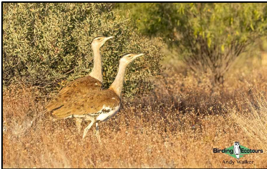
A bird of the dry country, we will be looking for Australian Bustards as we come off the Atherton Tablelands.