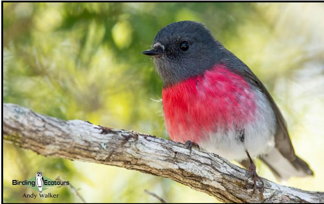
Rose Robin is one of the five gorgeous Australasian Robin species we can see outside of Melbourne.