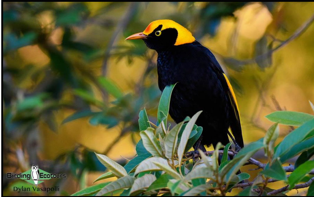
Gorgeous Regent Bowerbirds are often present around our rooms!