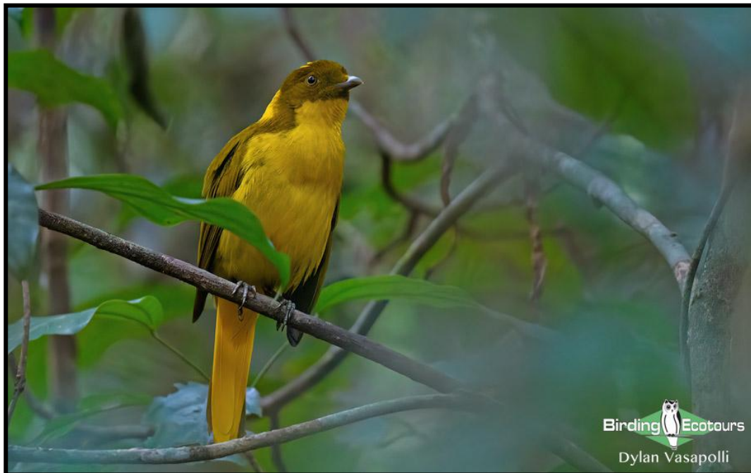
Seeing a bright male Golden Bowerbird in the forests is a sight to behold.

We will spend some time in the morning looking for Southern Cassowary . There are often other great birds to be found around Mission Beach, and we will try to locate these during the morning before departing and heading up into the Atherton Tablelands. Some other birds we might find while looking for the ancient dinosaur-like bird, might include Australian Swiftlet , Fairy Gerygone , Yellow-spotted Honeyeater , Spectacled Monarch , Black Butcherbird , Green Oriole , and Dusky Myzomela .