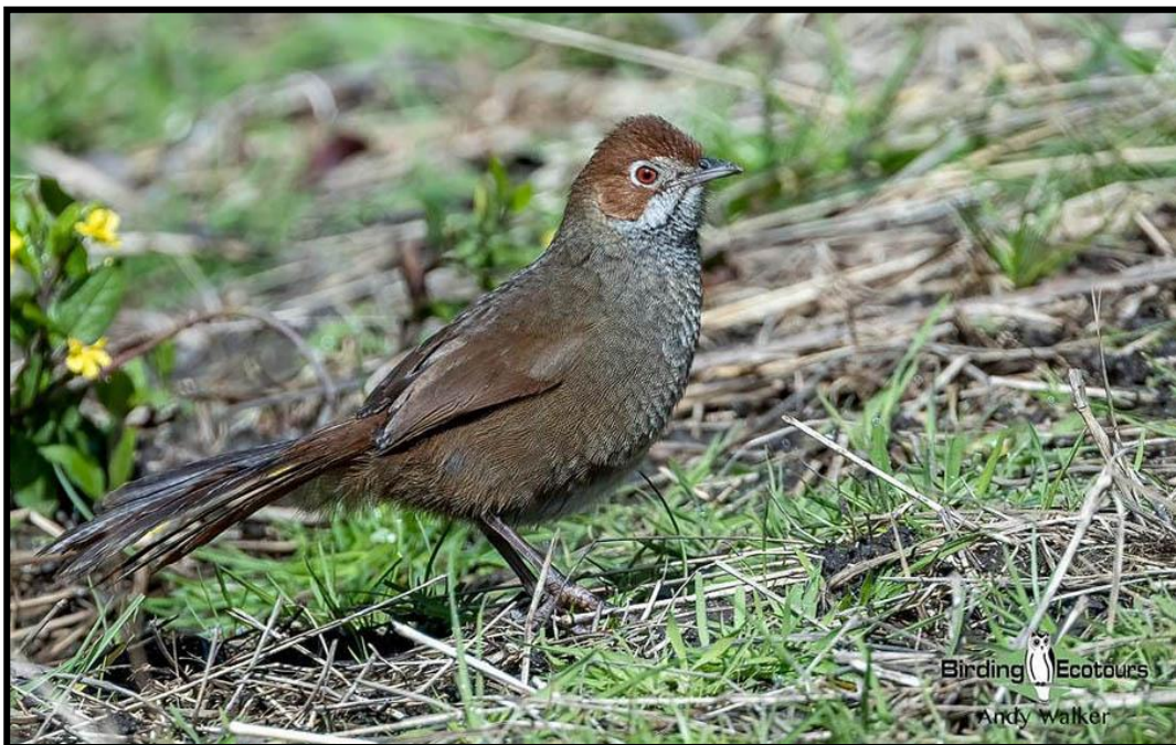
The localized Rufous Bristlebird is our top target at Aireys Inlet.