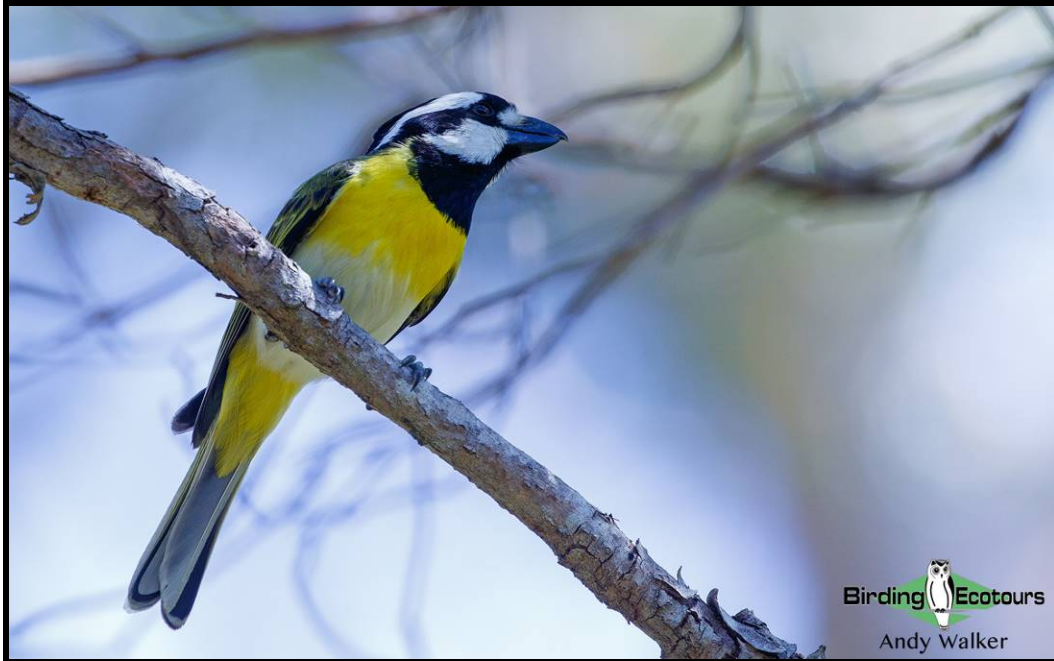
Western Shrike-tit is a recent split and found in the southwest of Western Australia.

For those wishing to explore Australia further, this tour can be combined with our Birding Tour Australia: Northern Territory – Alice Springs and Uluru Birding Tour and our Birding Tour Australia: Northern Territory – Top End Birding Tour , both of these tours precede this Western Australia birdwatching tour.