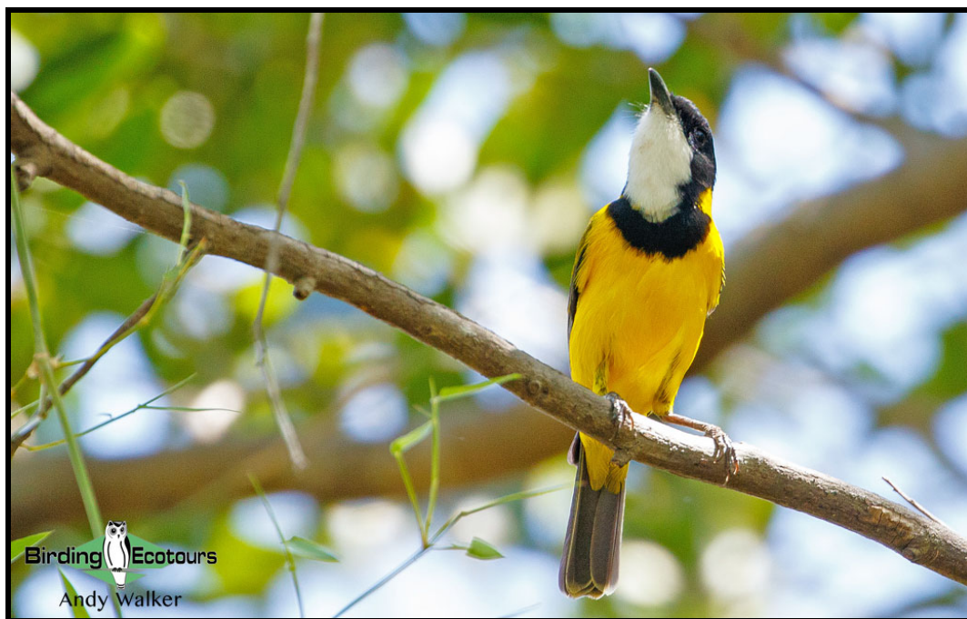
The stunning and localized Mangrove Golden Whistler will be a target in the Top End.

tailed Eagle, Red Goshawk, Pacific Baza, and Black-breasted Buzzard. Numerous localized species can be found here too such as Black-banded Fruit Dove , Chestnut-quilled Rock Pigeon , Partridge Pigeon , Mangrove Golden Whistler , Black-tailed Treecreeper , Sandstone Shrikethrush , Great Bowerbird , Cockatiel , and White-lined Honeyeater to name a few.