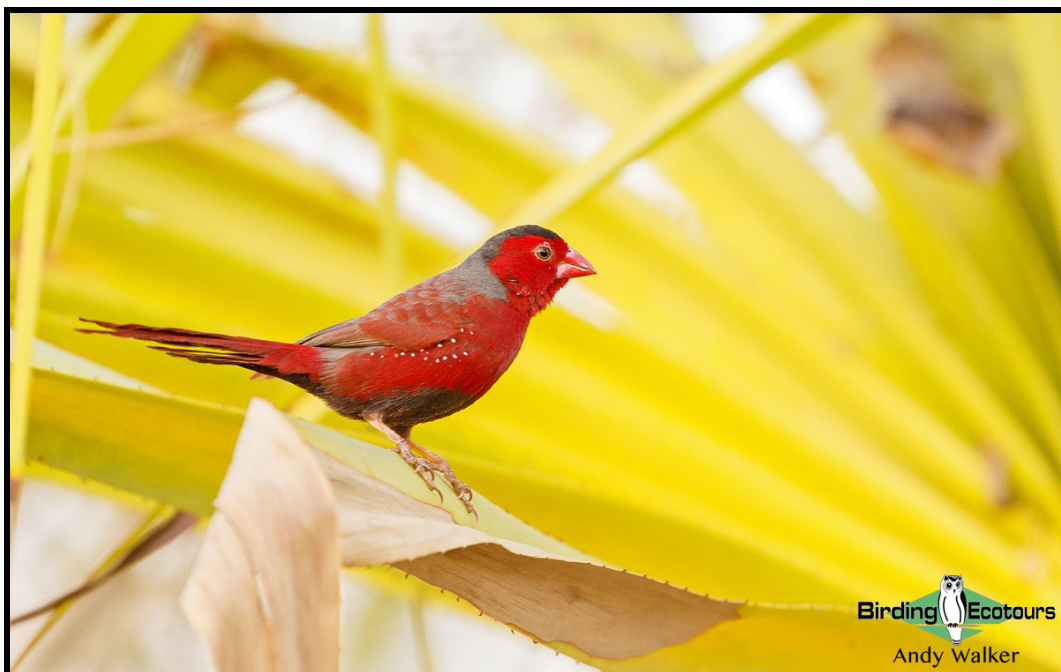
Crimson Finch is another finch species we hope to find on this tour.

As we spend the day exploring other areas nearby, we will look out for several other species that we may have yet to see during the tour, such as Apostlebird , Australian Bustard , Black-fronted Dotterel , Red-kneed Dotterel , Fairy Martin , Grey-crowned Babbler , Diamond Dove , Common Bronzewing , and Spotted Harrier .