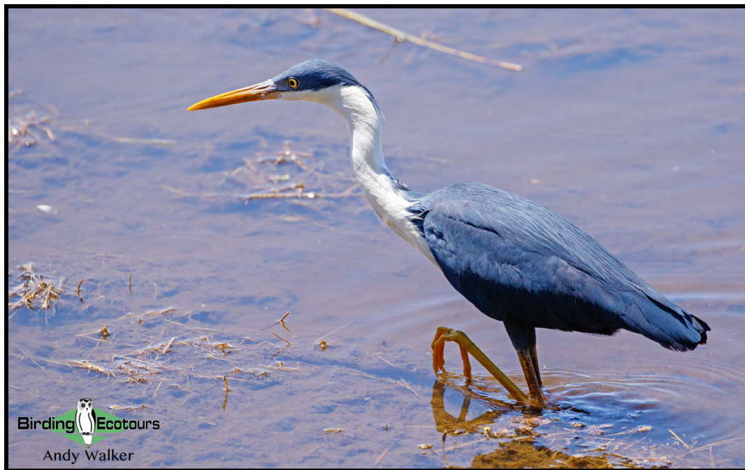
The tiny Pied Heron is sure to delight.

Our route into Kakadu National Park takes us through great habitat and we will keep our eyes peeled for roadside Silver-backed Butcherbird , Northern Rosella , Black-breasted Buzzard , and Wedge-tailed Eagle . There are several excellent waterholes (known as billabongs here) and we will stop and check a few of them where we could find Magpie Goose , Wandering Whistling Duck , Raja Shelduck , Hardhead , Australasian Swamphen , Brolga , Comb-crested Jacana , Australian Tern , Whiskered Tern , Australasian Darter , Australian Pelican , Pied Heron , and Black-necked Stork . Some of the above are often present in flocks of several hundred and offer a spectacular sight (and sound).