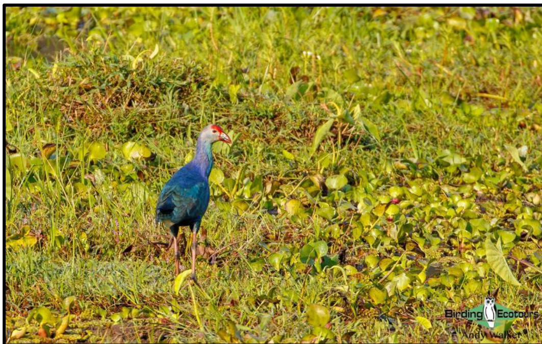
The huge and colorful Grey-headed Swamphen is another range-restricted species in the Western Palearctic, since being split from Western Swamphen, which we see in Spain .

Wallcreeper and Bearded Reedling (Tit), both monotypic families are also possible on this tour. These interesting and rare species are the real attraction of birding in Azerbaijan in winter. However, we will also come across a wide range of more common wildfowl, shorebirds (waders), birds of prey, and passerines that spend the winter in this fascinating part of the world. We will also look for a range of mammals with Goitered Gazelle , Red Fox , (European) Grey Wolf , Small Five-toed Jerboa , and Jungle Cat all being possible.