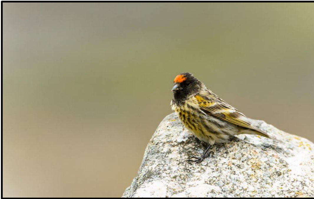
The rocky landscapes around Mingachevir are the perfect habitat for the beautiful Red-fronted Serin.

Griffon Vulture, Cinereous Vulture, Eurasian Goshawk, Hen Harrier, Western Marsh Harrier, Peregrine Falcon, Merlin, and White-tailed Eagle all add to the spectacle.