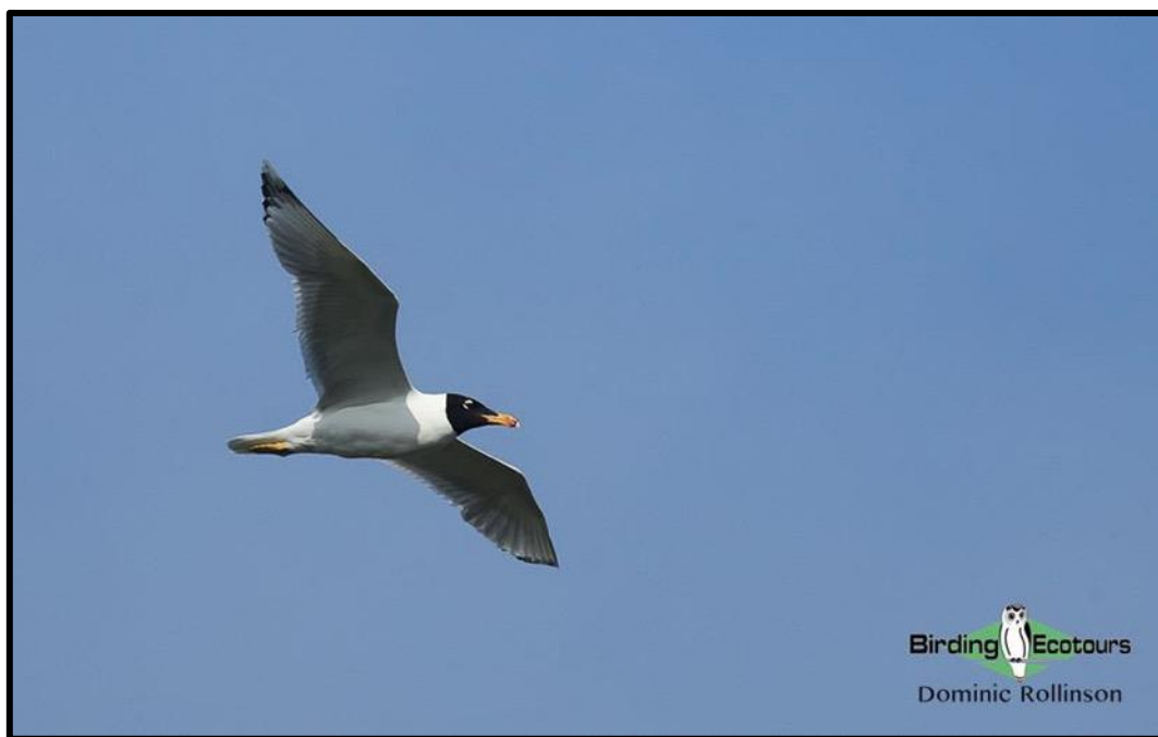
The elegant Pallas's Gull is a range-restricted species in the Western Palearctic, with Azerbaijan being one of the best places in the world to see this large gull.

We must also be sure to scan the large gull flocks that can winter here. As well as the more numerous Black-headed Gull , Common Gull , Little Gull , and Caspian Gull , we may also come across Pallas's Gull . This giant of a gull has a restricted range in the Western Palearctic, with just a smattering of wintering areas found around the Caspian Sea and Red Sea, with breeding territories in southern Ukraine, so not an easy species to catch up with in general.