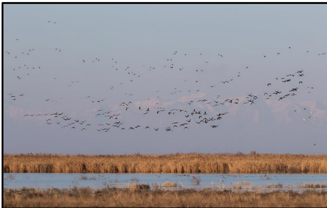
The Agh Gol National Park is an amazing birding area during the winter. The snow-capped Lesser Caucasus Mountains creating a stunning backdrop.