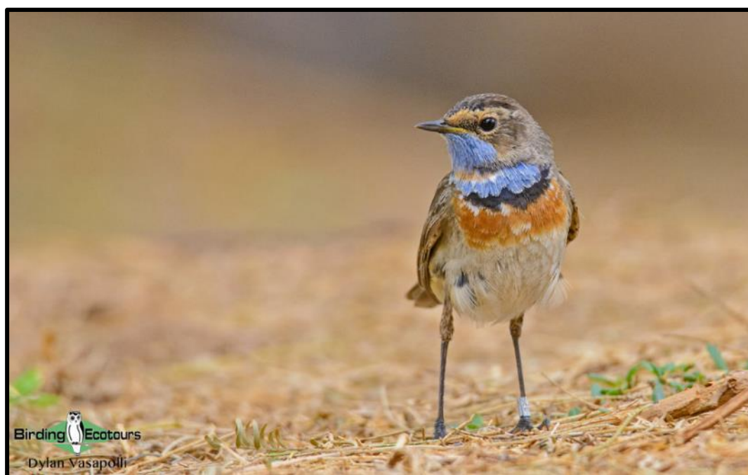
Bluethroat is a very pretty passerine which we hope to encounter on this tour.

The river valley bushes should hold a range of passerines including good numbers of buntings and finches, like Rock Bunting , Corn Bunting , Yellowhammer , Brambling , and Hawfinch . Wintering thrushes should also be in attendance with Redwing , Fieldfare , Ring Ouzel , Common Blackbird , Song Thrush , and Mistle Thrush all likely to be present. We may also get the chance of finding locally rare woodpeckers, like Great Spotted Woodpecker and European Green Woodpecker here.