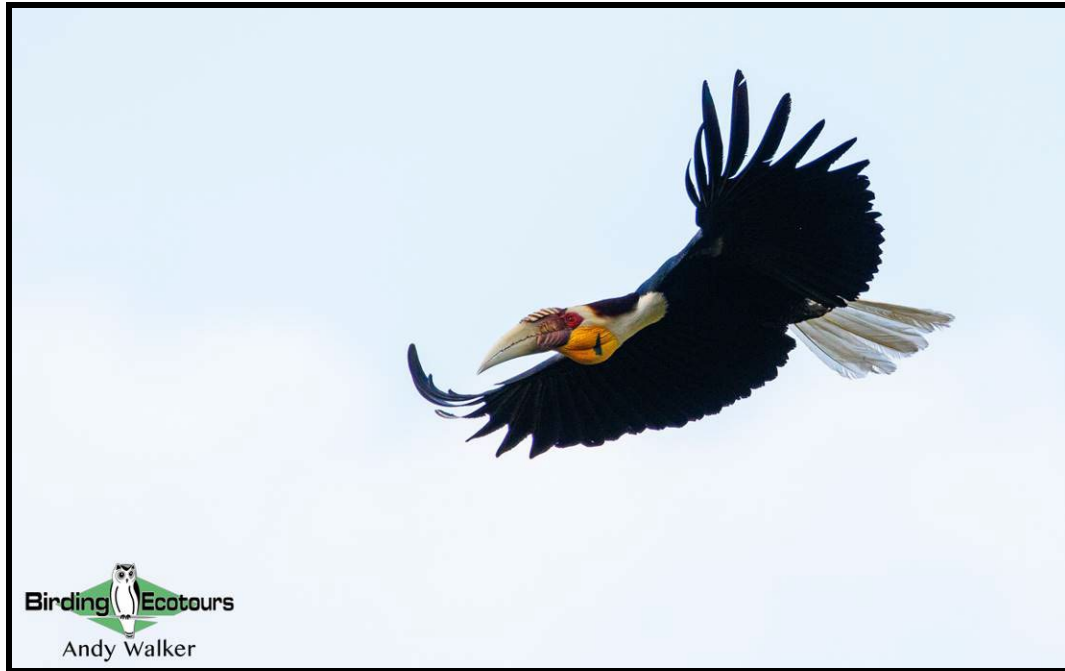
Wreathed Hornbill is yet another spectacular bird to be found in East Java.