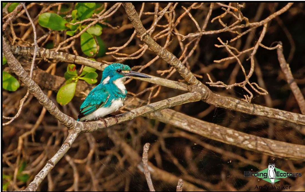
The tiny Cerulean Kingfisher is strikingly plumaged and sure to delight.