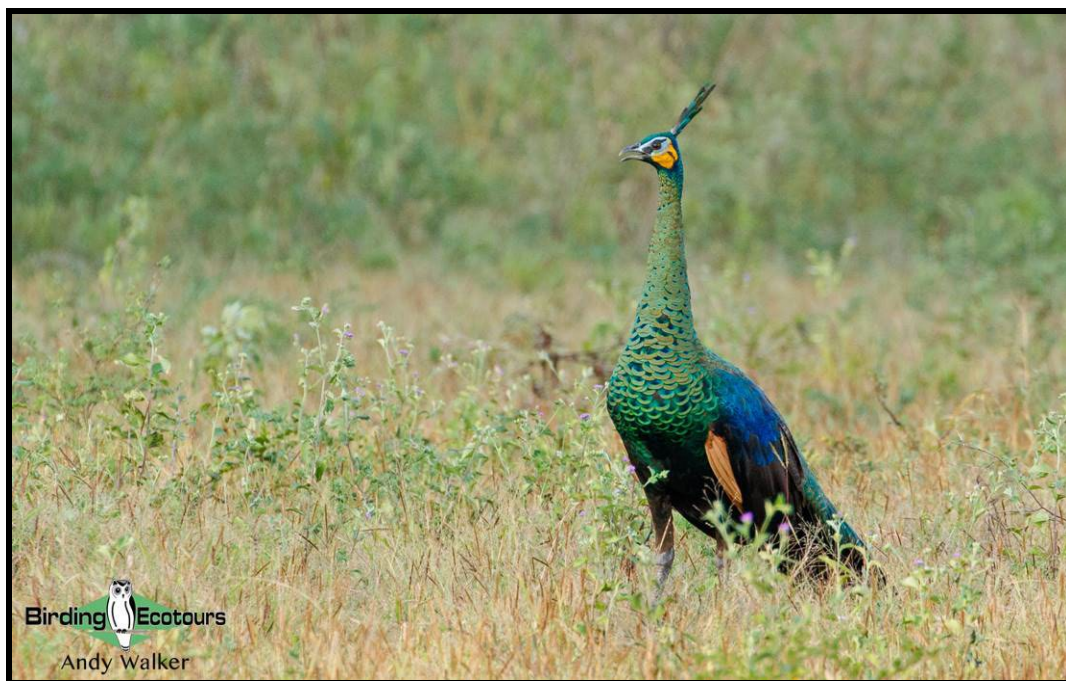
The absolutely gorgeous (Javan) Green Peafowl can be found at Baluran and Alas Purwo National Parks in East Java.

Baluran is a national park that is more reminiscent of East Africa or India than much of the rest of Southeast Asia with vast tracts of savanna habitat, but this park also includes monsoon deciduous forest and evergreen forest. It offers a good chance to find the highly sought-after Javan Flameback , along with (Javan) Green Peafowl . It is also one of the best places to look for the local subspecies of Black-winged Starling (known and split by some as Grey-backed Starling or Grey-backed Myna).