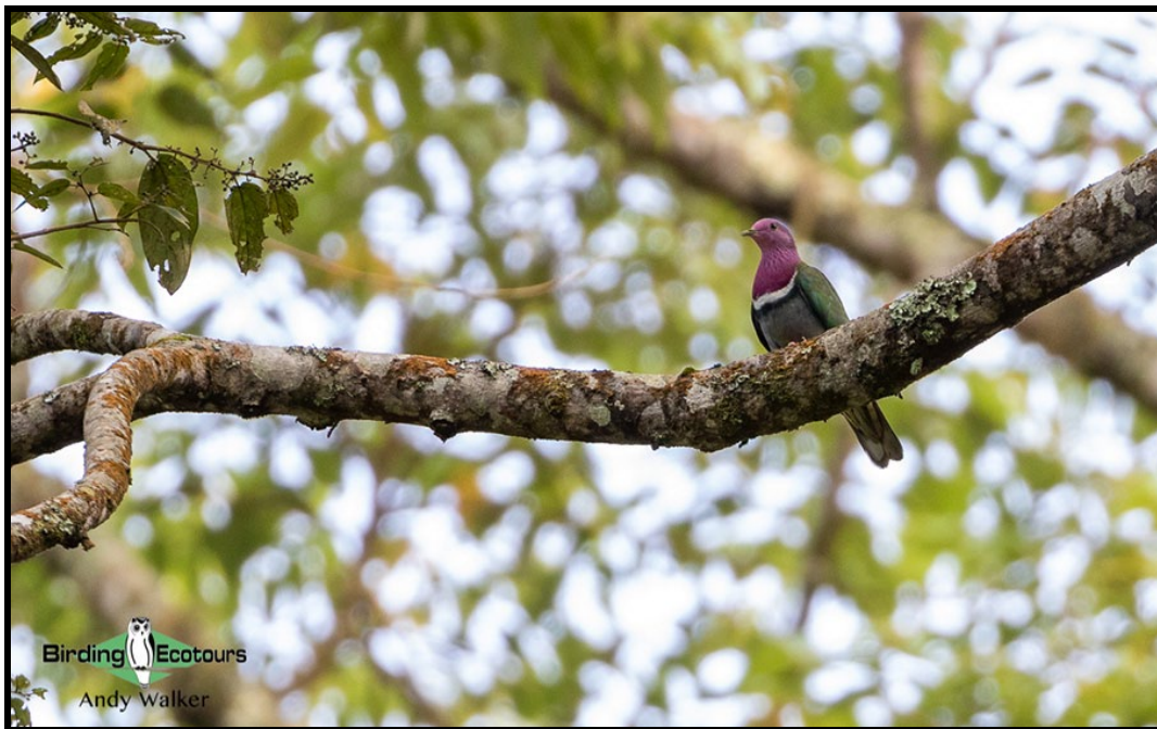
The spectacular Pink-headed Fruit Dove is a top target while at Mount Ijen.

There are multiple jaw-dropping targets for us over our two days birding Mount Ijen and some of these may include the very rarely seen Grey-breasted (White-faced) Partridge , the local form of Scaly (Horsfield's) Thrush , the simply stunning Pink-headed Fruit Dove , and tons of other high-quality birds, like Javan Hawk-Eagle , Javan Kingfisher , Black-banded Barbet , Indigo Flycatcher , Crimson-winged Woodpecker , Checker-throated Woodpecker (Javan Yellownap) , Sunda Minivet , Sunda Cuckooshrike , White-bellied Fantail , Javan Bulbul , Sunda Bush Warbler , Sunda Warbler , Horsfield's Babbler , Blue Nuthatch , Lesser Shortwing , Pied Shrike-babbler , (Javan) Banded Broadbill , White-flanked Sunbird , and Javan Leafbird . It is a real privilege to be able to bird this area, knowing that not many birders have had the opportunity to explore it — so much potential for additional exciting finds here.