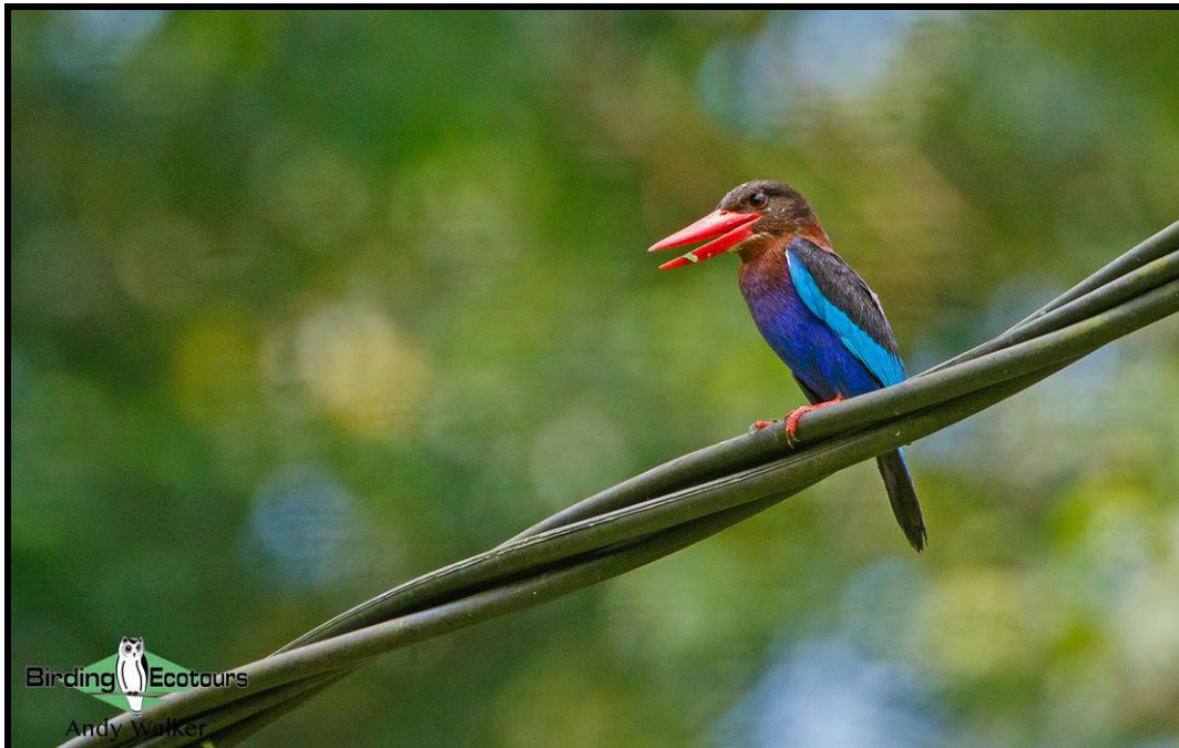
The stunning Javan Kingfisher is found only in Java and Bali.

The list of potential non-passerine highlights is just as vast and includes Grey-breasted (White-faced) Partridge , Green Junglefowl , (Javan) Green Peafowl , Sunda Teal , Javan Hawk-Eagle , Javan Owlet , Beach Stone-curlew , Javan Plover , Great-billed Heron , Lesser Adjutant , White-tailed Tropicbird , Christmas Frigatebird , Pink-headed Fruit Dove , Black-naped Fruit Dove , Banded Fruit Dove , Dark-backed Imperial Pigeon , Grey-cheeked Green Pigeon , Orange-breasted Green Pigeon , Cave Swiftlet , Sunda Cuckoo , Sunda Coucal , Javan Kingfisher , Cerulean Kingfisher , Javan Flameback , Great Slaty Woodpecker , Crimson-winged Woodpecker , Checker-throated Woodpecker (Javan Yellownap), Grey-and-buff Woodpecker , Buff-rumped (Zebra) Woodpecker , Oriental (Sunda) Pied Hornbill , Wreathed Hornbill , Rhinoceros Hornbill , and Yellow-throated Hanging Parrot .