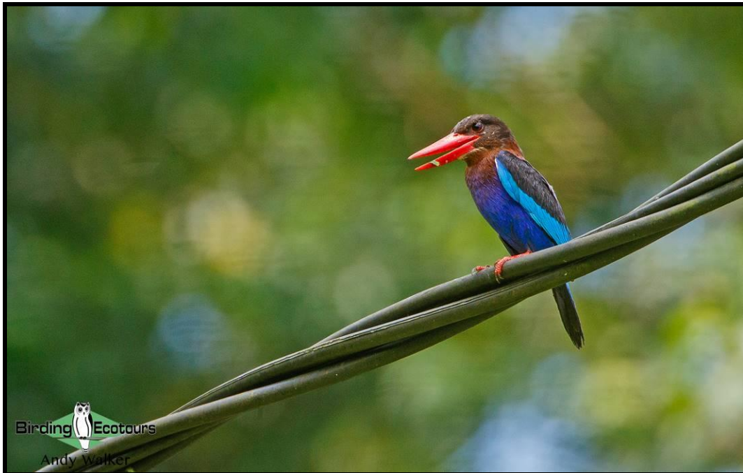
The stunning Javan Kingfisher is found only in Java and Bali.

The list of potential non-passerine highlights is just as vast and includes Grey-breasted (White-faced) Partridge, Green Junglefowl, (Javan) Green Peafowl, Sunda Teal, Javan Hawk-Eagle, Javan Owlet, Beach Stone-curlew, Javan Plover, Great-billed Heron, Lesser Adjutant, White-tailed Tropicbird, Christmas Frigatebird, Pink-headed Fruit Dove, Black-naped Fruit Dove, Banded Fruit Dove, Dark-backed Imperial Pigeon, Grey-cheeked Green Pigeon, Orange-breasted Green Pigeon, Cave Swiftlet, Sunda Cuckoo, Sunda Coucal, Javan Kingfisher, Cerulean Kingfisher, Javan Flameback, Great Slaty Woodpecker, Crimson-winged Woodpecker, Checker-throated Woodpecker (Javan Yellownap), Grey-and-buff Woodpecker, Zebra Woodpecker, Oriental (Sunda) Pied Hornbill, Wreathed Hornbill, Rhinoceros Hornbill, and Yellow-throated Hanging Parrot.