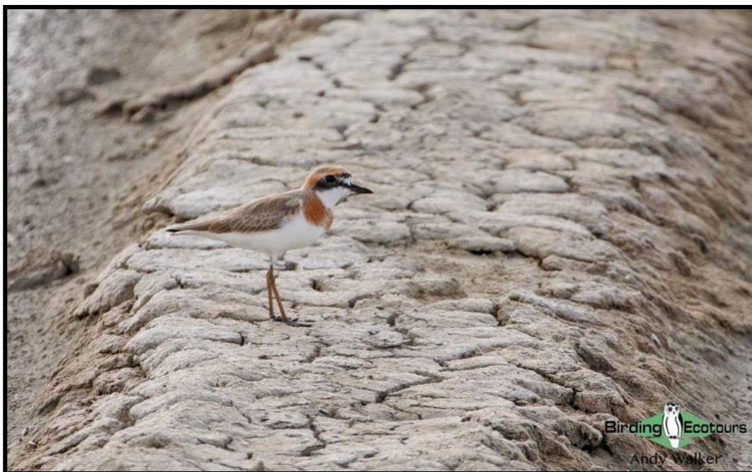
Greater Sand Plover overwinters in the saltpans and by March are starting to color up nicely.