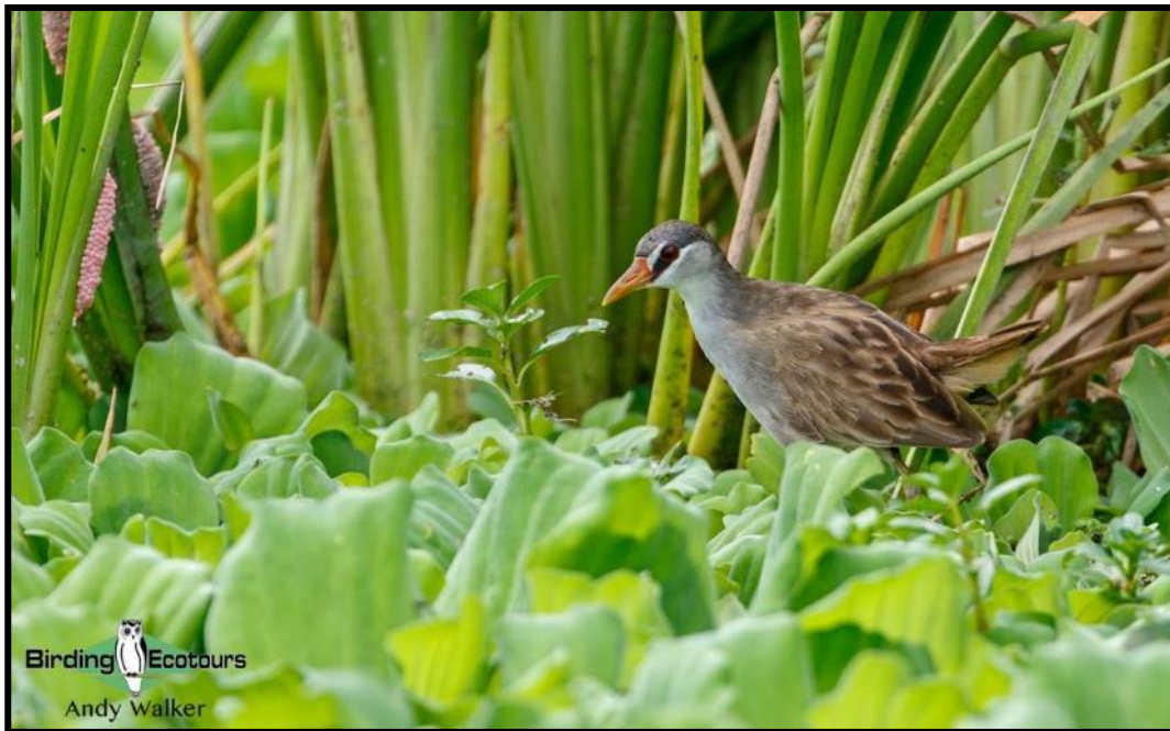
Secretive White-browed Crakes can be found in coastal marshes on Bali.

There are several coastal birding sites not far from Ubud that can be included in a great full day of birding. We can usually find secretive species here, such as White-browed Crake , Ruddy-breasted Crake , Barred Buttonquail , Greater Painted-snipe , and Yellow Bittern , along with Javan Plover , Cerulean Kingfisher , Javan Kingfisher , Collared Kingfisher , Blue-eared Kingfisher , Savanna Nightjar , Golden-headed Cisticola , (Double) Zitting Cisticola , migrant shorebirds including Swinhoe's Snipe , Pin-tailed Snipe , Pacific Golden Plover , Oriental Plover , and Australian Pratincole , along with Streaked Weaver and White-headed Munia . During the northern winter months Eastern Yellow Wagtail and Pallas's Grasshopper Warbler can be found too.