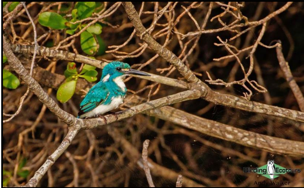
The tiny Cerulean Kingfisher is strikingly plumaged and sure to delight.