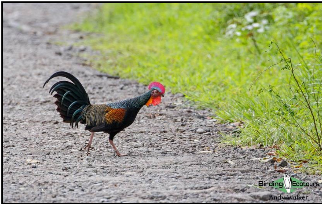
Green Junglefowl is an attractive bird and Bali is a great place to see this species.

Please note that roads are generally narrow and congested, and so journey times may take longer than expected, especially if there is a religious ceremony, when roads can be closed without warning.