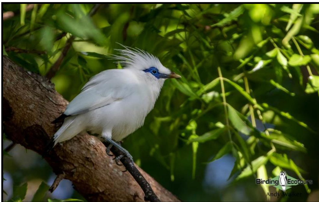
Bali Myna is always one of the top targets when birding at Bali Barat National Park.