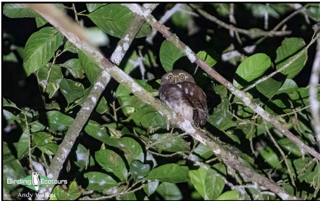
Javan Owlet is unusual for Glaucidium owls as it is predominantly nocturnal.

Javan Scimitar Babbler, Dark-backed Imperial Pigeon, Banded Fruit Dove, Sunda Thrush, Javan Whistling Thrush, Mountain Leaf Warbler, and Sunda Warbler.