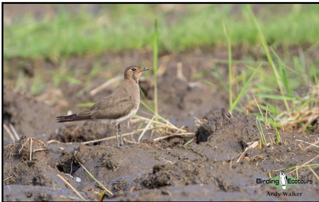
Oriental Pratincole can occur in the rice paddies around Bali.