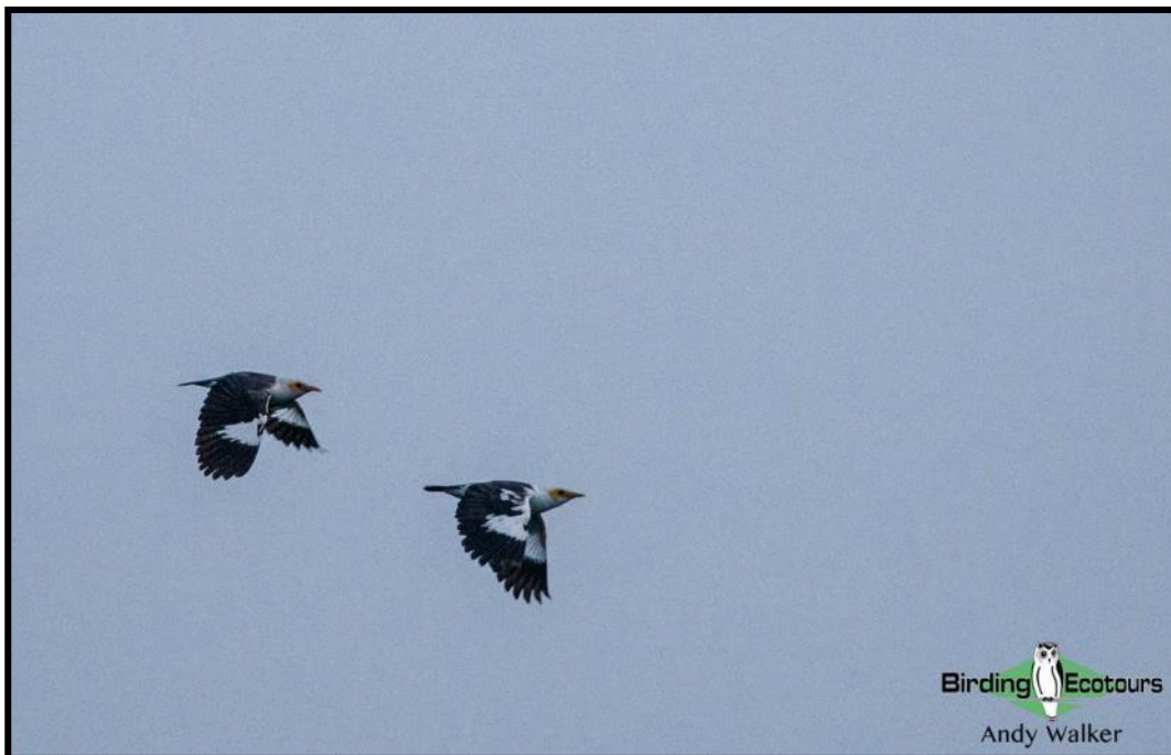
Black-winged Myna is another rare bird found in Bali Barat National Park.

A stay of a couple of days around the Bali Barat National Park area can be incredibly rewarding with lots of rare and localized species and subspecies possible, including highly sought-after birds such as Javan Banded Pitta , Javan Cuckooshrike , Hair-crested (Javan Spangled) Drongo ,