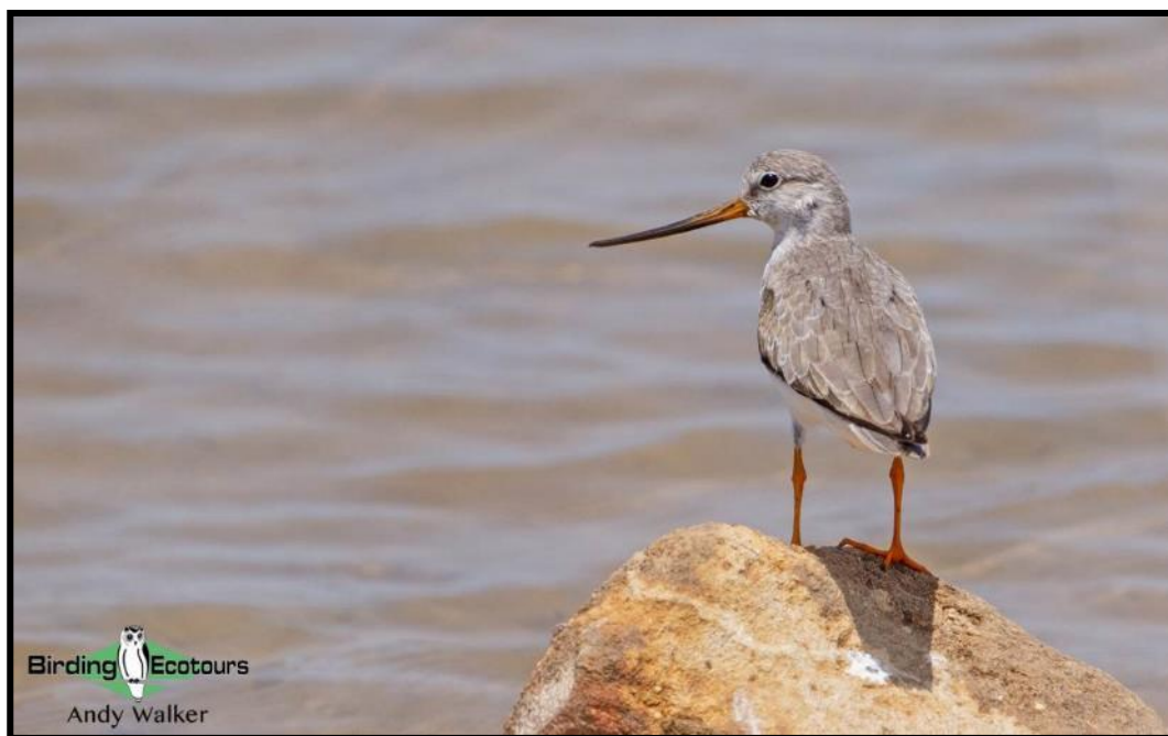
Terek Sandpiper is present at the saltpans during the passage/non-breeding season.

The estuaries and mudflats of the local area can be excellent too, with chances of Great-billed Heron, Lesser Adjutant, and Beach Stone-curlew , along with numerous terns, frigatebirds, jaegers, herons, and shorebirds. In the right season, Aleutian Tern might also be possible.