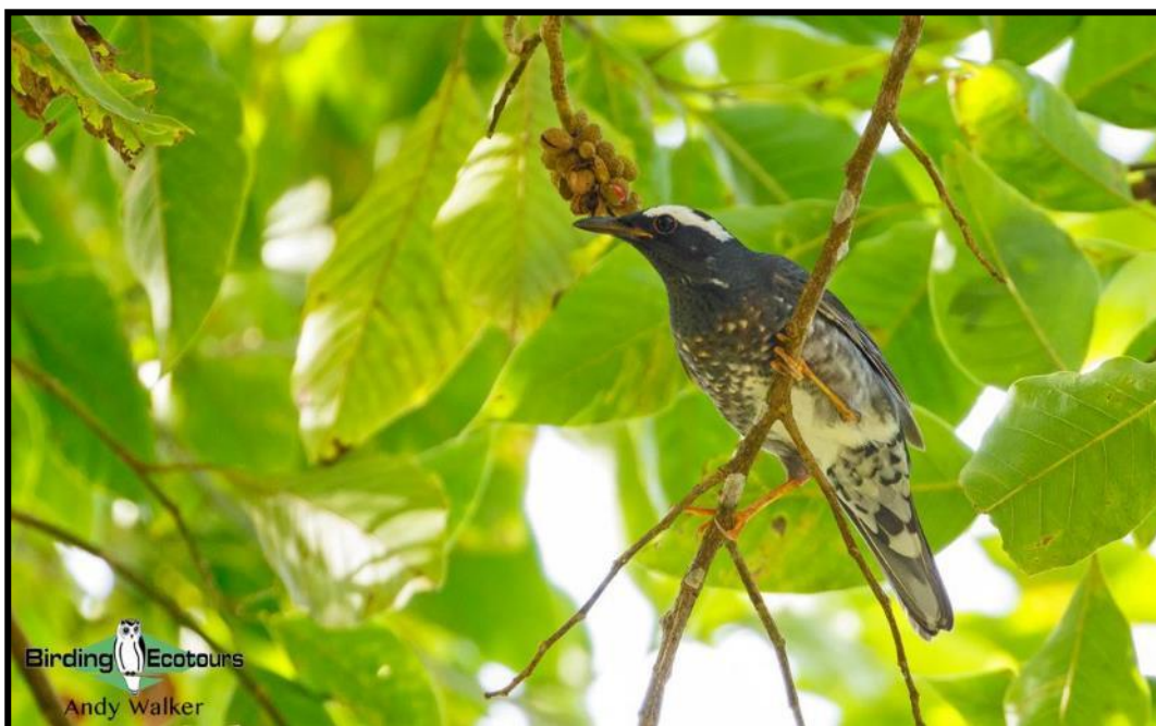
Siberian Thrush is one of several great migrants to be found in the forests.