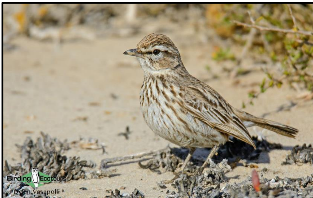
Many species occur here that have 'Karoo' in their names – such as this Karoo Lark .