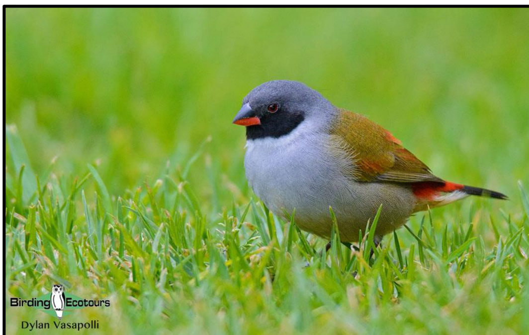
The cute and beautiful Swee Waxbill.

We then head to the small town of Betty's Bay , where we visit the picturesque Harold Porter National Botanical Garden and enjoy lunch after a walk around the gardens. In the gardens we should find African Dusky and African Paradise Flycatchers , Black Saw-wing , Swee Waxbill , Yellow Bishop , and Brimstone and Cape Canaries .