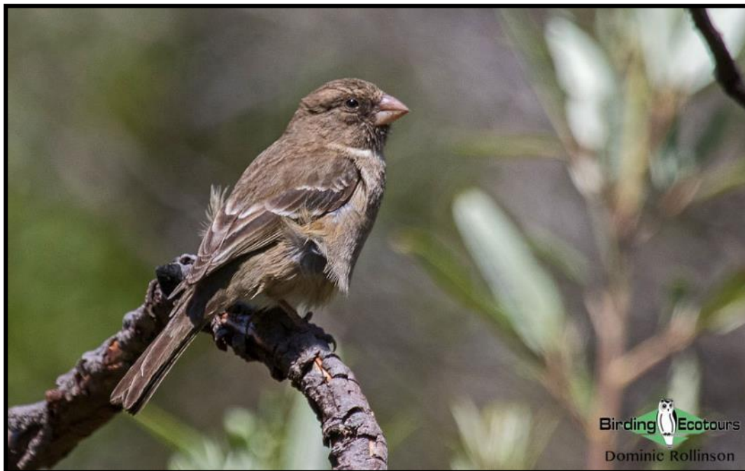
Protea Canary — a Cape endemic