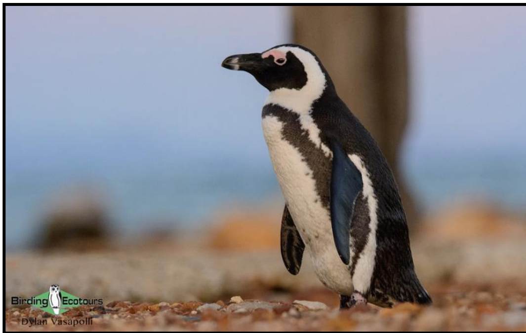
The comical African Penguin is always a highlight in any Cape birding trip!