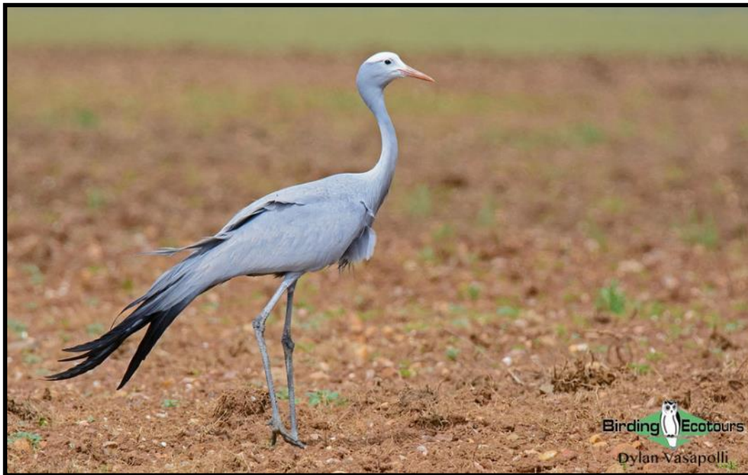
The majestic Blue Crane is commonly encountered on this tour.

Overnight: Le Mahi Guest House, Langebaan.