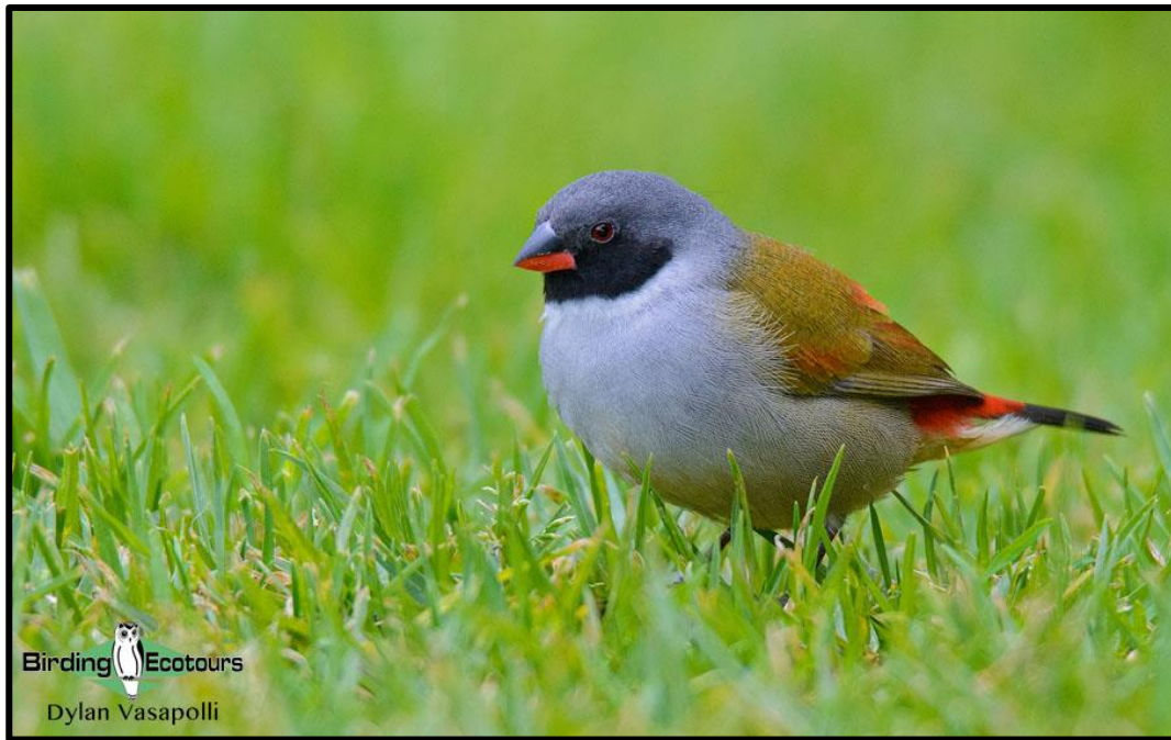
The cute and beautiful Swee Waxbill.

We then head to the small town of Betty's Bay , where we visit the picturesque Harold Porter National Botanical Garden and enjoy lunch after a walk around the gardens. In the gardens we should find African Dusky and African Paradise Flycatchers , Black Saw-wing , Swee Waxbill , Yellow Bishop , and Brimstone and Cape Canaries .