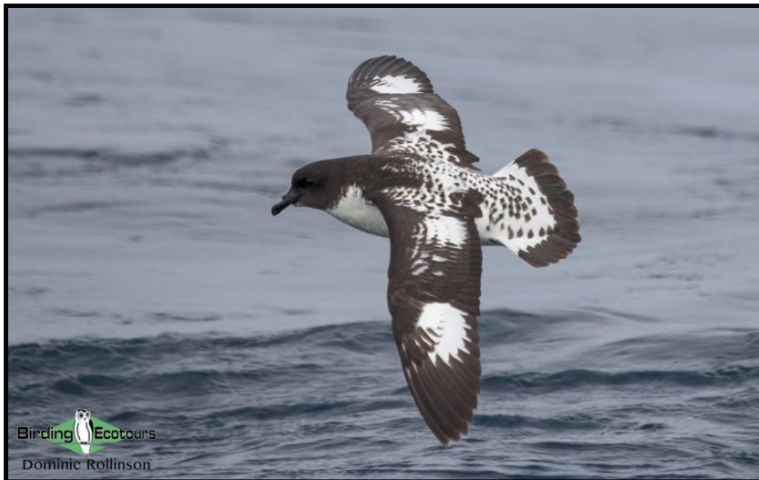
Cape Petrel is usually seen on our pelagic trip on our 8-day Cape tour.

The Western Cape is the most important endemic bird area on the entire African continent. It is a truly essential area for any serious birder because of its sheer number of endemics. Pelagic trips off Cape Town also rank as among the finest in the world (with at least four albatross species, Cape Petrel (seasonal), and many more on the rich trawling grounds near where two oceans meet). The Cape is also a spectacularly scenic area, with the rugged Cape Fold Mountains that come right down to the sea, white sand beaches, sea cliffs on the Cape Peninsula, and beautiful vineyards. Close inshore Southern Right Whales (seasonal) plus a lot of other mammals, spectacular carpets of flowers (seasonal), and the most plant-diverse biome on earth (even richer than the Amazon!) are major attractions that are easily seen incidentally, while not jeopardizing our chances of finding all the birds. We recommend at least a week in the Western Cape. The aim of our standard (set departure) 8-day tour (but we can custom-make a trip of any length) is to find a majority of the endemics of this province, with many other species as an unavoidable byproduct (plus, as always, an amazing overall experience), and of course a lot of pelagic and other seabirds. To find the endemics we budget adequate time in each strategic ecosystem – the fynbos , Langebaan Lagoon , and the Karoo .