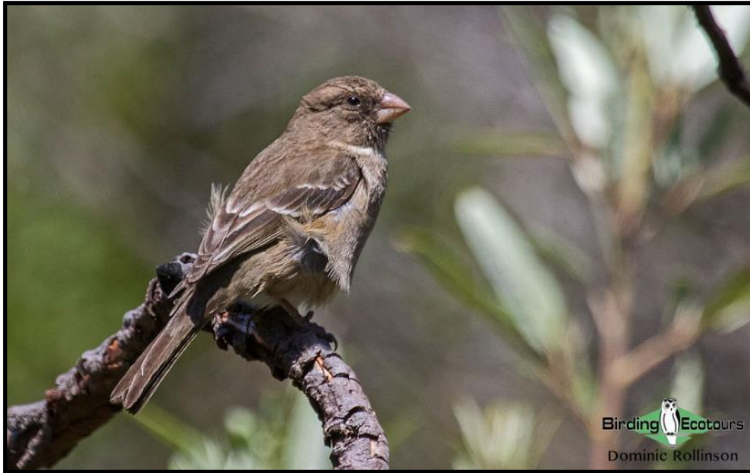
Protea Canary — a Cape endemic