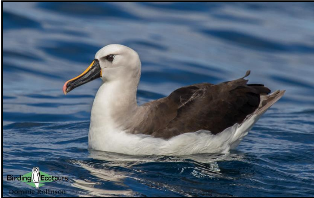
Albatrosses such as this Atlantic Yellow-nosed Albatross are usually seen on our Cape pelagic.

Great , and Cory's Shearwaters , White-chinned Petrels , and the odd Storm Petrel ( Wilson's and European being most common). As we head farther out we will be on the lookout for trawlers, which attract huge numbers of seabirds. If we do find a trawler it normally has a cloud of seabirds behind it, particularly when the nets are being hauled in. Here we can expect to find Shy , Black-browed , Indian Yellow-nosed and Atlantic Yellow-nosed Albatrosses , Northern and Southern Giant Petrels , Cape Petrel , Brown Skua , and occasionally Great-winged Petrel . We will always be on the lookout for Spectacled Petrel , Northern and Southern Royal Albatrosses , and Wandering Albatross which, although considered rare, are seen with some frequency off the Cape.