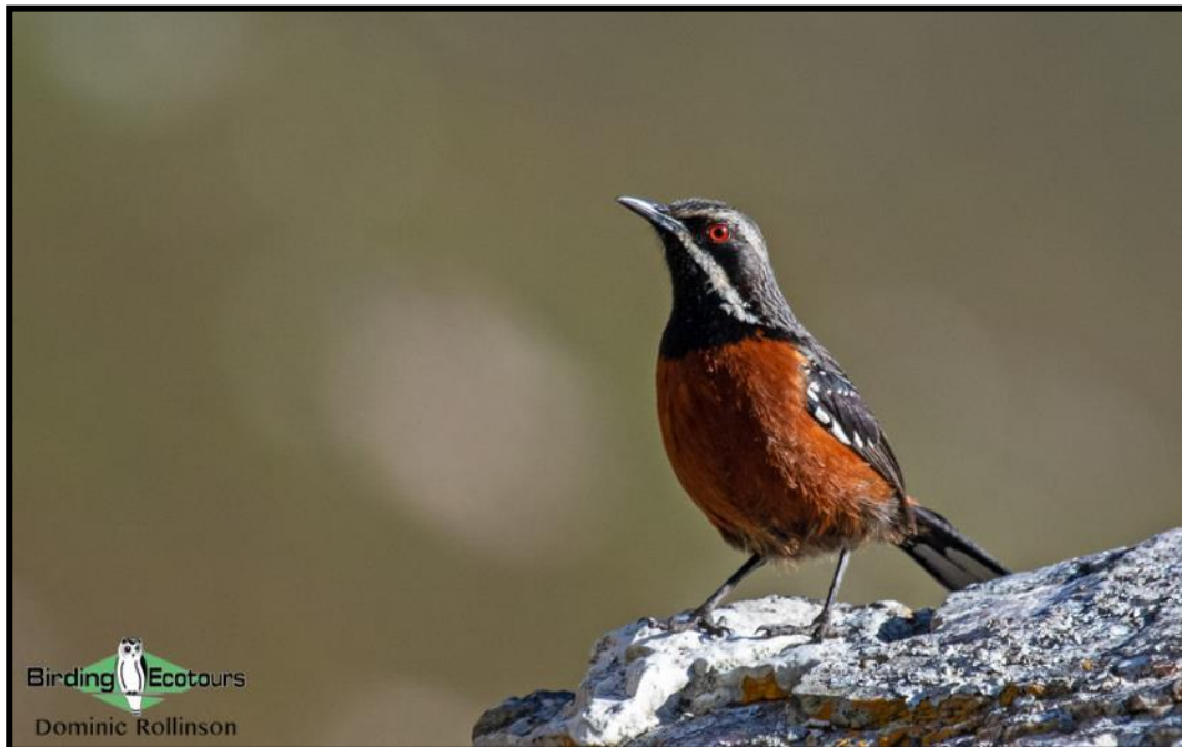
Cape Rockjumper is one of the two species making up the rockjumper family; we normally encounter it on this tour.

We begin this tour with a Cape pelagic trip, where we invariably find four albatross species and always hope for an additional rarer one like Wandering Albatross . Then we hope to encounter some very enigmatic birds: Watch a weird little warbler, a desert bird that skulks, disappear into a rock crevice, namely Cinnamon-breasted Warbler , one of the Cape's strangest endemics and one of the toughest of the many Karoo endemics to see well. Cape Rockjumper has a beautiful call, striking colors, a boisterous personality and a terribly limited distribution around Cape Town. A terrestrial woodpecker, Ground Woodpecker , and African Penguin are also found on the spectacular Cape Peninsula . What more can you possibly ask for?