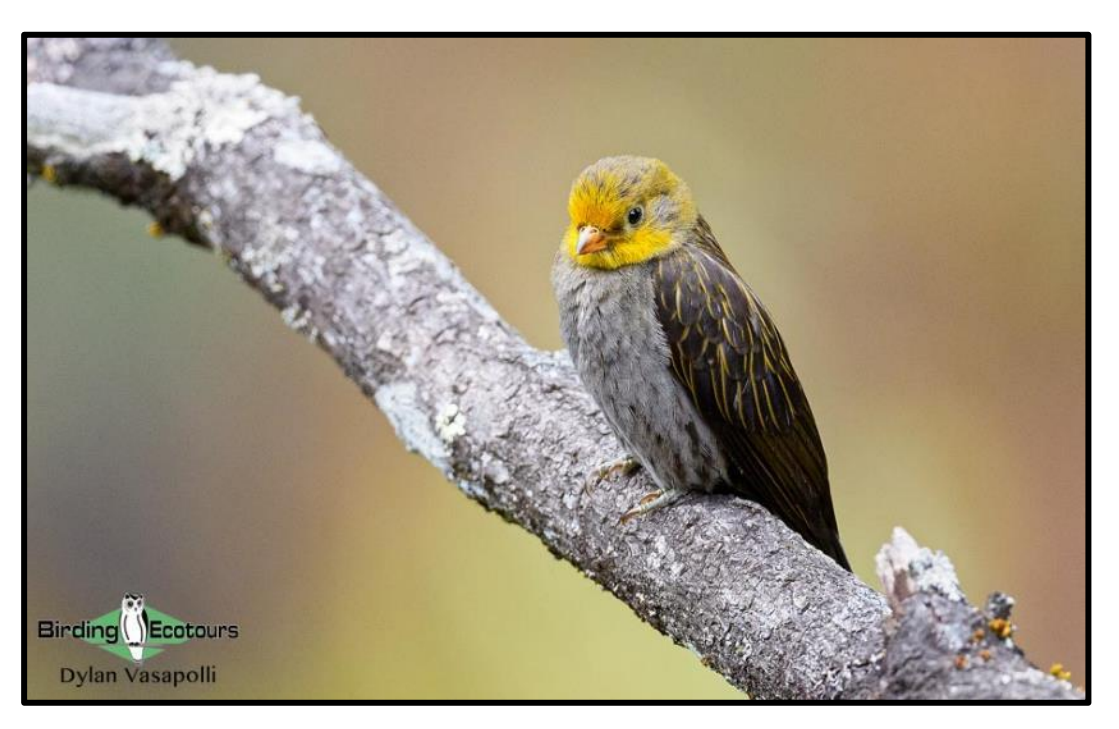
Yellow-rumped Honeyguide has a close relationship with rock bee colonies, and we pass several known stakeouts for this uncommon species.