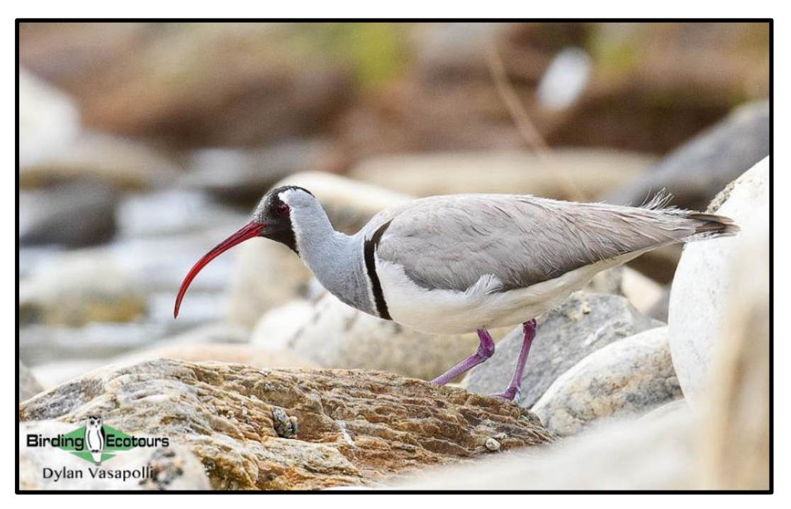
Ibisbill occurs right in the middle of Paro – sometimes it's even one of the first birds seen.

This tour begins with your arrival at <u>the spectacular Paro International Airport</u>. Most flights usually arrive in the morning, and the remainder of the day will be spent birding and exploring the Paro Chhu (local word for river). Ibisbill is one of the major targets on our radar here, along with other desirable birds like Wallcreeper , Black-tailed Crake and Solitary Snipe .