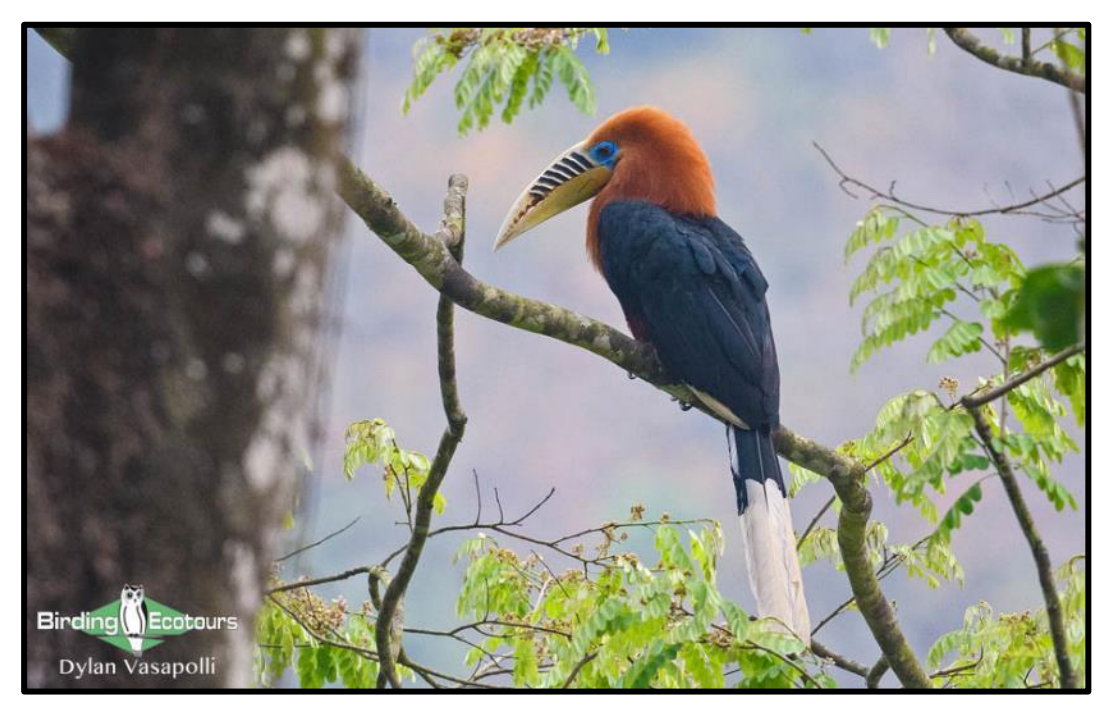
Hulking Rufous-necked Hornbills are a true highlight of the lower-lying forests in Bhutan – this is a scarce eastern Himalayan special we'll try hard to find.