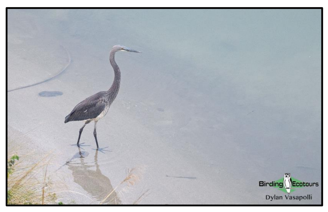
White-bellied Heron is one of the rarest birds in the world, with fewer than 250 birds remaining.

This tour begins in the high-elevation city of Paro, before undertaking a 17-day long road trip through the country. We venture east to the Punakha Valley, seeking out our first forest birds and also searching for the rare White-bellied Heron , before heading east to Trongsa, and south to Tingtibi and Panbang, where we will tackle the mid-elevation mossy forests for the stunning Beautiful Nuthatch , amongst others. These lowland areas also offer stands of bamboo and other