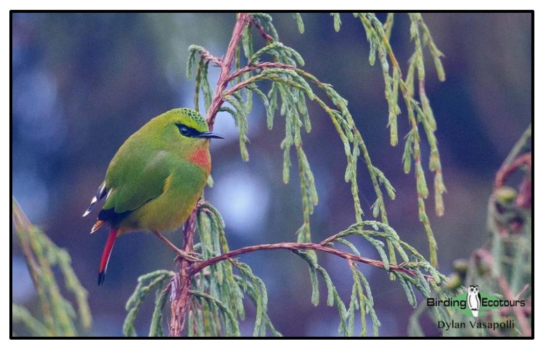
Fire-tailed Myzornis is a high-altitude special occurring on some of the passes we traverse.

This will likely be the first of many early starts, as we head east to <u>the Dochula Pass</u>, bypassing Bhutan's capital city - Thimpu. The Druk Wangyel monastery at the top of the pass features manicured gardens that play host to the likes of Darjeeling Woodpecker and Stripe-throated Yuhina , along with the highly sought-after Fire-tailed Myzornis . Additionally, Black-faced and White-throated Laughingthrushes commonly occur, and with some careful searching, we may also find the massive Spotted Laughingthrush . In recent years, the also enormous Great Parrotbill has been found to be reliable here.