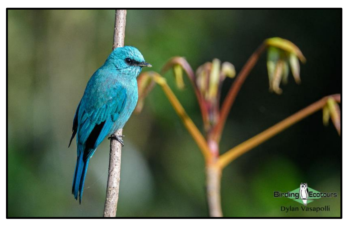
Spectacular Verditer Flycatchers are common virtually throughout Bhutan – it'll be tough to grow tired of this species!