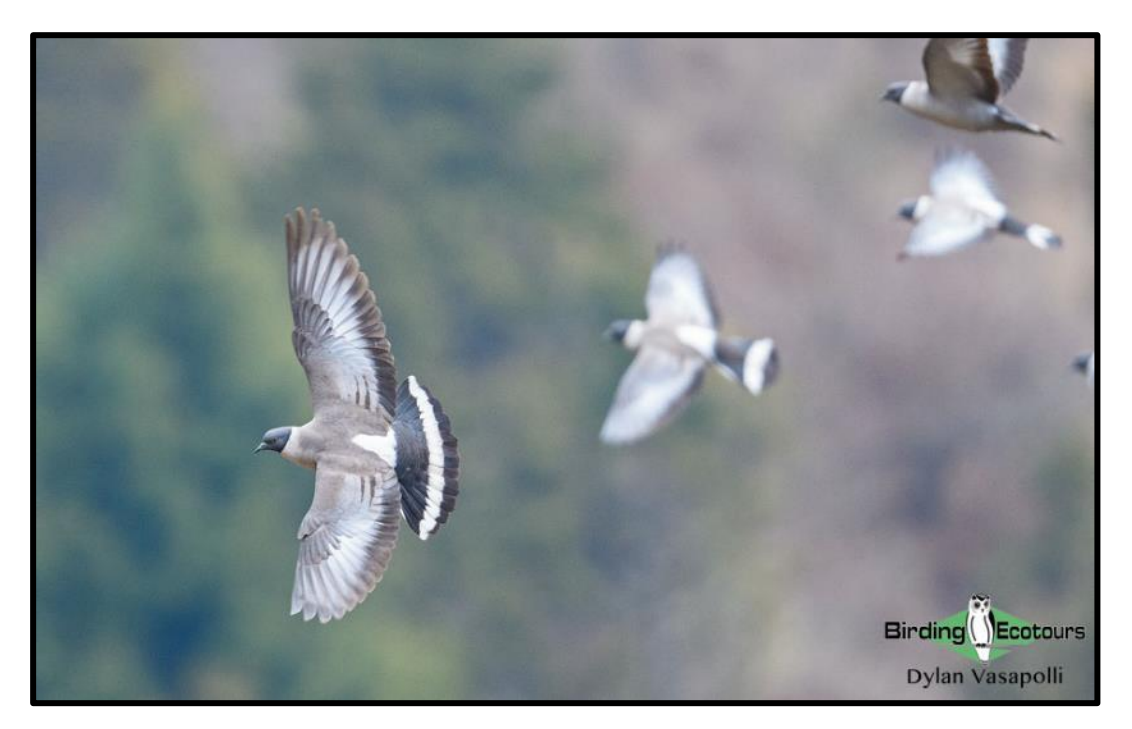
Not your average pigeon - delightful Snow Pigeons are usually evident around the monastery.