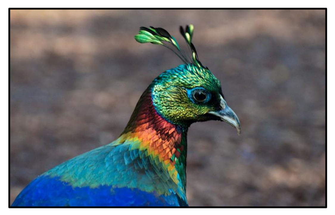
This is one of the most anticipated days of the tour – we hope to see the Satyr Tragopan (cover image) and the Himalayan Monal (pictured here) (photo H005, Wikimedia Commons).

the area immediately around the monastery, and they have become known for putting on incredible shows for birders! Like the tragopan before, we have our first attempt for the monals this afternoon. Overnight: Chumey