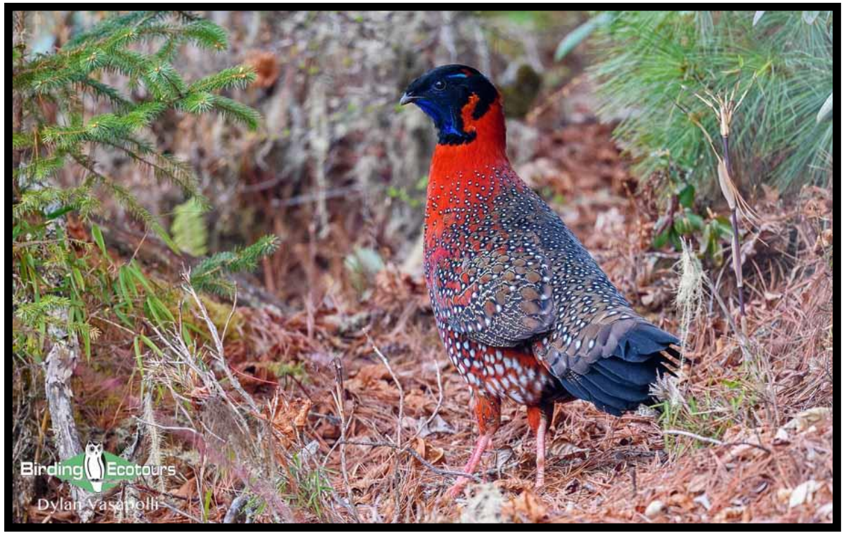
Satyr Tragopan is one of the most special and sought-after birds in the world – and is arguably the biggest attraction on this tour!

27 FEBRUARY – 15 MARCH 2025 13 – 29 APRIL 2026 17 APRIL – 03 MAY 2027