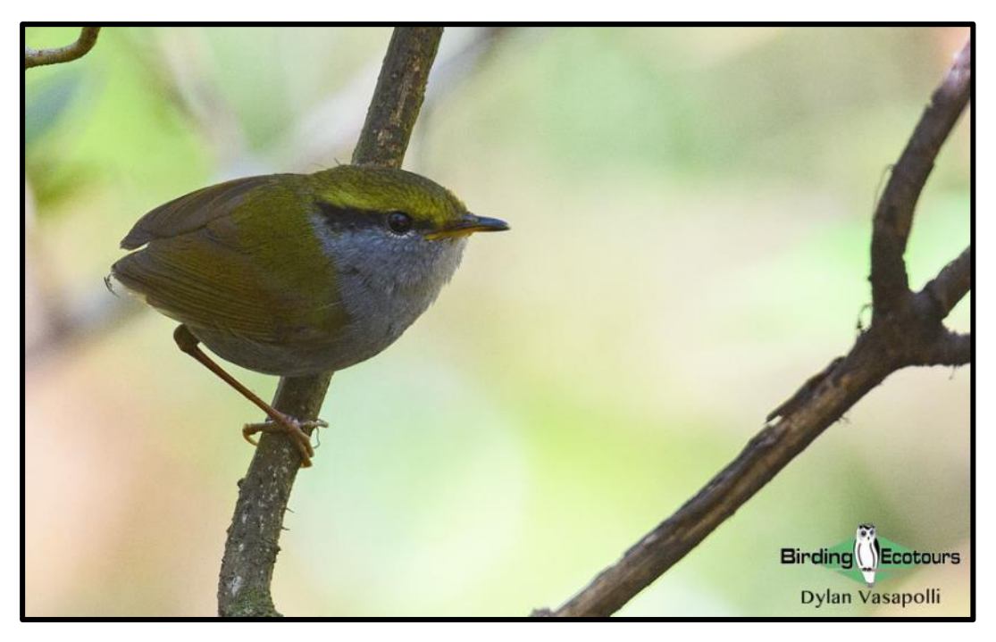
Grey-bellied Tesia is a master skulker! This diminutive bird requires a huge amount of patience and skill to see, but given enough time, we should get some visuals of this exciting bird.

our time here. With so few of these birds existing, we will count ourselves extremely lucky if we manage to find one. While searching for the heron, we're likely to see many other waterbirds, which might include rafts of ducks, ranging from Ruddy Shelduck to Bar-headed Goose , along with the strange-looking Common Merganser , large Crested Kingfisher and the endangered (IUCN) Pallas's Fish Eagle . Sandbars may also host the scarce Small Pratincole . We will also explore some wonderful riverine forest sections along the scenic Mo Chhu. Skulkers abound here, and we will have a tough task ahead of us to see any of the following: Chestnut-headed , Greybellied and Slaty-bellied Tesias , Scaly-breasted Cupwing or the sought-after Spotted Elachura . The elachura in particular is of great importance to many, as it was recently moved into a family of its own, making it a monotypic family (the only member of its family). Small Niltavas flit from the mid-strata, while the ever-persistent call of Golden-throated Barbets ring out. We will also keep an eye out for both Spotted and Slaty-backed Forktails on the forested sections of the river here.