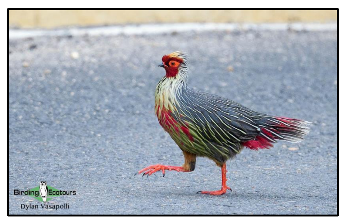
Blood Pheasants are much less secretive than some of their cousins, like tragopans and monals.

As we ascend into the alpine zone, we'll bird especially along <u>the impressive Thrumshing La Pass</u>, where we'll keep our eyes open for Blood Pheasant . This is another of our major target species and occurs widely on the pass. They are normally easy to see as they scurry around the road edges.