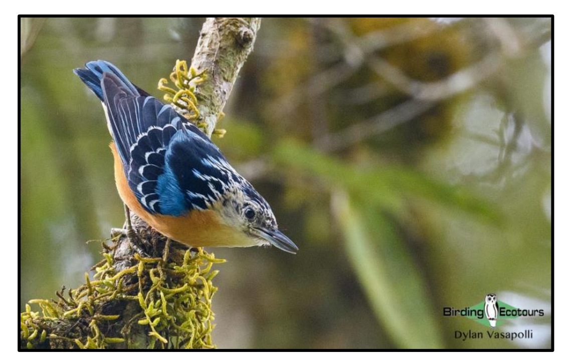
Beautiful Nuthatch is another major target species of this tour – we stand good chances at finding them in several localities.

Additionally, we will explore some of the bamboo patches here, which hold some scarce species. White-hooded Babbler and both White-breasted and Pale-billed Parrotbills are targets, along with others like the rare Broad-billed Warbler and fidgety Rufous-faced Warbler. Flocks of Pin-tailed Green Pigeons zoom overhead, while enormous Great Hornbills compete with each other for fruiting trees. Rufous-bellied Eagles and Mountain Hawk-Eagles float overhead, while the tall canopies can be searched for the likes of Rufous Woodpeckers and the shy Square-tailed Drongo-Cuckoo.