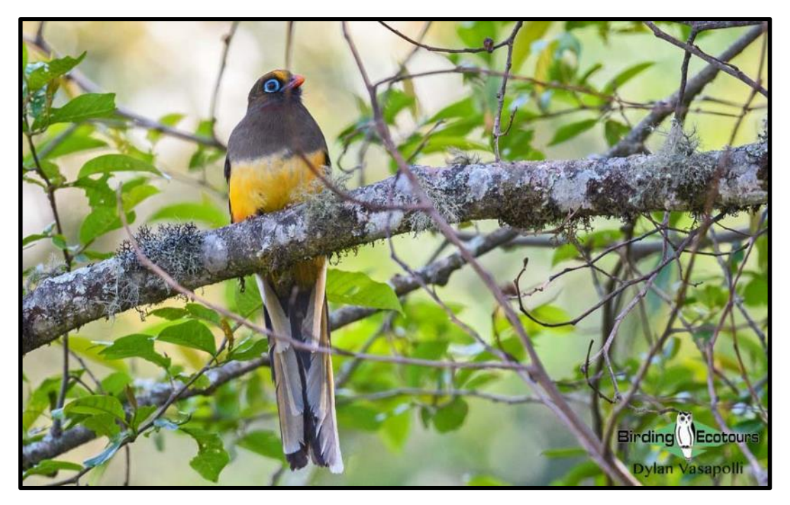
Ward's Trogon is easily one of the main target species for birding tours to Bhutan. Although it is always an uncommon species that takes much time and effort to locate, we will have several attempts at this highly sought-after species.

One of the major targets for us will be the scarce Ward's Trogon and, although this uncommon bird presents a big challenge even in the best of circumstances, we have a good chance of finding this species. Multiple sites also exist for the arguably even more sought-after Beautiful Nuthatch in this area, should we have missed this earlier on the trip around Tsirang. Himalayan Cutia is another sought-after species that occurs in the upper-lying forests here and is another of our main targets. A plethora of laughingthrushes can be found, and we'll carefully search for scarce species like Scaly , Blue-winged , Grey-sided and Rufous-chinned Laughingthrushes . Many skulking species are also likely to feature strongly on our list of targets here – with Slender-billed and Black-crowned Scimitar-Babblers , Red-faced Liocichla , Grey-throated Babbler , Golden Bush Robin , Long-billed and Eyebrowed Wren-Babblers , Scaly-breasted Cupwing , Lesser Shortwing and Silver-eared Mesia all possible.