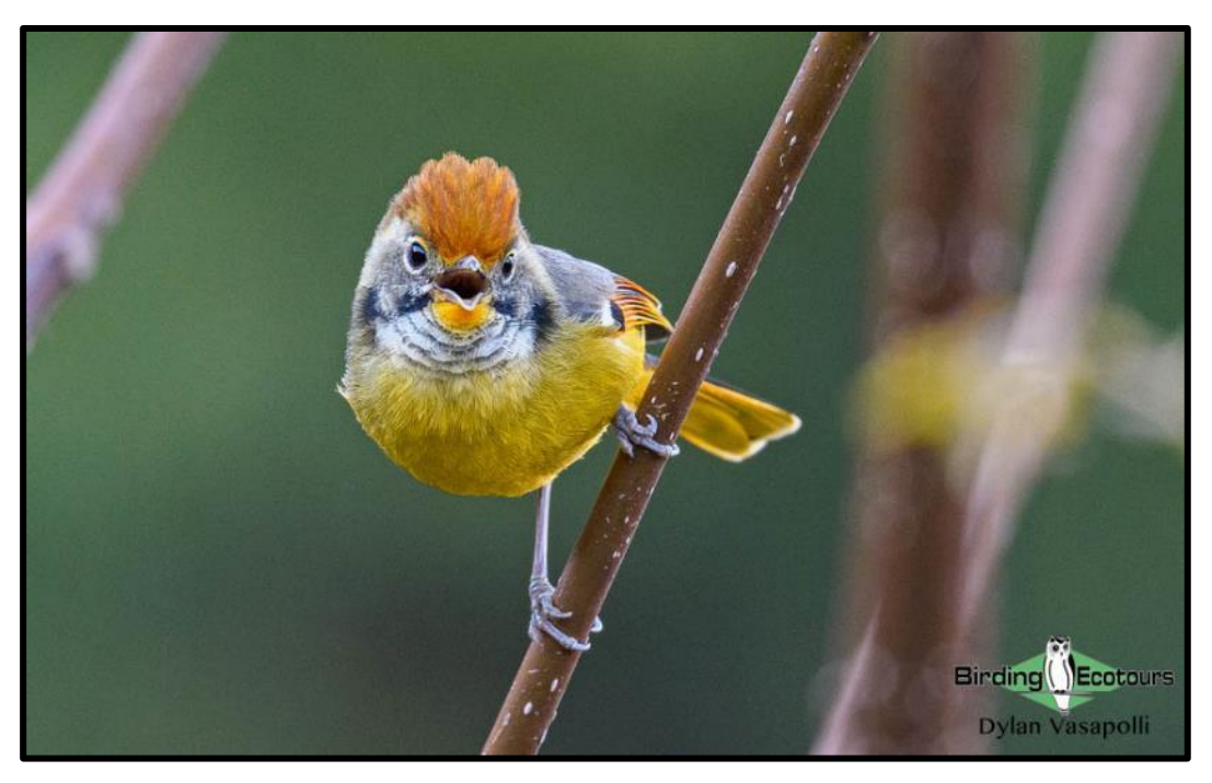
Bar-throated Minla is an excitingly colored bird and is a common sight in the alpine zone.