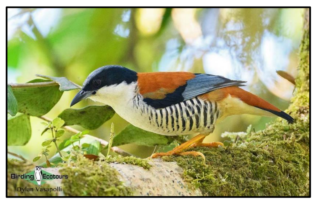
Himalayan Cutia frequents moss-covered trees, occurring at mid-elevation – in which they forage.