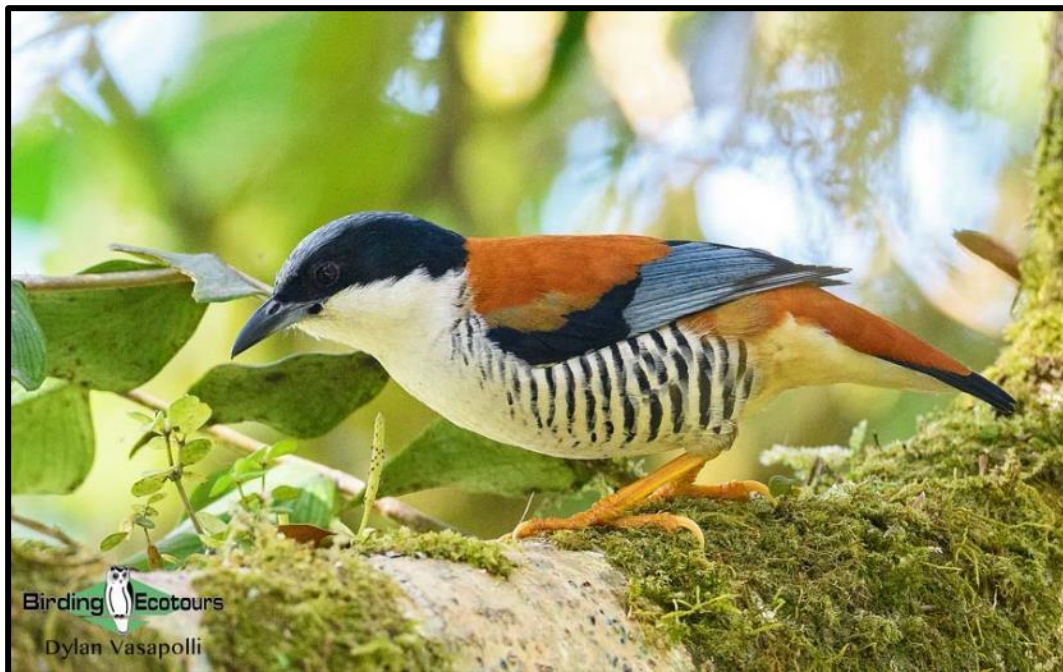
Himalayan Cutia frequents moss-covered trees, occurring at mid-elevation.