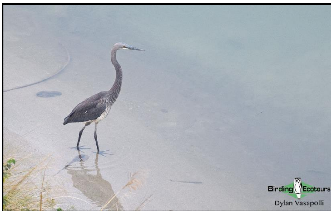
White-bellied Heron is one of the rarest birds in the world, with fewer than 250 individuals remaining.

This tour begins in the high-elevation city of Paro, before undertaking an 18-day road trip through the country. We venture east to the Punakha Valley, seeking out our first forest birds and also searching for the rare White-bellied Heron , before heading east to Trongsa, and south to Tingtibi and Panbang, where we will tackle the mid-elevation mossy forests for the stunning Beautiful