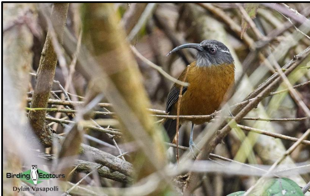
Slender-billed Scimitar Babbler is an exciting and major target in the higher elevations.