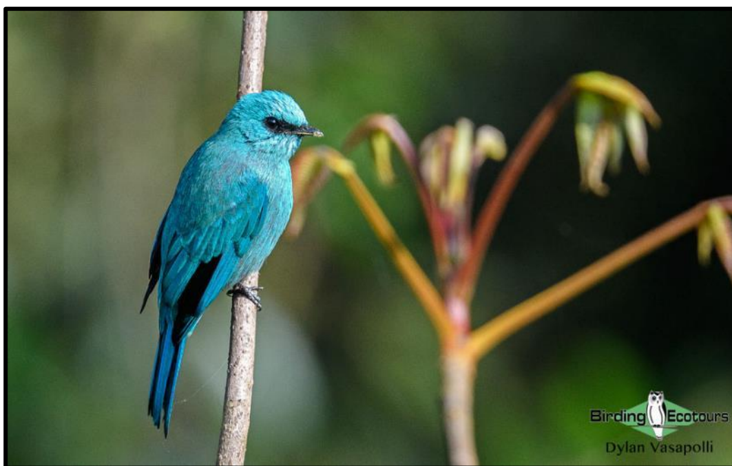
Spectacular Verditer Flycatchers are common virtually throughout Bhutan!