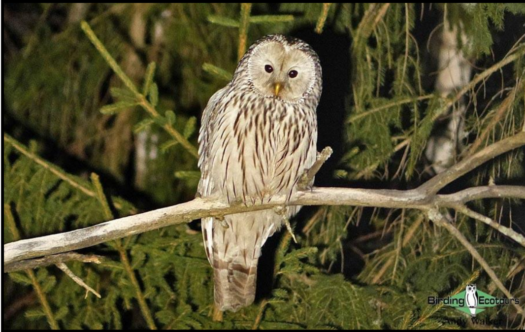
We will look for Ural Owl while in the taiga forests.