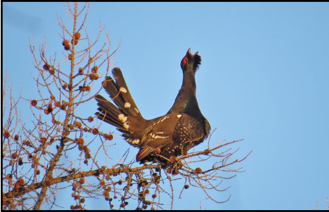
Black-billed Capercaillie will be another big target bird during our time in Gorkhi Terelj National Park.

Birders who have spent time in the non-breeding season in Thailand (e.g. on our Northern Thailand – Spectacular Resident and Migrant Birds birding tour) or chased rare birds in the UK or continental Europe will be familiar with the challenge of Phylloscopus warbler identification. In Gorkhi Terelj you have the opportunity of seeing breeding and singing Arctic Warbler, Greenish Warbler, Two-barred Warbler, Yellow-browed Warbler, Hume's Leaf Warbler, Pallas's Leaf Warbler, and Dusky Warbler which makes identification less of a challenge!