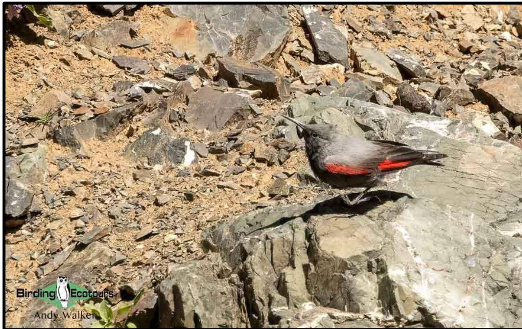
Wallcreeper can be found on the towering cliffs in the southern Gobi Desert.

In addition to these exciting birds, we should also see an assortment of interesting mammals during the tour, such as Tolai Hare , Pallas's Pika , Tarbagan Marmot , Mongolian Jird , Argali , Siberian Ibex , Mongolian Gazelle , Goitered Gazelle , Onager , Corsac Fox , and more.