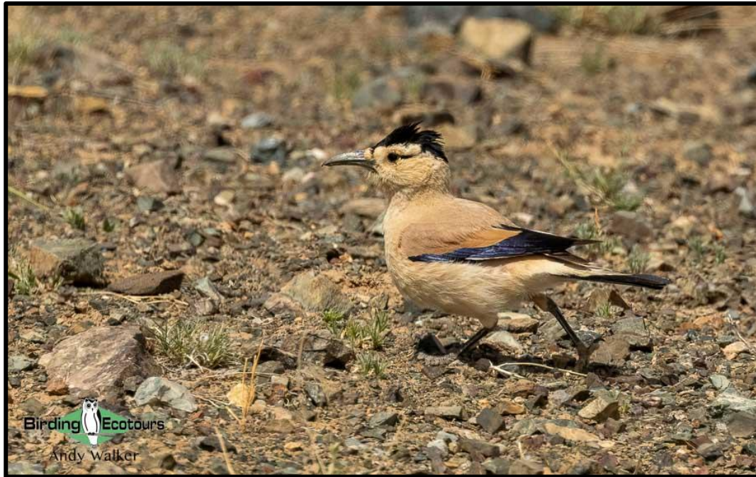
Mongolian Ground Jay is an interesting bird found in desert scrub.

Overnight (two nights): Tourist ger camp