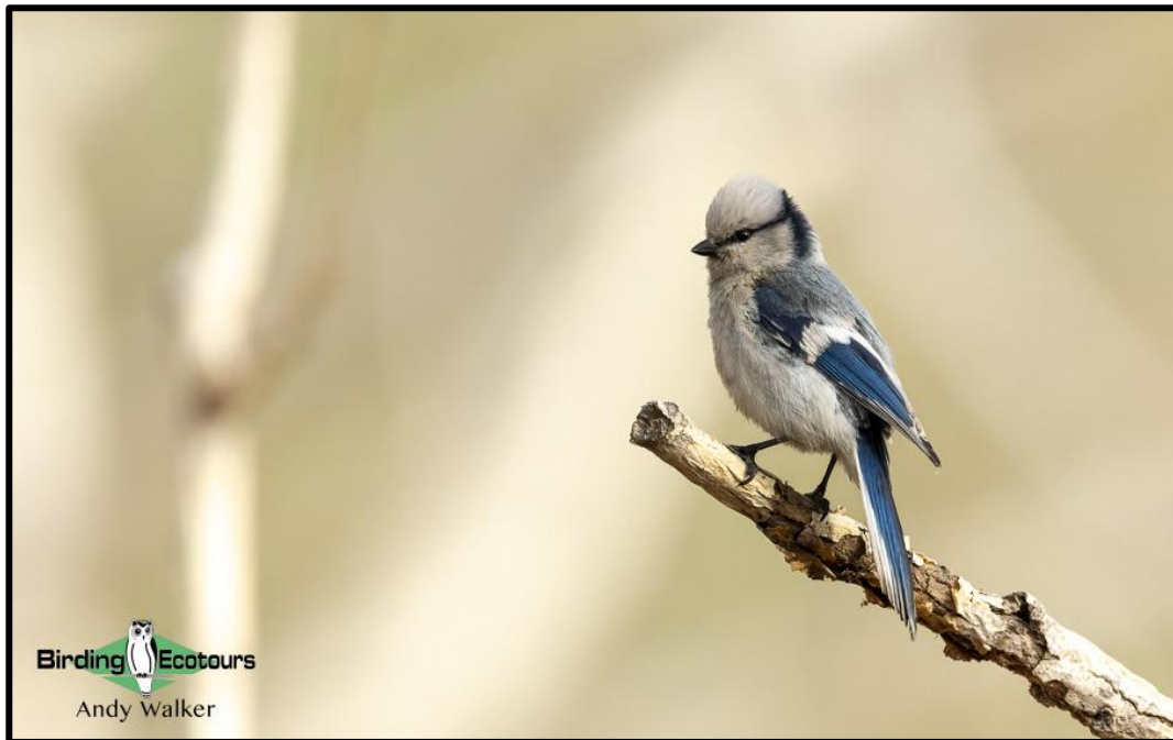
The gorgeous Azure Tit may provide an early tour highlight.

This Mongolian birdwatching tour offers the ultimate adventure to find an array of dream birds from the Eastern Palearctic . We will start (and end) our Mongolian birding adventure in Ulaanbaatar (also widely known as Ulan Bator). We will visit several different areas and key habitats in the region where we will look for a range of important target species. On arrival in the city some of our target birds should be waiting for us near our carefully selected hotel, such as Bar-headed Goose , Mandarin Duck , a range of shorebirds, Amur Falcon , Common Hoopoe , Azure-winged Magpie , Red-billed Chough , Daurian Jackdaw , Azure Tit , Naumann's Thrush , Red-throated Thrush , Long-tailed Rosefinch , Citrine Wagtail , and Little Bunting .