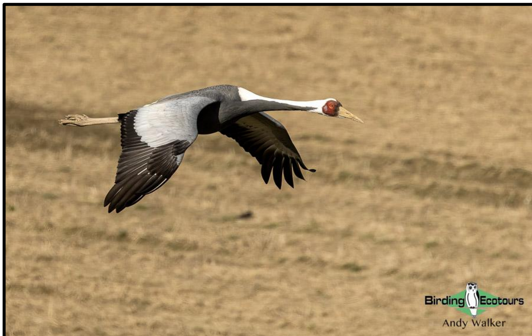
The stately White-naped Crane may be one of several crane species seen on this tour.

Overnight (two nights): Tourist ger camp