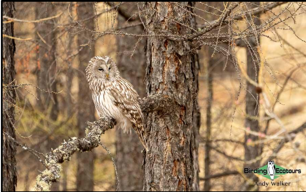
Ural Owl can be found while birding at Gorkhi Terelj National Park.

Birders who have spent time in the non-breeding season in Thailand (e.g. on our Northern Thailand – Spectacular Resident and Migrant Birds tour) or chased rare birds in the UK, US, or continental Europe, will likely be familiar with the challenge (and fun!) of Phylloscopus warbler identification. In Gorkhi Terelj, in late May, we have the opportunity of seeing breeding and singing Arctic Warbler , Greenish Warbler , Two-barred Warbler , Yellow-browed Warbler , Hume’s Leaf Warbler , Pallas’s Leaf Warbler , and Dusky Warbler , which makes identification a little less of a challenge!