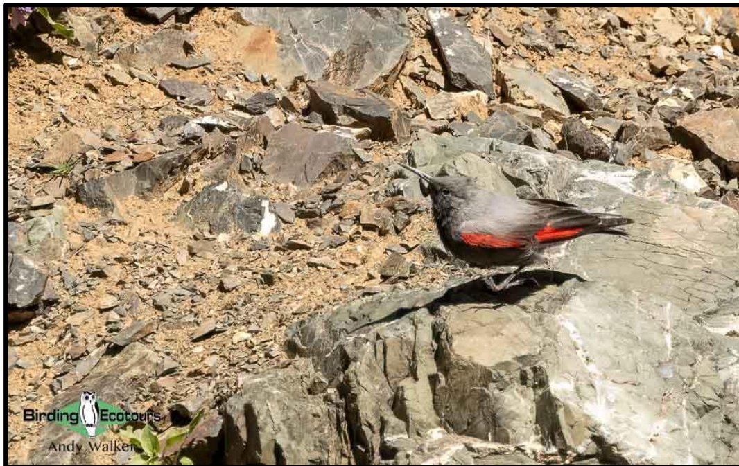
Wallcreeper can be found on the towering cliffs in the southern Gobi Desert.

In addition to these exciting birds, we should also see an assortment of interesting mammals during the tour, such as Tolai Hare , Pallas's Pika , Tarbagan Marmot , Mongolian Jird , Argali , Siberian Ibex , Mongolian Gazelle , Goitered Gazelle , Onager , Corsac Fox , and more.