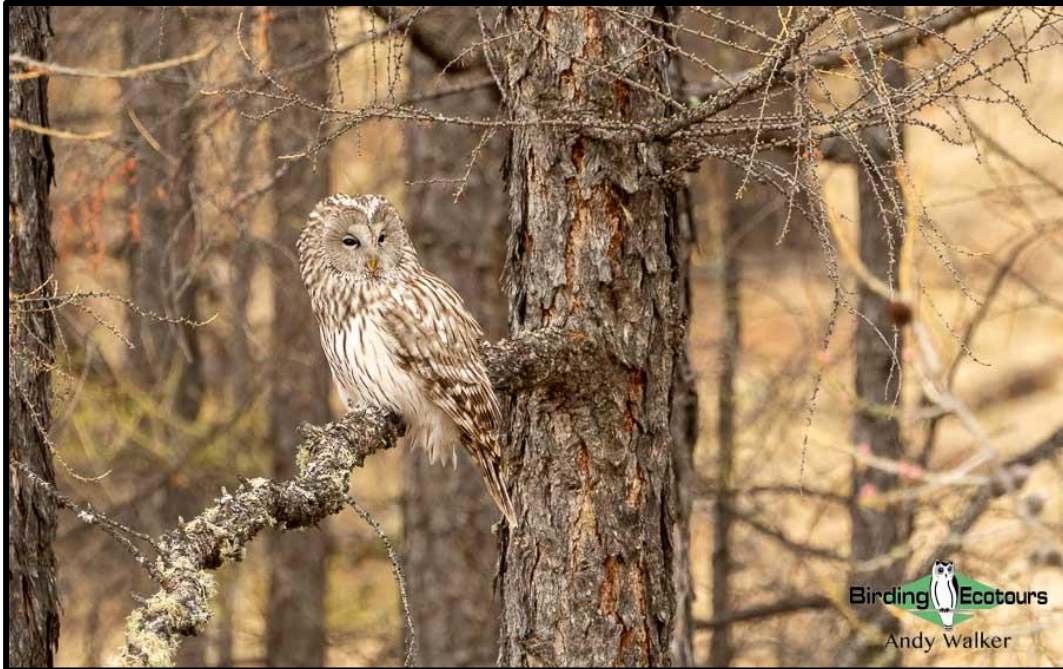
Ural Owl can be found while birding at Gorkhi Terelj National Park.

Birders who have spent time in the non-breeding season in Thailand (e.g. on our Northern Thailand – Spectacular Resident and Migrant Birds tour) or chased rare birds in the UK, US, or continental Europe, will likely be familiar with the challenge (and fun!) of Phylloscopus warbler identification. In Gorkhi Terelj, in late May, we have the opportunity of seeing breeding and singing Arctic Warbler , Greenish Warbler , Two-barred Warbler , Yellow-browed Warbler , Hume’s Leaf Warbler , Pallas’s Leaf Warbler , and Dusky Warbler , which makes identification a little less of a challenge!