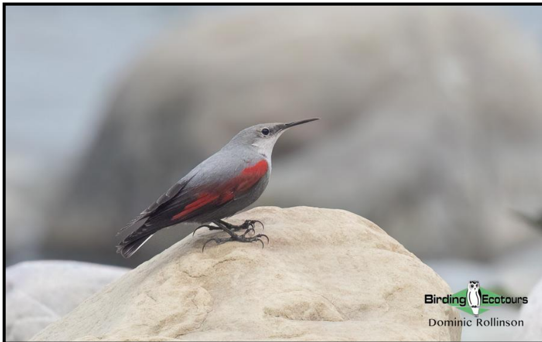
Wallcreeper — always a highlight.