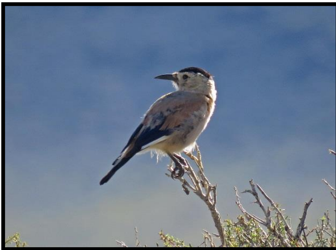
Henderson's Ground Jay.