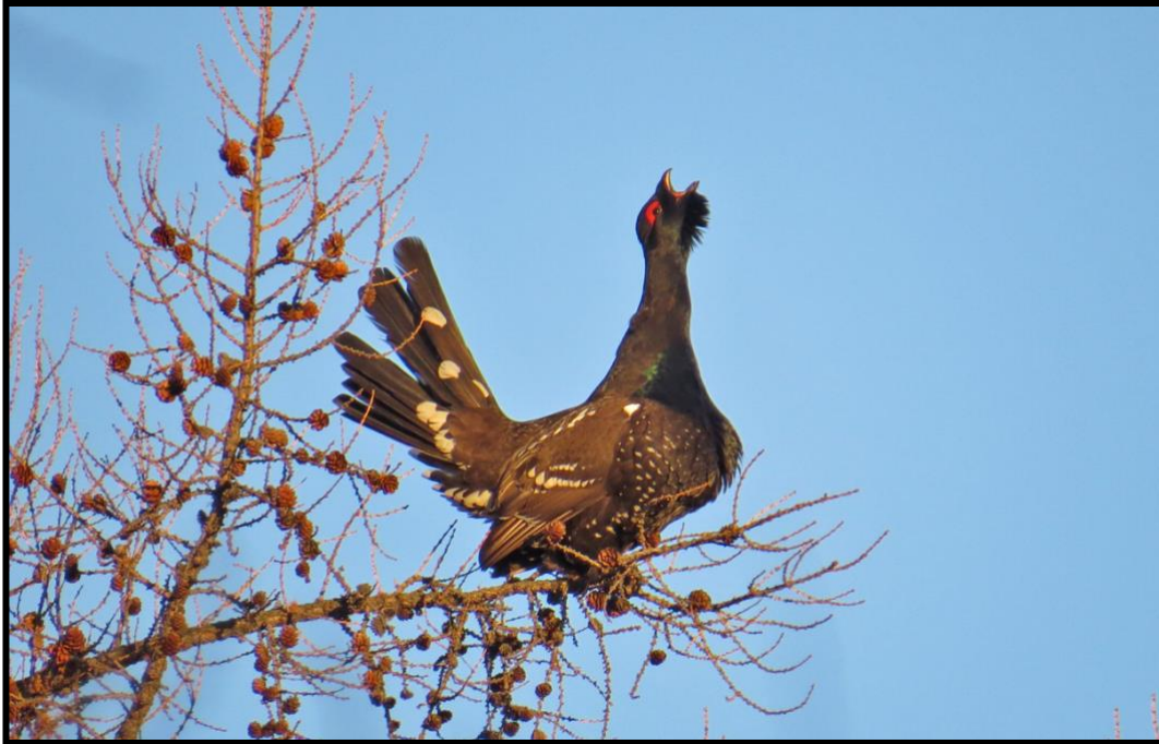
Black-billed Capercaillie will be another big target bird during our time in Gorkhi Terelj National Park.

Birders who have spent time in the non-breeding season in Thailand (e.g. on our Northern Thailand – Spectacular Resident and Migrant Birds birding tour) or chased rare birds in the UK or continental Europe will be familiar with the challenge of Phylloscopus warbler identification. In Gorkhi Terelj you have the opportunity of seeing breeding and singing Arctic Warbler, Greenish Warbler, Two-barred Warbler, Yellow-browed Warbler, Hume's Leaf Warbler, Pallas's Leaf Warbler, and Dusky Warbler which makes identification less of a challenge!