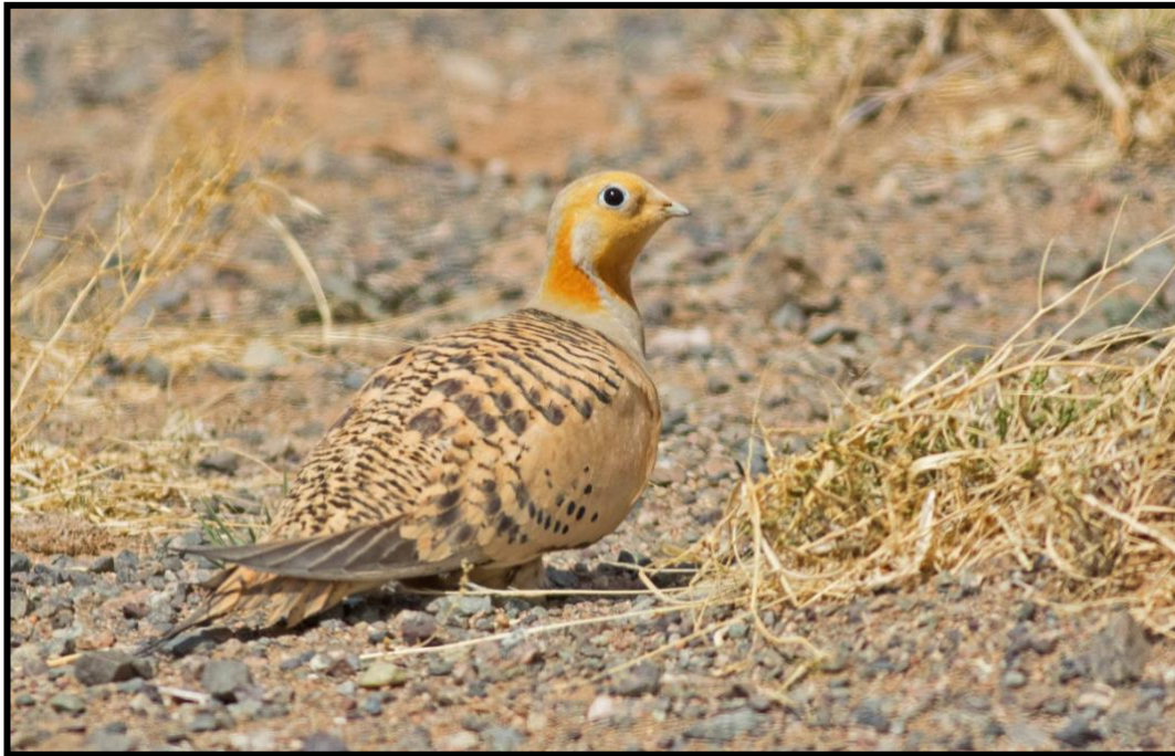
Pallas's Sandgrouse can be found in the Gobi Desert.