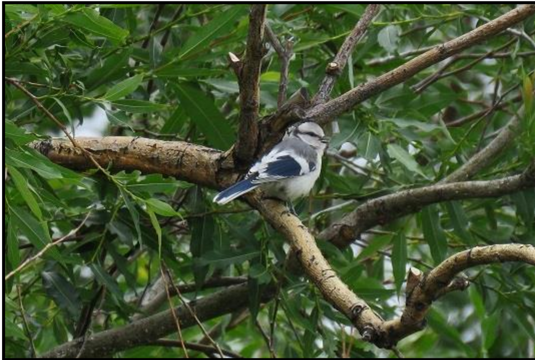
Azure Tit

In addition to these exciting birds we might also see an assortment of interesting mammals such as Grey Wolf, Mongolian Gazelle, Siberian Ibex , and Argali (mountain sheep).