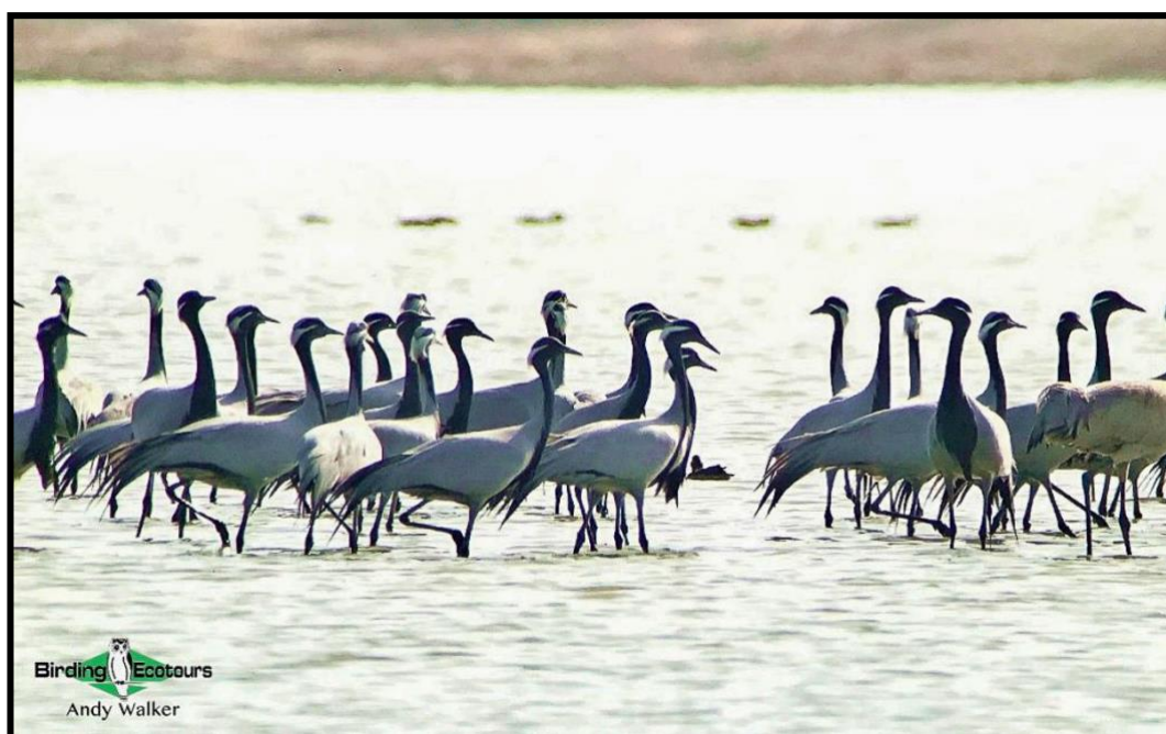
Large flocks of Demoiselle Crane may be seen on this tour.