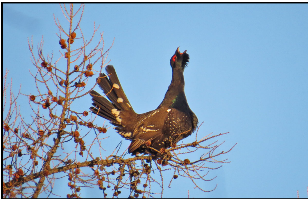
Black-billed Capercaillie will be another big target bird during our time in Gorkhi Terelj National Park.

We will drive to Gorkhi Terelj National Park and check into a tourist ger camp near the birding site for a two-night stay to explore this fascinating area. Here we will look for forest and forest/steppe birds, including the tough and highly sought Black-billed Capercaillie and Chinese Bush Warbler , along with plenty of other quality birds like Siberian Rubythroat , Daurian Partridge , Ural Owl , Oriental Cuckoo , Eurasian Three-toed Woodpecker , Red-flanked Bluetail , Daurian Redstart , Dark-sided Flycatcher , Taiga Flycatcher , Black-faced Bunting , Stejneger's Stonechat , and White-cheeked Starling .