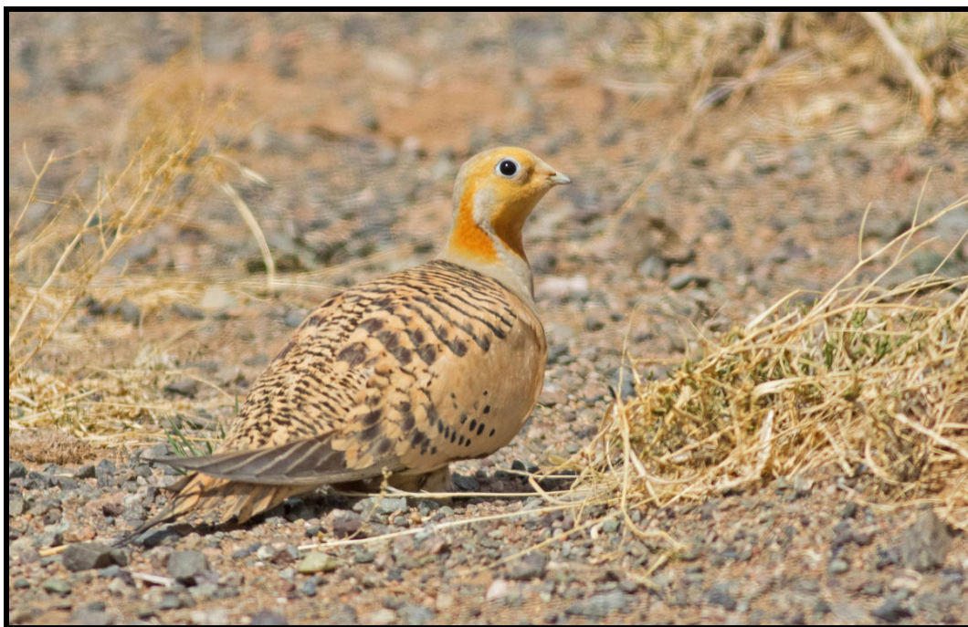
Pallas's Sandgrouse can be found in the Gobi Desert.