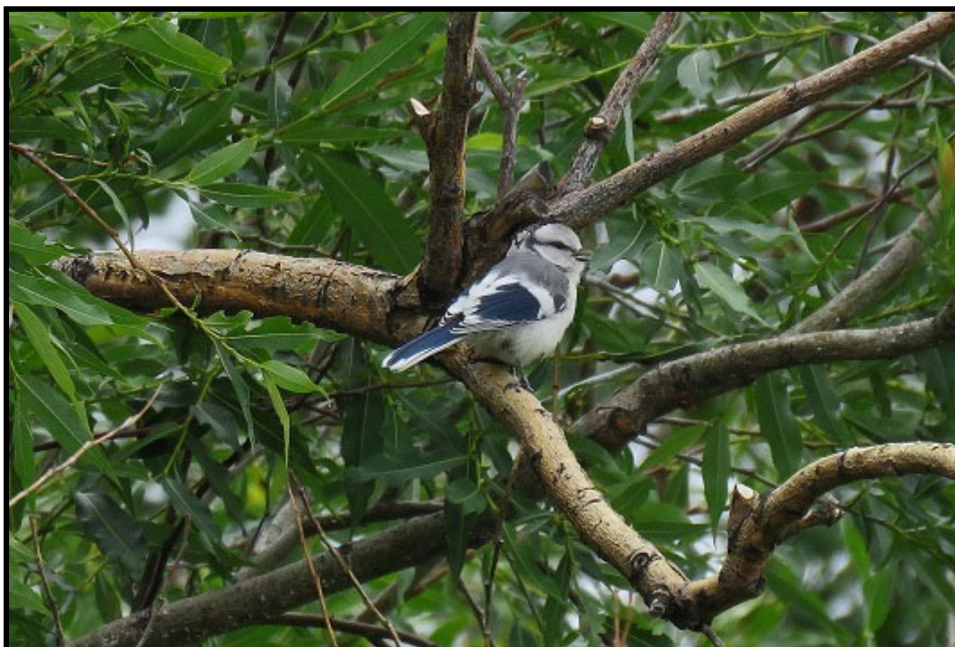
Azure Tit