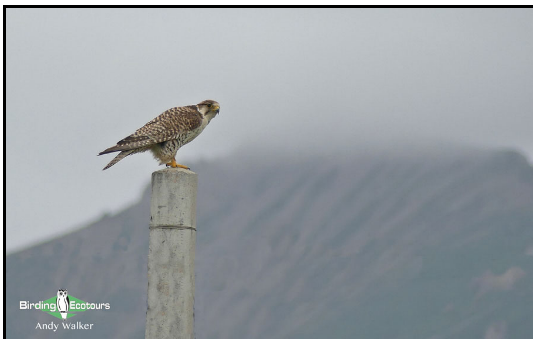
Saker Falcon is a huge falcon and makes its home in the steppes and mountains of Mongolia.