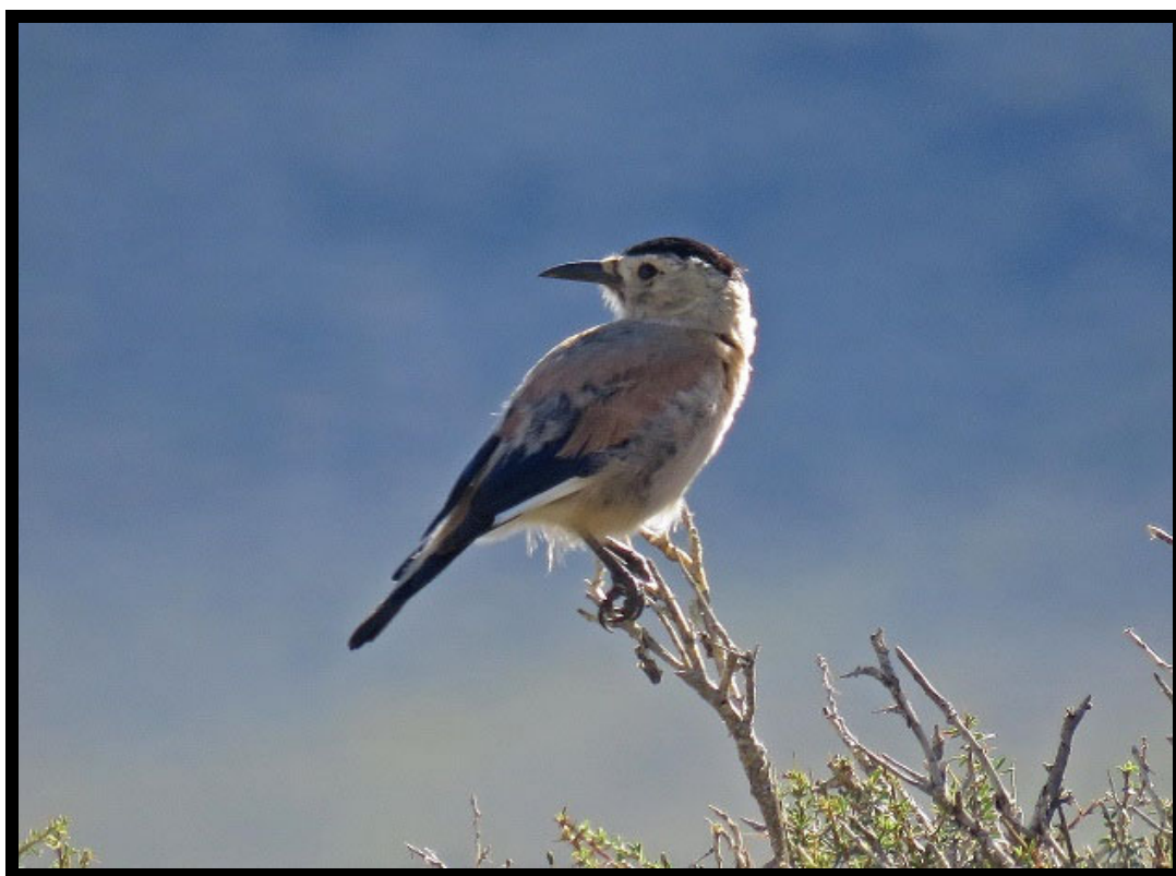
Henderson's Ground Jay