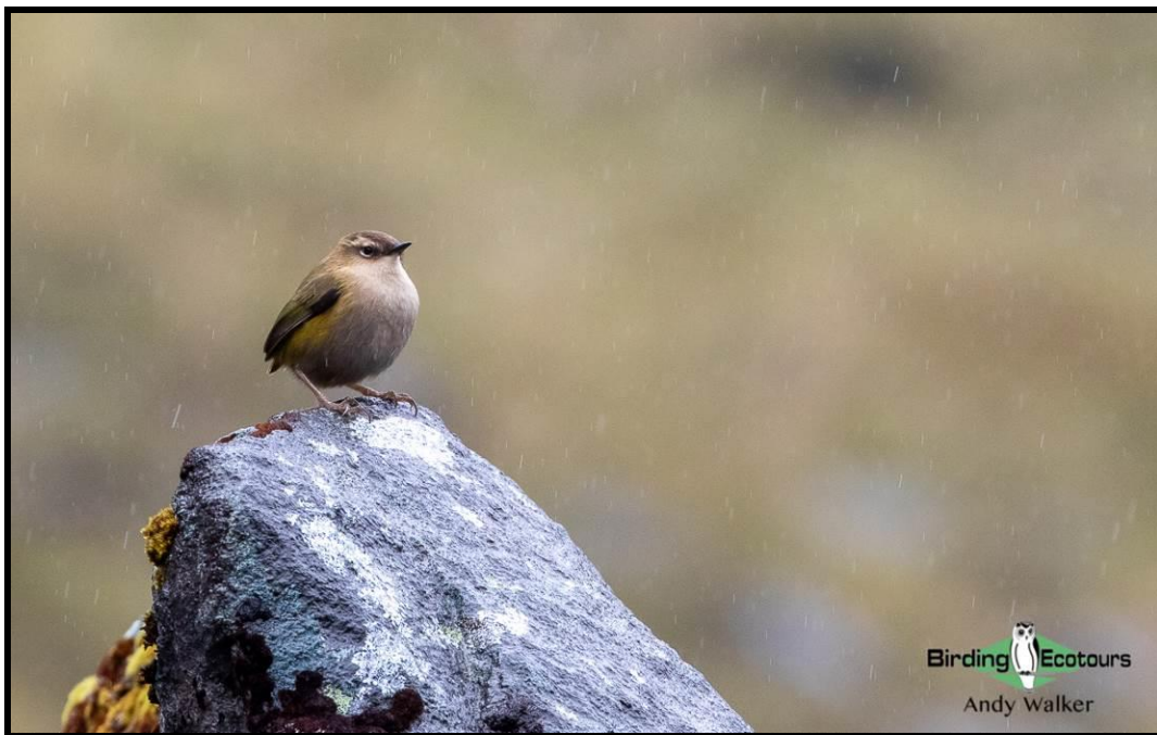
One of the tougher of the endemics to find, New Zealand Rockwren is a great bird!

Leaving Te Anau for the day, we will head towards Milford Sound. A drive along the Eglinton River to Hollyford Valley will delight us with spectacular mountain scenery. In the valley we will seek out some unique endemic species, with New Zealand Rockwren being one of the main targets. Also high on the 'wanted list' will be Blue Duck , which we should have already seen on North Island, but will not complain at another look at this rare bird. Other birds possible today include Tomtit , Rifleman , New Zealand Kaka , Kea , Pipipi (New Zealand Brown Creeper), and many more.