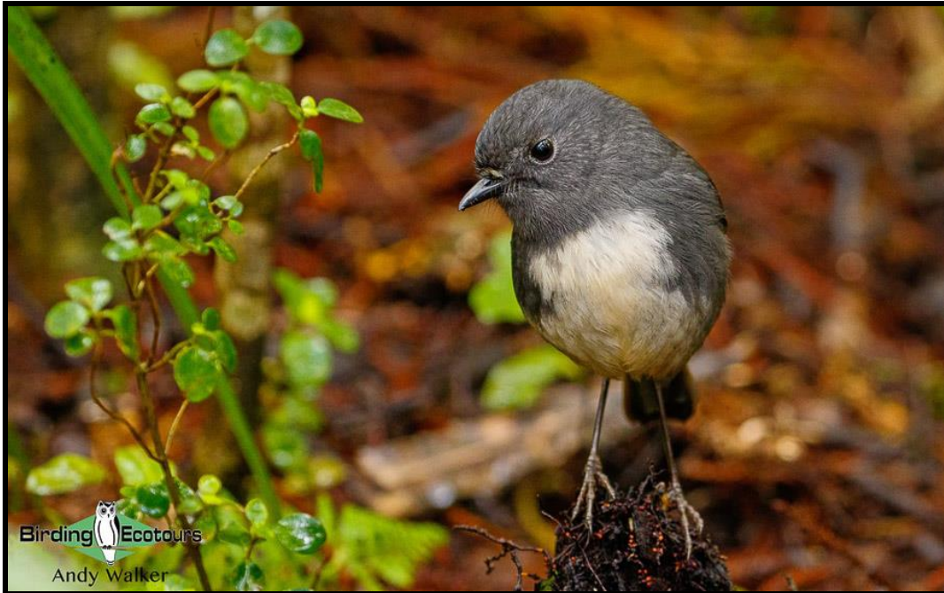
South Island Robin can be extremely confiding!