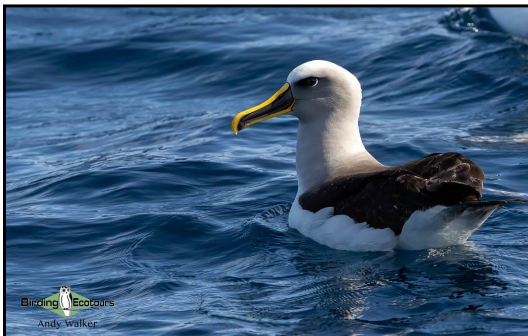
The attractive Buller's Albatross would be a highlight on any pelagic trip!