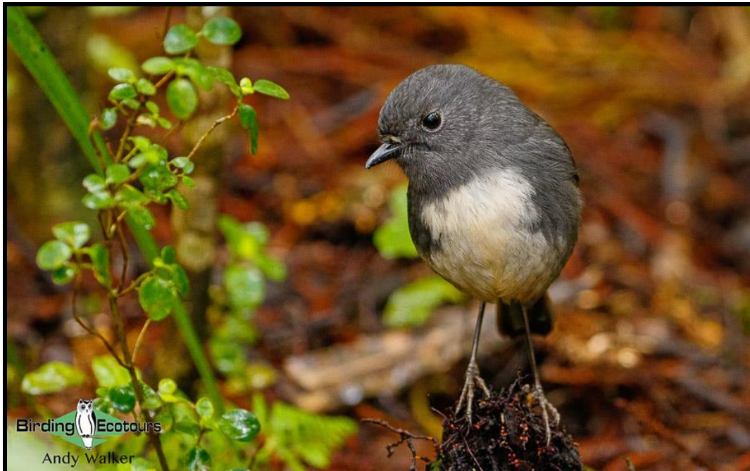
South Island Robin can be extremely confiding!