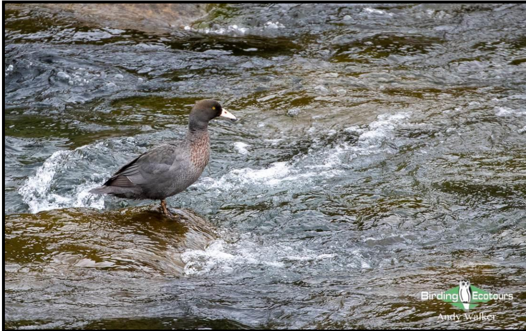
Blue Duck inhabits streams in Tongariro National Park.