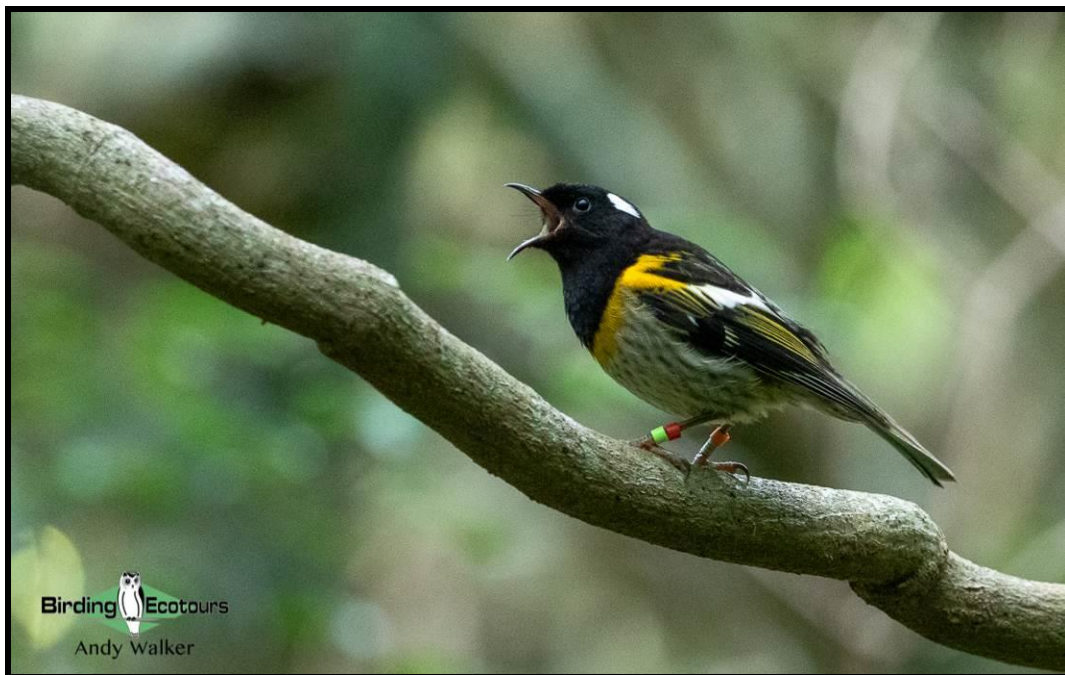
Stitchbird is usually seen on predator-free Tiritiri Matangi Island.

The tour starts in Auckland from where we will pop over to the excellent Tiritiri Matangi Island , the first of three predator-free islands we will visit, to see rare endemics, including North Island Saddleback and Stitchbird , we will then start our journey south, our first stop on this journey being at the wader haven at Miranda.