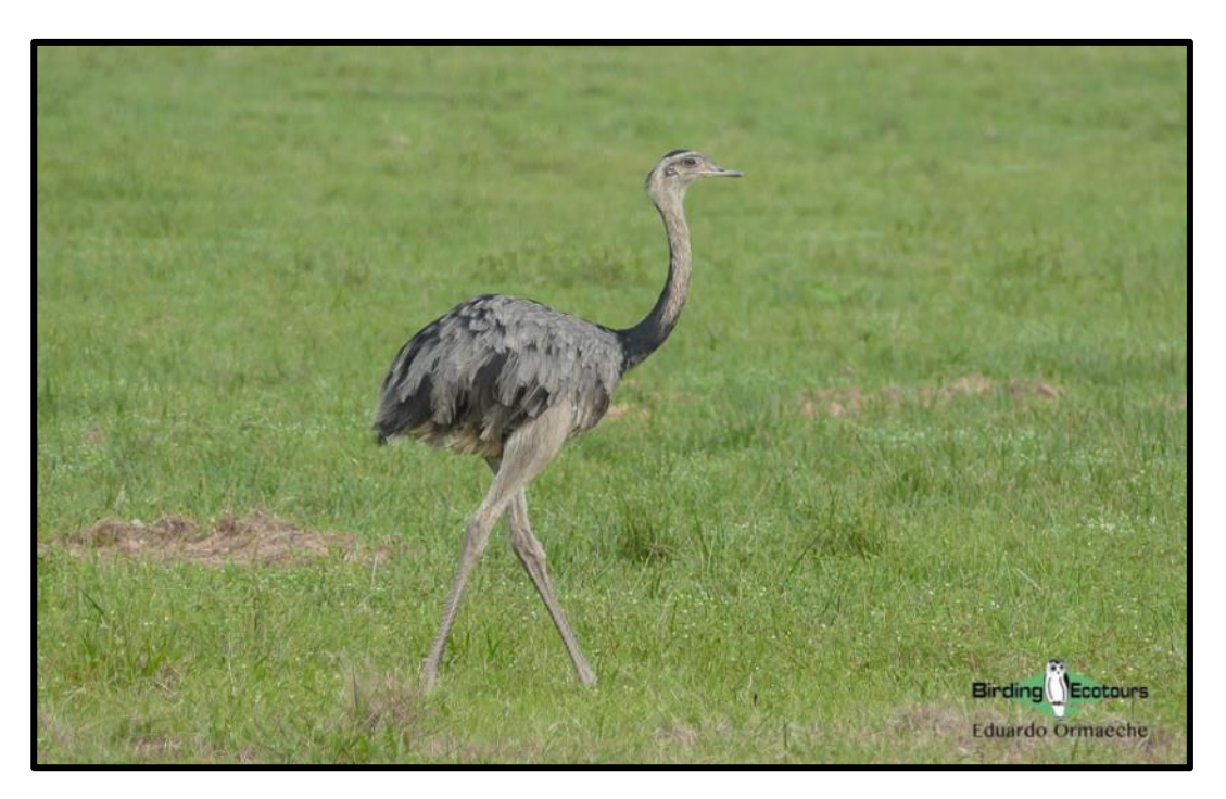
With luck, we may see Greater Rhea in the grasslands around Viru Viru International Airport.

Our 16-day Bolivian birding tour will give you the opportunity to explore the best that this country has to offer, including some unique southern South American habitats, such as the Chiquitania region in the Santa Cruz province, an area dominated by xerophytic vegetation with acacia-like trees, and lowland grasslands and surrounds near the Viru Viru International Airport. We will begin the tour's birding close to the airport where we will be looking for Toco Toucan, Chopi Blackbird, Savaca Tanager, White-bellied Nothura, Red-winged Tinamou, Campo Flicker, Yellow-chevroned Parakeet, and with luck, Greater Rhea.