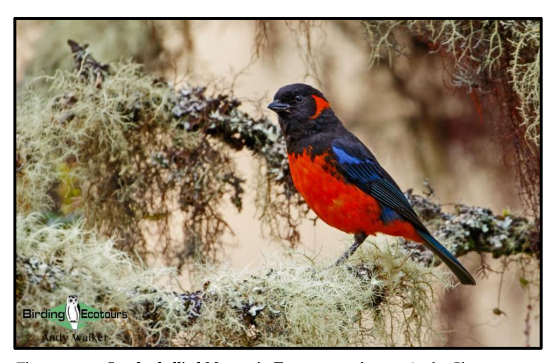
The gorgeous Scarlet-bellied Mountain Tanager can be seen in the Chapare area.