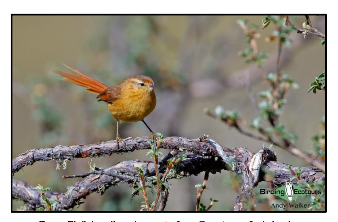
Tawny Tit Spinetail can be seen in Cerro Tunari near Cochabamba.