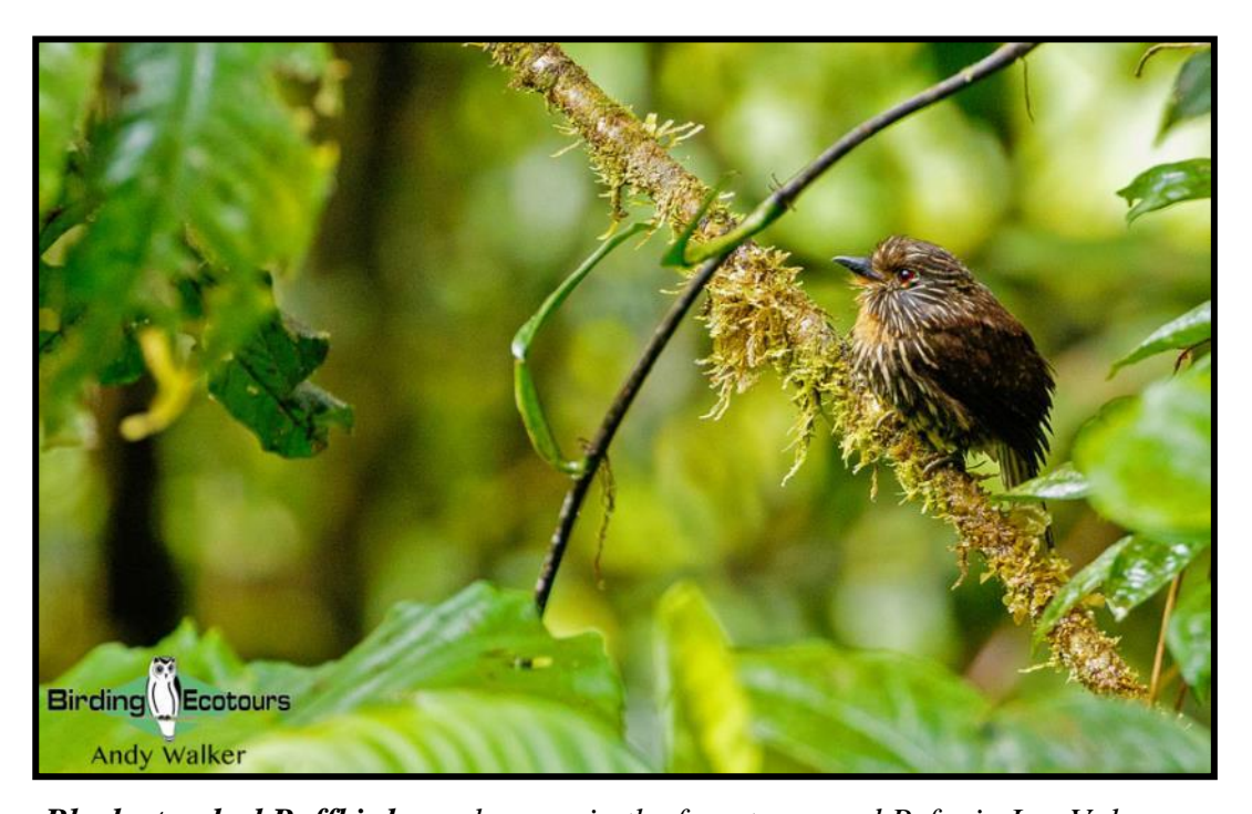
Black-streaked Puffbird may be seen in the forests around Refugio Los Volcanes.

Overnight: Hotel Cortez, Santa Cruz de la Sierra