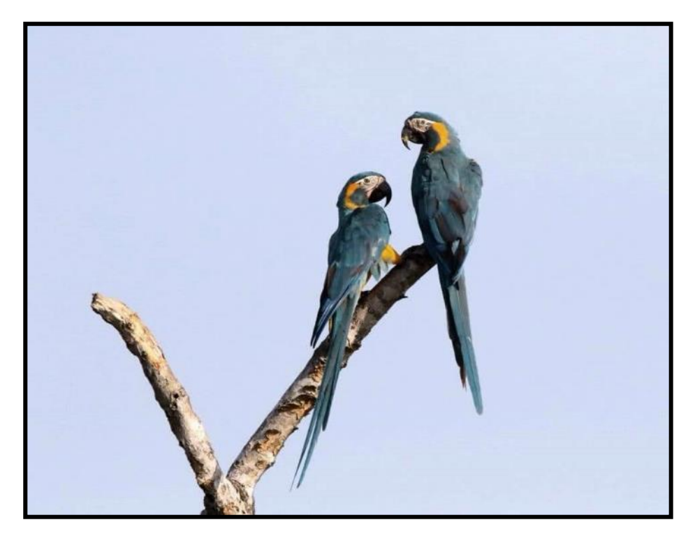
Blue-throated Macaw will be targeted on our extension