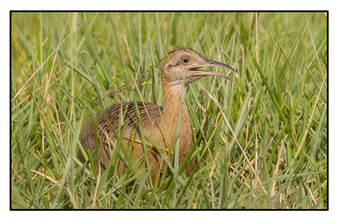
The shy Red-winged Tinamou is possible around Santa Cruz airport.

Overnight: Hotel Cortez, Santa Cruz de la Sierra