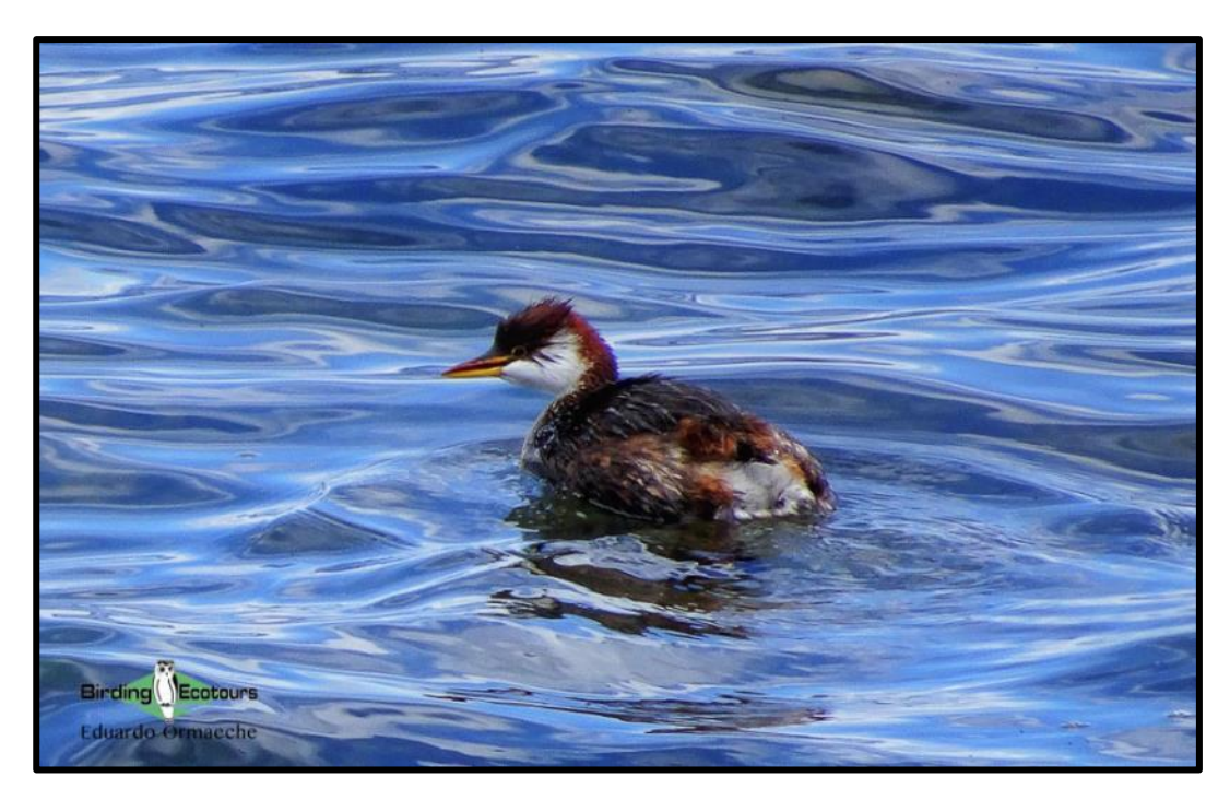
The near endemic Titicaca Grebe is another important trip target.