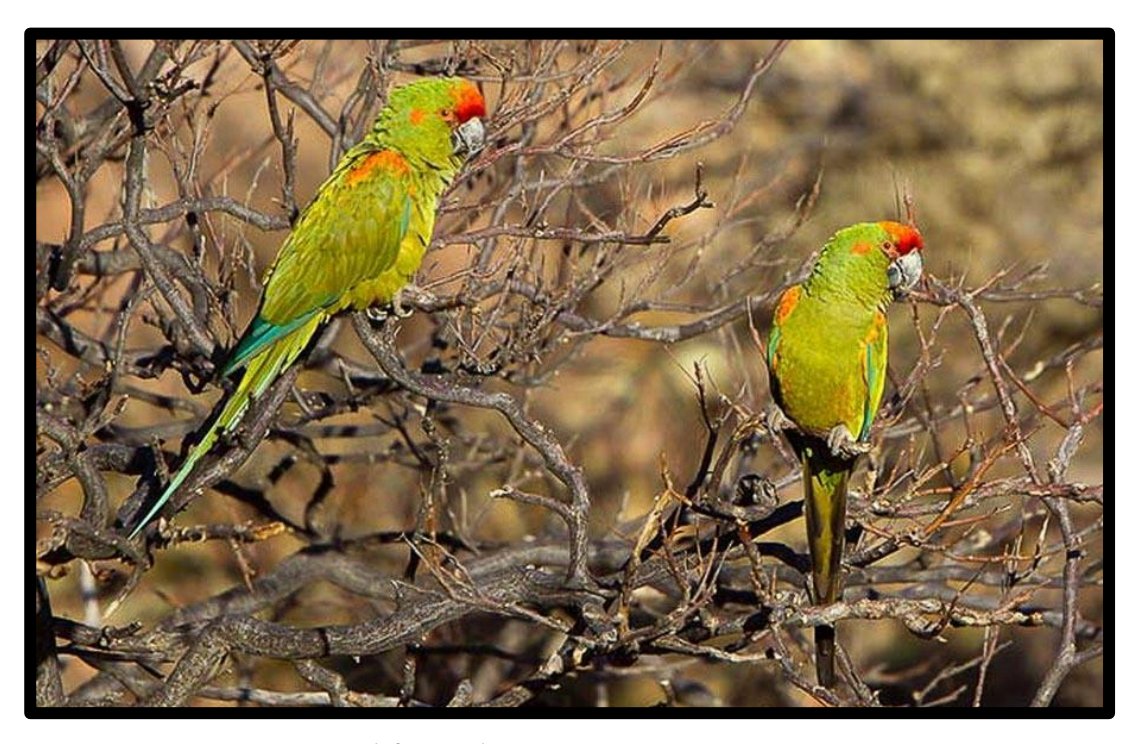
The endemic and localized Red-fronted Macaw is an important target of our trip.

We have temporarily suspended the set departure version of this tour shown here, because strikes prevented us from operating the 2022 trip, so please e-mail <a href="mailto:info@birdingecotours.com">info@birdingecotours.com</a> if you want us to potentially run the trip for you privately by special request