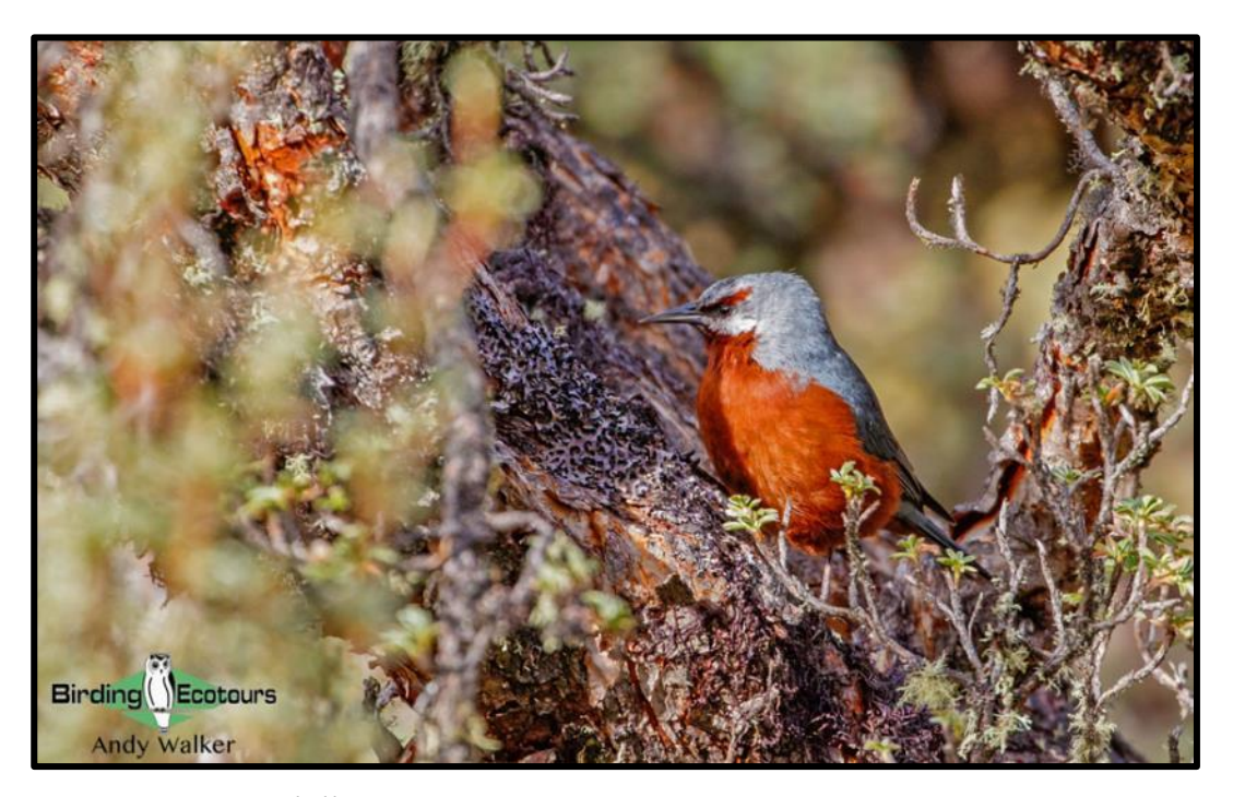
Giant Conebill can be seen in the Polylepis forest above Cerro Tunari

Leaving the dry valleys behind, we will visit the cloudforest of the Siberia area, where we will look for Trilling Tapaculo, Light-crowned Spinetail, Pearled Treerunner, Fulvous-headed Brushfinch, and the endemics Black-throated Thistletail and Rufous-faced Antpitta.