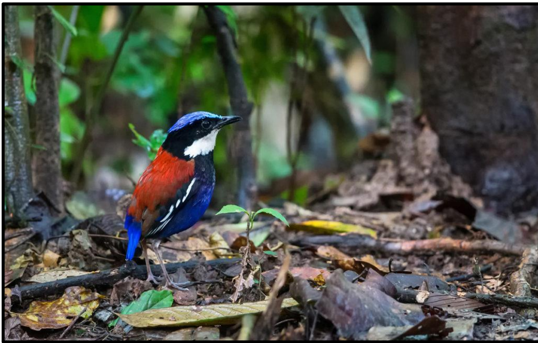
Blue-headed Pitta is a target during our time in Danum Valley.

In addition to the suite of hornbills and pittas mentioned above we will look for the monotypic Bornean Bristlehead and of course other special target birds like Bornean Crested Fireback , Sabah (Chestnut-necklaced) Partridge , Bornean Blue Flycatcher , Sunda Blue Flycatcher , White-crowned Shama , Black-throated Wren-Babbler , Bornean Wren-Babbler , Crested Jayshrike , Chestnut-naped Forktail , White-crowned Forktail , Great-billed Heron , Wallace's Hawk-Eagle , Blyth's Hawk-Eagle , Rufous-bellied Eagle , Bat Hawk , Large Green Pigeon , Great Slaty Woodpecker , Olive-backed Woodpecker , Ashy Tailorbird , Whiskered Treeswift , Oriental Dwarf Kingfisher , Chestnut-capped Thrush , and a host of forest bulbuls (including the Critically Endangered ( BirdLife International ) Straw-headed Bulbul ), babblers, flowerpeckers, flycatchers, woodpeckers, drongos, raptors, sunbirds, and spiderhunters. This place really is a naturalist's dream.