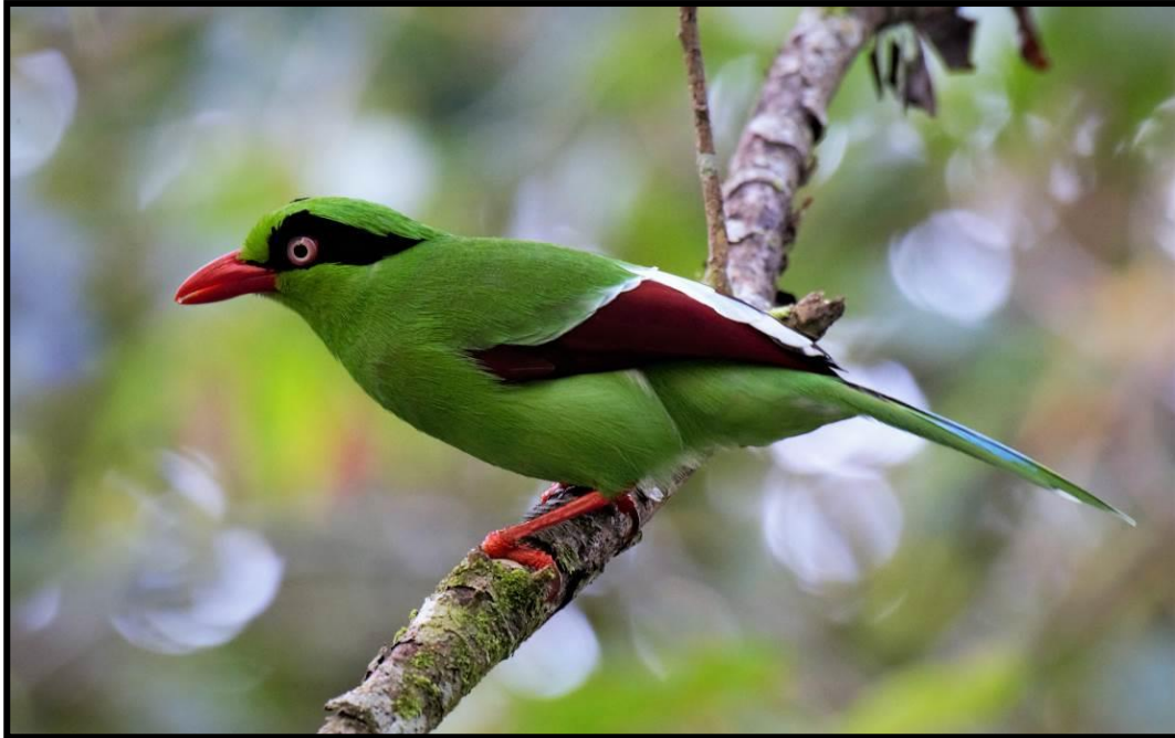
The striking Bornean Green Magpie can be seen in Kinabalu National Park.