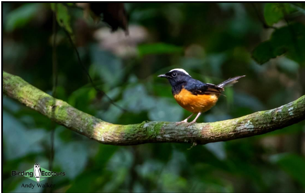
The attractive and endemic (to Sabah) White-crowned Shama can be found around our accommodation in the Danum Valley.

Overnight: Borneo Rainforest Lodge, Danum Valley