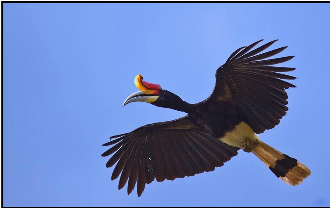
Rhinoceros Hornbill is an incredible sight.

After arrival and check-in at the lovely Borneo Nature Lodge on the Kinabatangan River, where we will stay for two nights, we will embark in the late afternoon on our first birding river cruise.