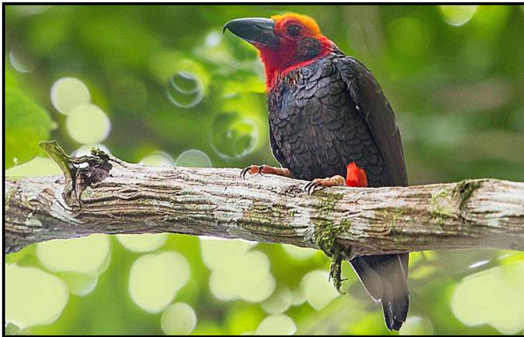
Bornean Bristlehead, a bizarre and monotypic endemic target.

On our radar will be all eight hornbill species that occur here, including the spectacular Helmeted Hornbill , which is now Critically Endangered (BirdLife International), along with stunning Rhinoceros Hornbill . There will also be plenty of other endemic and Sundaic birds available during this tour, such as Storm’s Stork , Banded Kingfisher , and Bornean Forktail .