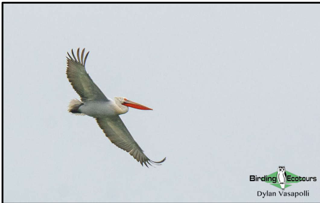
We will look for the huge Dalmatian Pelican during the tour.

While in the Pomorie area we will visit the nearby salt works. The standout species here are the Near Threatened ( BirdLife International ) Dalmatian Pelican and White-headed Duck which is an Endangered species ( BirdLife International ). The salt works support many other birds, including various species of shorebirds (waders) and wintering passerines. We will visit some of the region's protected wetland sites and coastal areas while here. This area holds more interesting species with Pallas's Gull , Whooper Swan , Tundra (Bewick's) Swan , and White-tailed Eagle all possible here. While in the area, we will also visit the Strandzha Mountains on the Turkish border, which is home to the exceedingly rare (in Bulgaria) White-backed Woodpecker .