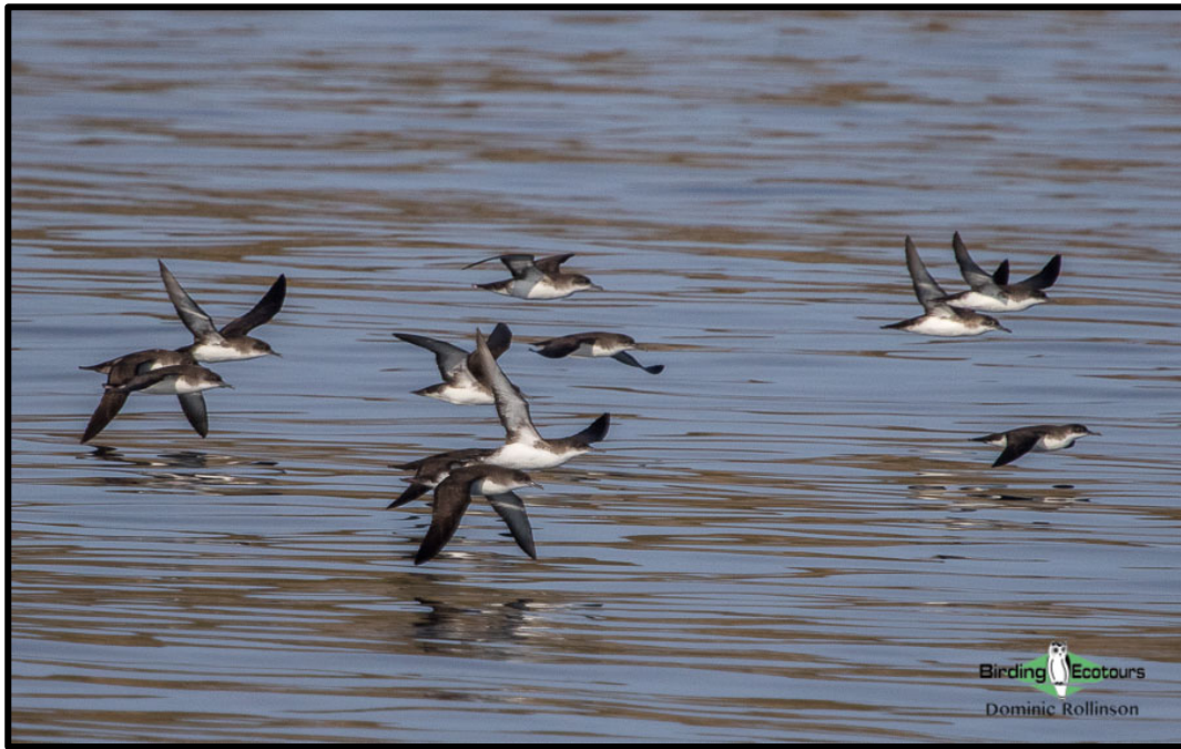
Yelkouan Shearwater may be seen along the Black Sea coast.

Overnight: Guest House Nash Dom, Kavarna Каварна