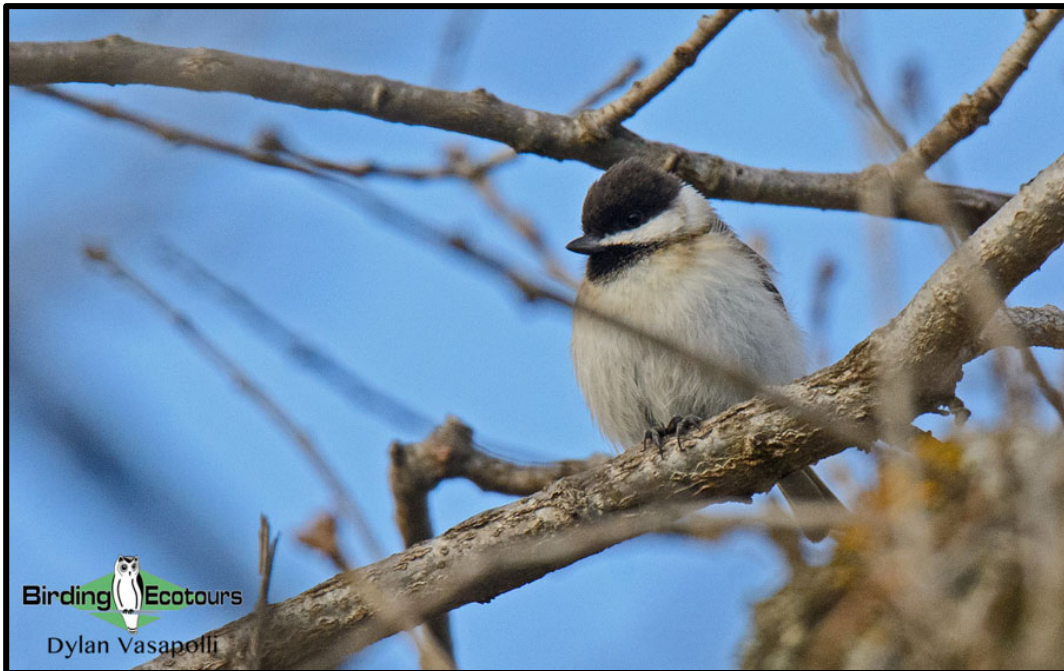
The cute Sombre Tit is possible during this tour.

Durankulak is also surrounded by woodlands, arable fields, and reedbeds which are home to several interesting species, including Syrian Woodpecker , Grey-headed Woodpecker , Calandra Lark , Eurasian Penduline Tit , Black Redstart , Brambling , Hawfinch , Eurasian Bittern , Pygmy Cormorant , Water Rail , Water Pipit , Long-eared Owl , Sombre Tit , Great Grey Shrike , and many others.