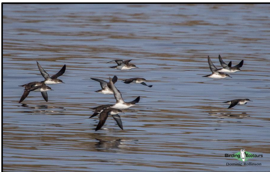
Yelkouan Shearwater may be seen along the Black Sea coast.

Overnight: Guest House Nash Dom, Kavarna Каварна