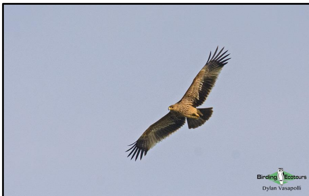
Eastern Imperial Eagle will be a target during the tour.