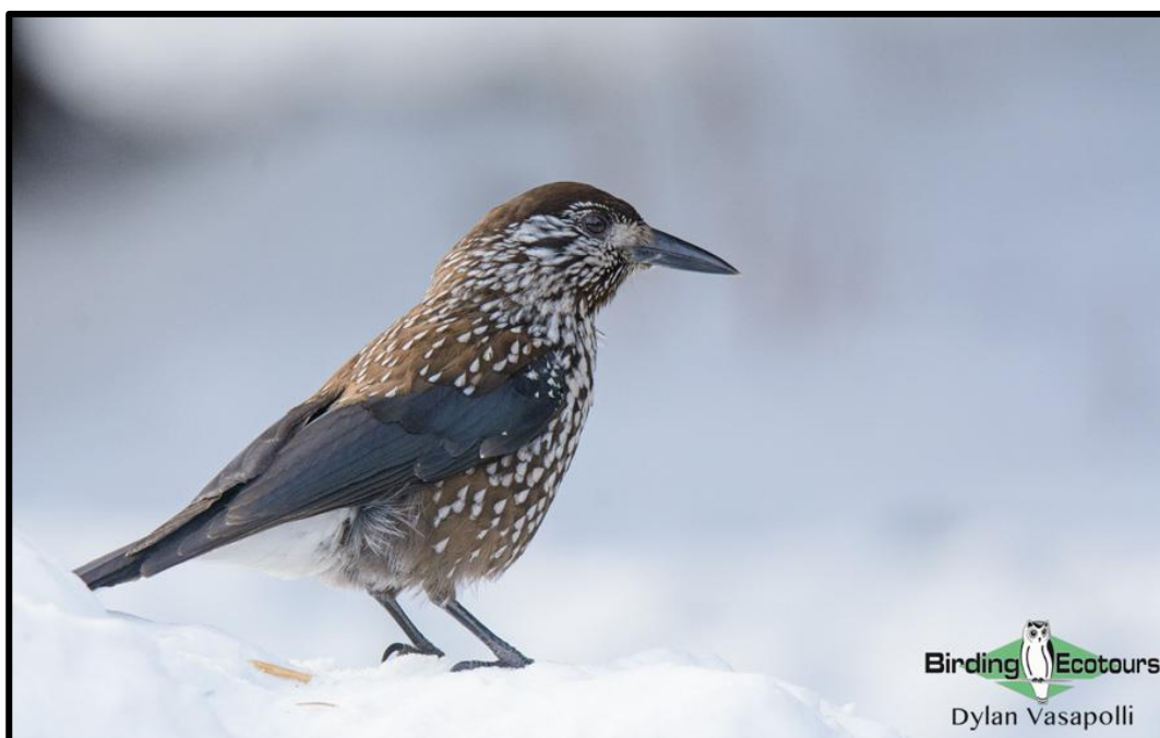
We will search for Spotted Nutcracker in Vitosha Mountain National Park.

The final area we will visit in this part of the country is the vast Durankulak Lake . This is a vitally important migration stopover point but is also very productive in winter. It is here that we will observe the greatest concentrations of geese so far, and hopefully add the Vulnerable ( BirdLife International ) Lesser White-fronted Goose to our list. This area is also good for birds of prey like Long-legged Buzzard and Rough-legged Buzzard . Sadly, this will bring our tour to an end and we will fly from Varna to Sofia and have one final birding session in Sofia ahead of our flights home.