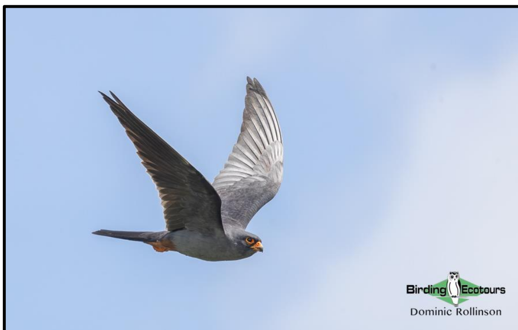
Red-footed Falcons are usually seen in good numbers on this tour.