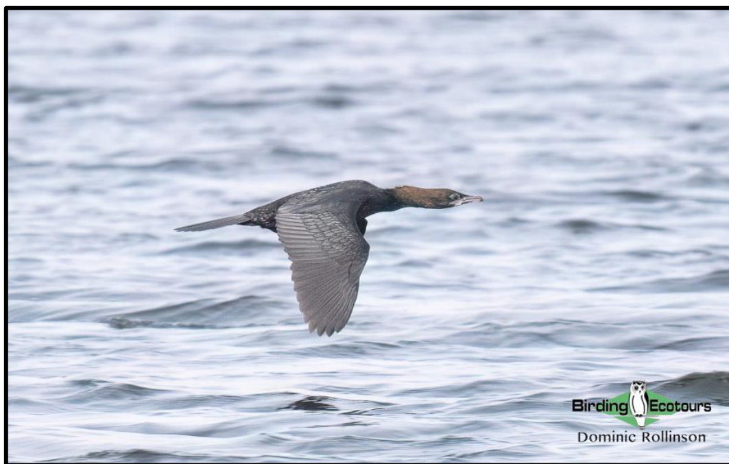
Pygmy Cormorant is common in the Danube Delta.