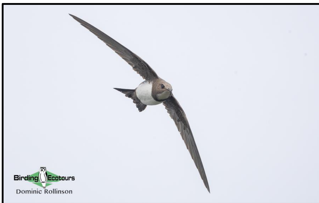
Cape Kaliakra usually holds good numbers of migrants such as Alpine Swift .