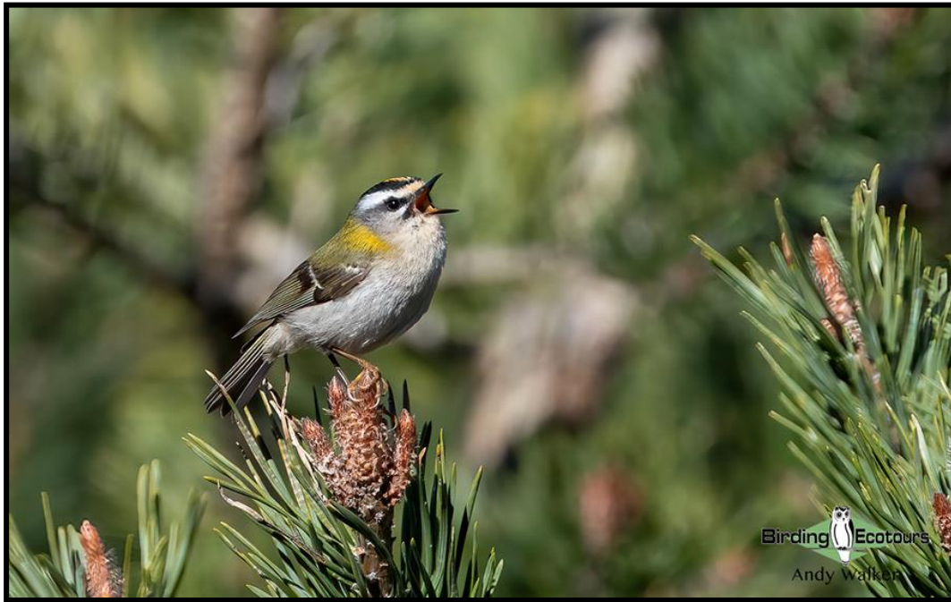
Coniferous forests will be birded for Common Firecrest .