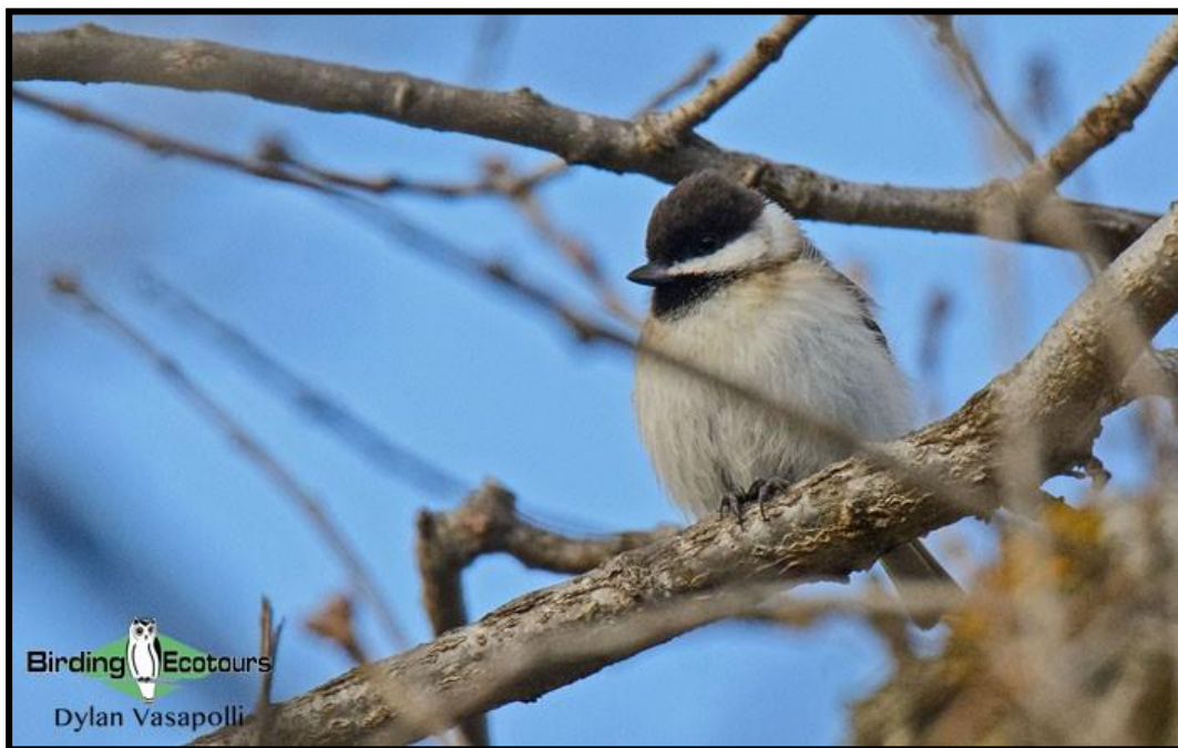
Patches of woodland should produce Sombre Tit.