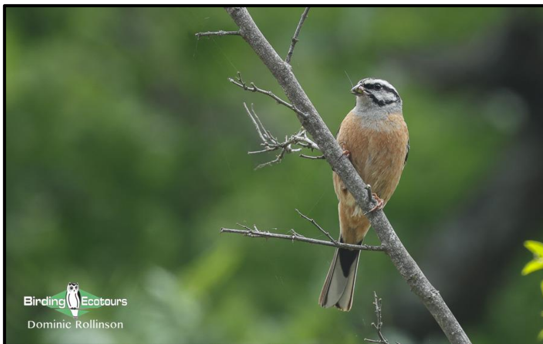
Rock Bunting – one of the several bunting species we are likely to see.

Overnight: Madzharovo, Eastern Rhodopes Conservation Centre