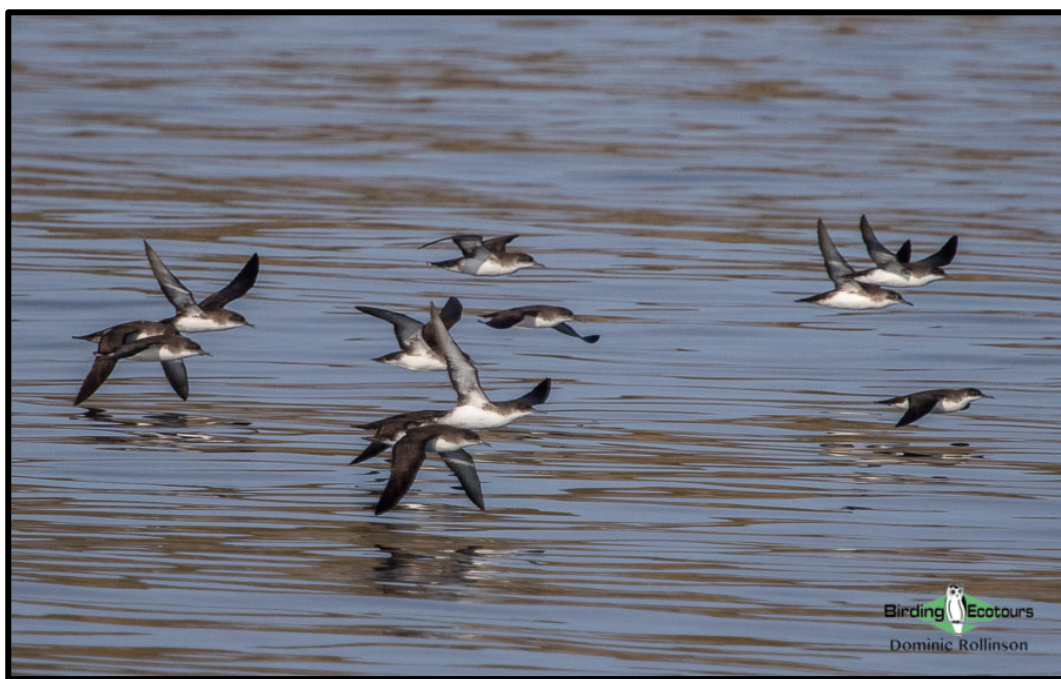
Yelkouan Shearwater may be seen along the Black Sea coast.

Overnight: Guest House Nash Dom, Kavarna Каварна