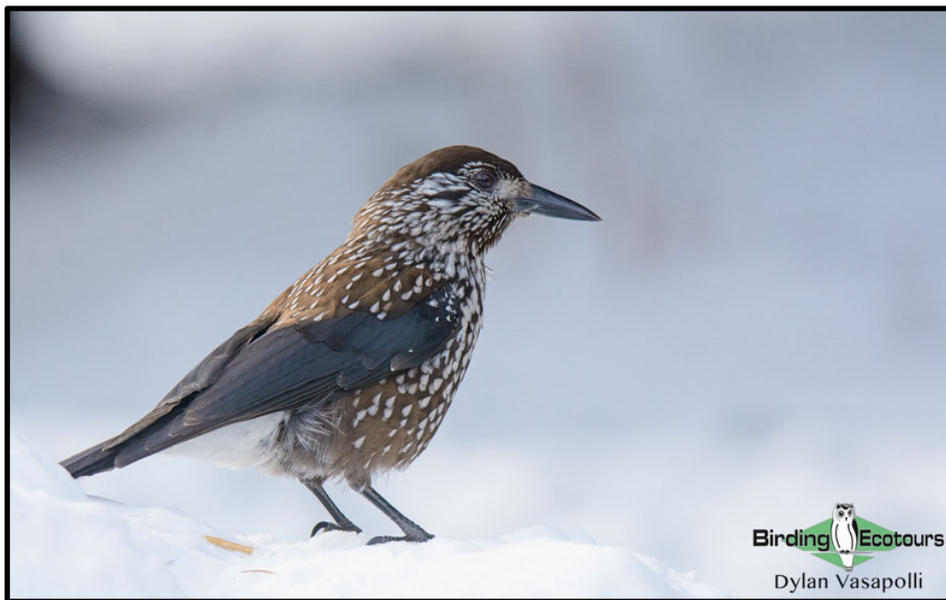
We will search for Spotted Nutcracker in Vitosha Mountain National Park.

The final area we will visit in this part of the country is the vast Durankulak Lake . This is a vitally important migration stopover point but is also very productive in winter. It is here that we will observe the greatest concentrations of geese so far, and hopefully add the Vulnerable ( BirdLife International ) Lesser White-fronted Goose to our list. This area is also good for birds of prey like Long-legged Buzzard and Rough-legged Buzzard . Sadly, this will bring our tour to an end and we will fly from Varna to Sofia and have one final birding session in Sofia ahead of our flights home.