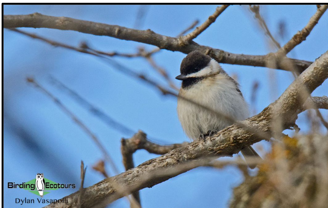
The cute Sombre Tit is possible during this tour.

Durankulak is also surrounded by woodlands, arable fields, and reedbeds which are home to several interesting species, including Syrian Woodpecker , Grey-headed Woodpecker , Calandra Lark , Eurasian Penduline Tit , Black Redstart , Brambling , Hawfinch , Eurasian Bittern , Pygmy Cormorant , Water Rail , Water Pipit , Long-eared Owl , Sombre Tit , Great Grey Shrike , and many others.