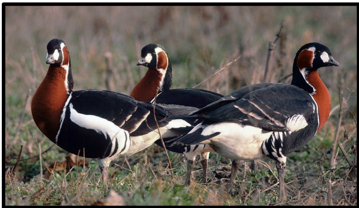
The striking Red-breasted Goose is a special of the Kavarna area.