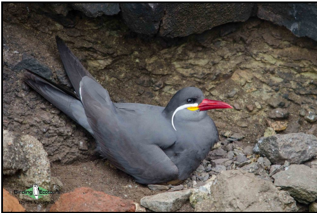
Perhaps the prettiest tern in the world, Inca Tern .

Our magnificent tour is designed to take you across the central Andes of Peru, visiting different habitats and ecosystems at varying elevations providing diverse sets of unique avian species, including several country endemics not found anywhere else. We start the trip by visiting the coast of Lima, exploring the cold waters of the Humboldt Current and habitats on the western slopes of the Andes, such as freshwater lagoons, the dry Pacific desert, the unique Peruvian lomas (areas of fog-watered vegetation in the coastal desert), the dry inter-Andean valleys, and the high-elevation mountains at the base of the mighty, snow-capped Central Andes. We will also visit the endangered Polylepis forest, which holds several sought-after Andean species. We then descend the eastern slopes of the Andes, where we explore elfin forest, like páramos, lush cloudforest and upper Amazon forest.