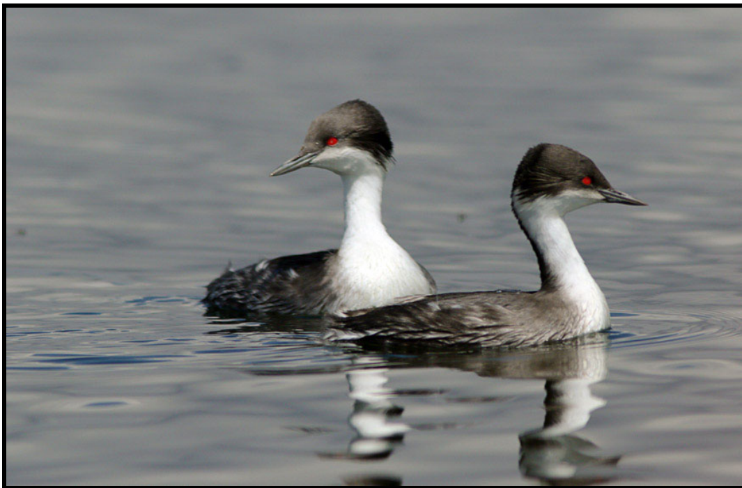
The flightless Junin Grebe; our primary target at Lake Junin.