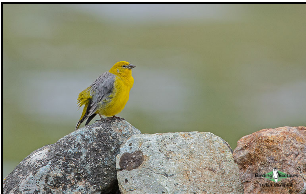
Bright-rumped Yellow Finch - a high-altitude special.