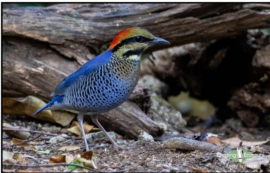
Blue Pitta is a stunning bird, and we hope to see it during the tour.

We will fly from Ho Chi Minh City's Tan Son Nhat International Airport to Pleiku airport, Kon Tum Province in Central Vietnam. After arrival at Pleiku we will drive to Mang Den, our first birding stop in Central Vietnam.