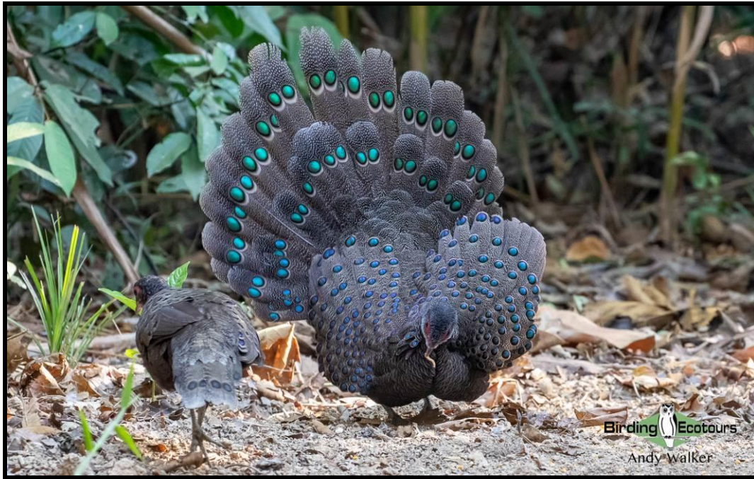
Germain's Peacock-Pheasant is a target while birding at Cat Tien National Park.

Cat Tien was the first national park to be established in southern Vietnam. The park has an impressive bird list, with more than 300 species recorded, including several globally threatened species and Indochinese endemics, such as Germain's Peacock-Pheasant , Orange-necked Partridge (with luck), Siamese Fireback , Green Peafowl , Pale-headed Woodpecker , Barbellied Pitta , Blue-rumped Pitta , and Grey-faced Tit-Babbler .