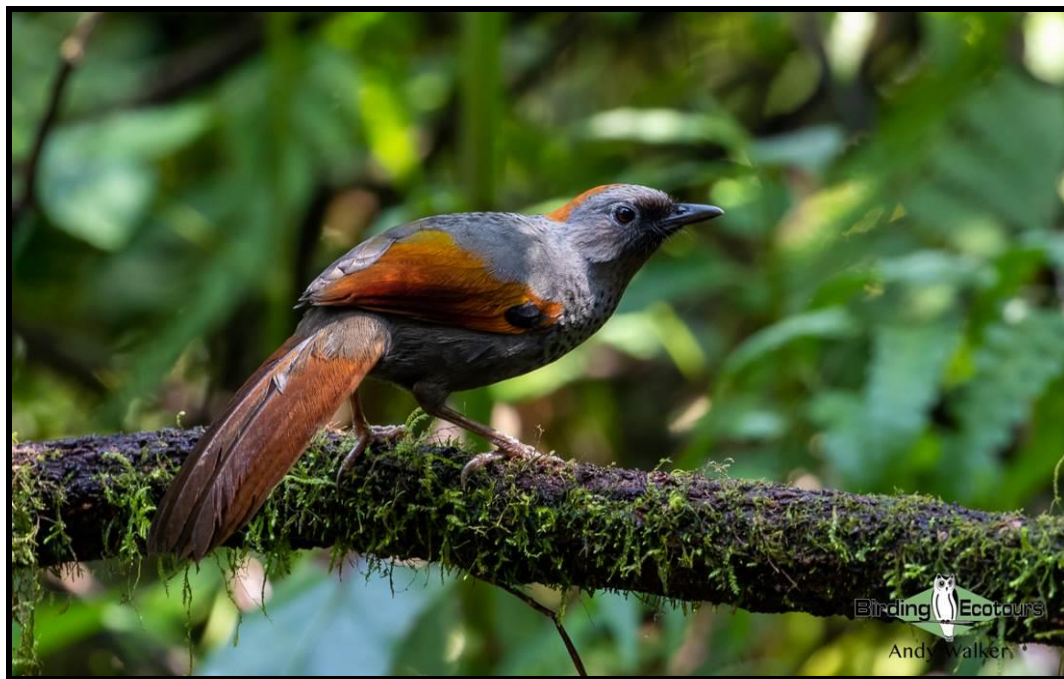
One of our targets at Ngoc Linh Nature Reserve is Golden-winged Laughingthrush .

Red-tailed Laughingthrush, Green Shrike-babbler, Brown-crowned Scimitar Babbler, Red-tailed Minla, Green Cochoa, Golden-breasted Fulvetta, and Rusty-capped Fulvetta.