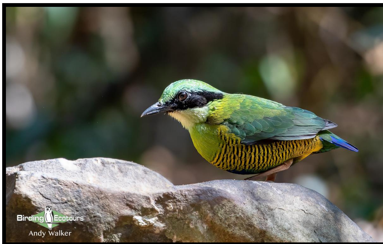
Bar-bellied Pitta, one of the stunning near-endemic targets on this exciting tour.

08 – 23 MARCH 2025 25 MARCH – 09 APRIL 2025