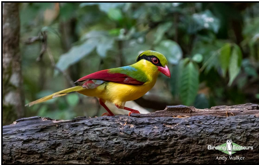
The striking Indochinese Green Magpie can be seen on this tour.

Some of the key species we will look for during the tour include, but are certainly not limited to, Bar-bellied Pitta, Blue-rumped Pitta, Blue Pitta, Rusty-naped Pitta, Siamese Fireback, Silver Pheasant, Green Peafowl, Germain's Peacock-Pheasant, Orange-necked Partridge, Pale-headed Woodpecker, Necklaced Barbet, Red-vented Barbet, Long-tailed Broadbill, Silver-breasted Broadbill, Green Cochoa, Orange-breasted Laughingthrush, Chestnut-eared Laughingthrush, Golden-winged Laughingthrush, Red-tailed Laughingthrush, White-cheeked Laughingthrush, Black-hooded Laughingthrush, Brown-crowned Scimitar Babbler, Red-tailed Minla, Indochinese Fulvetta, Black-crowned Barwing, Short-billed Scimitar Babbler, Indochinese Green Magpie, Ratchet-tailed Treepie, Dalat Bush Warbler, Vietnamese Greenfinch, Vietnamese Cutia, Grey-crowned Crocias , and plenty more. The tour also offers excellent animals, including gibbons, monkeys, and interesting reptiles.