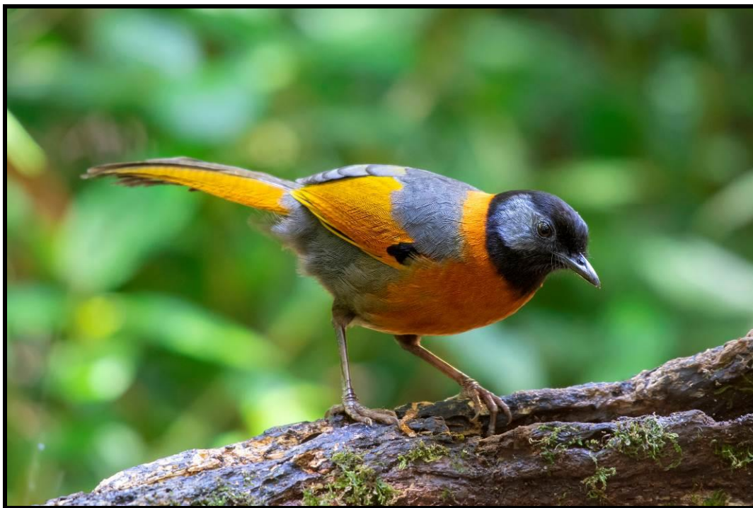
Collared Laughingthrush is a beautiful yet rare Vietnamese endemic.

Laughingthrush. Other target birds in this national park include Rusty-naped Pitta , Yellow-billed Nuthatch , White-spectacled Warbler , Chestnut-crowned Warbler , Kloss's Leaf Warbler , Mrs. Gould's (Annam) Sunbird , Spotted Forktail , Black-throated (Grey-crowned) Bushtit , Hume's Treecreeper , Grey-bellied Tesia , Dark-sided Thrush , Short-tailed Scimitar Babbler , and a very distinctive endemic subspecies of Red (Dalat) Crossbill .