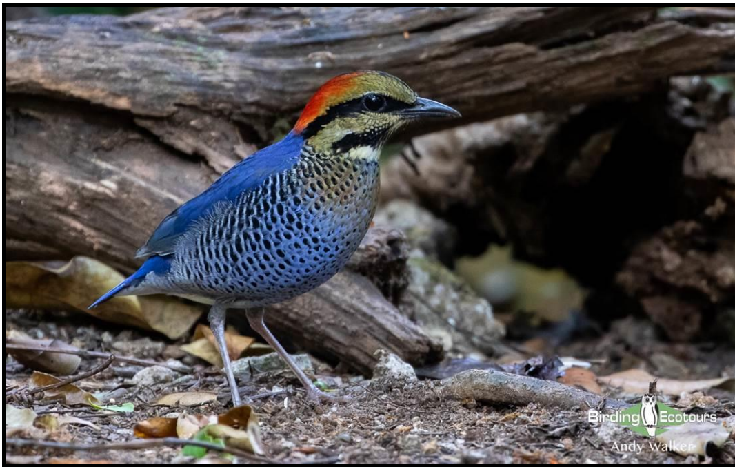
Blue Pitta is a stunning bird, and we hope to see it during the tour.

We will fly from Ho Chi Minh City's Tan Son Nhat International Airport to Pleiku airport, Kon Tum Province in Central Vietnam. After arrival at Pleiku we will drive to Mang Den, our first birding stop in Central Vietnam.