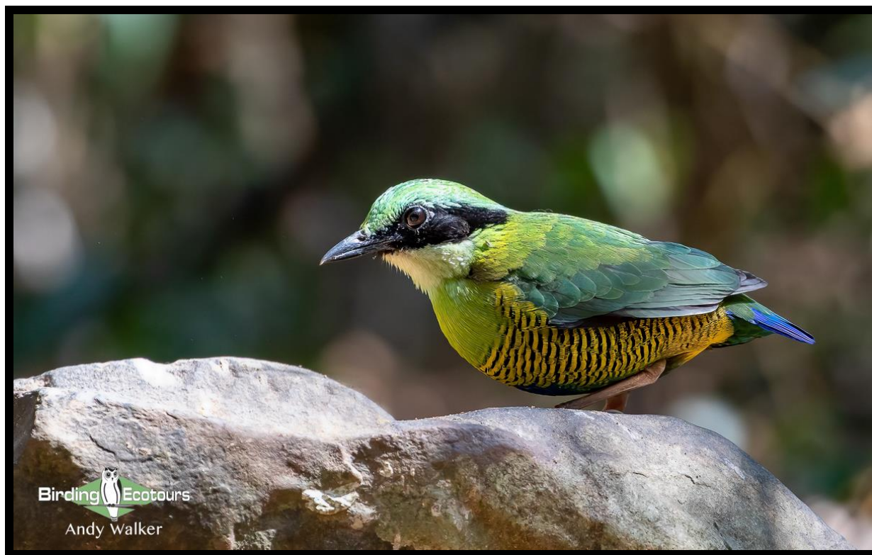
Bar-bellied Pitta, one of the stunning near-endemic targets on this exciting tour.