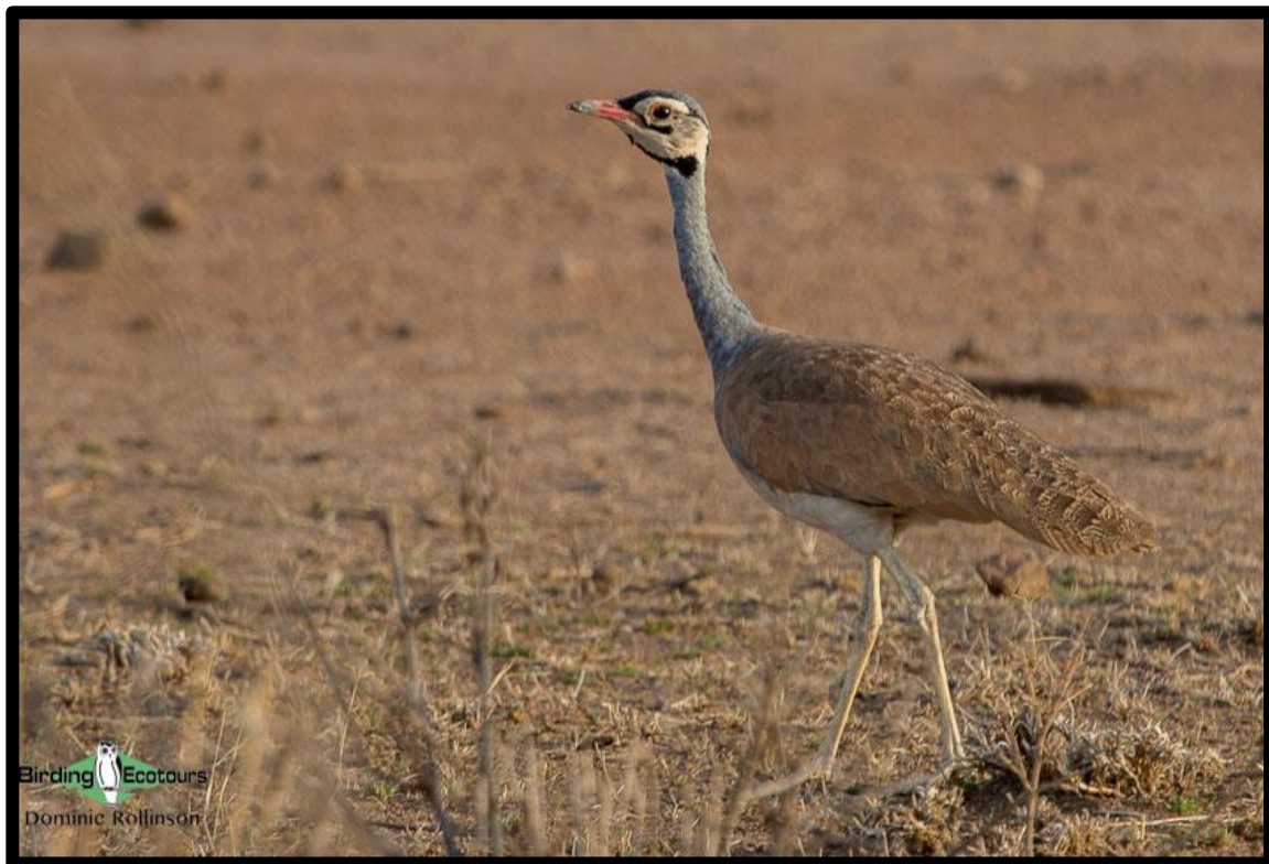
White-bellied Bustard should be seen on the plains of the Maasai Mara.