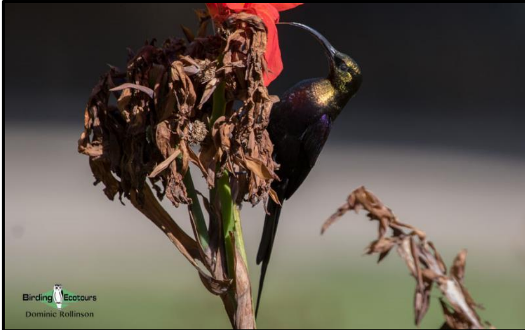
Tacazze Sunbird is one of the many beauties we will look for at Thomson's Falls.

In the afternoon, we will arrive on the forested slopes of the mighty Mount Kenya – Africa's second-highest peak at 17,060 feet (5,199 meters)! Our lodge is situated on the southern slopes of Mount Kenya, surrounded by lush montane forests. During our first birding session, we may encounter species like Hartlaub's Turaco , Grey , Black-collared , and Black-throated Apalis , Mountain Oriole , Red-fronted Parrot , Silvery-cheeked Hornbill , Bar-tailed Trogon , Kikuyu Mountain Greenbul , African Hill Babbler , Kandt's Waxbill , Scarce Swift , and Black-fronted Bushshrike , among so many other fantastic birds.