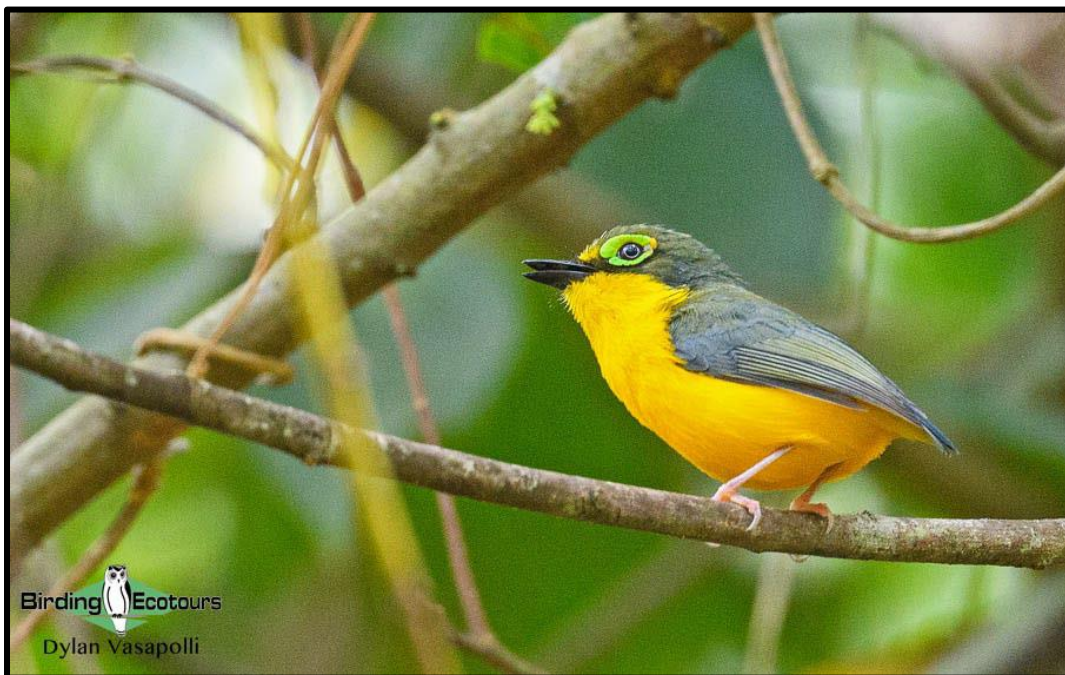
The brightly colored Yellow-bellied Wattle-eye is found in Kakamega Forest.

Overnight: Rondo Retreat Center , Kakamega Forest