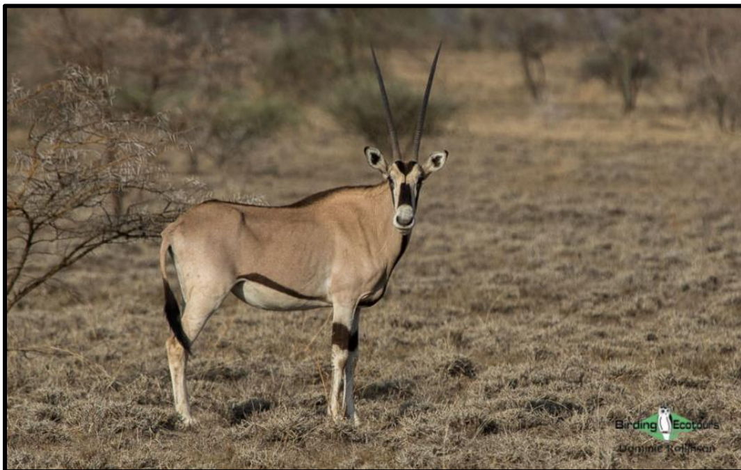
Samburu National Reserve is home to large numbers of mammals, including this impressive Beisa Oryx .