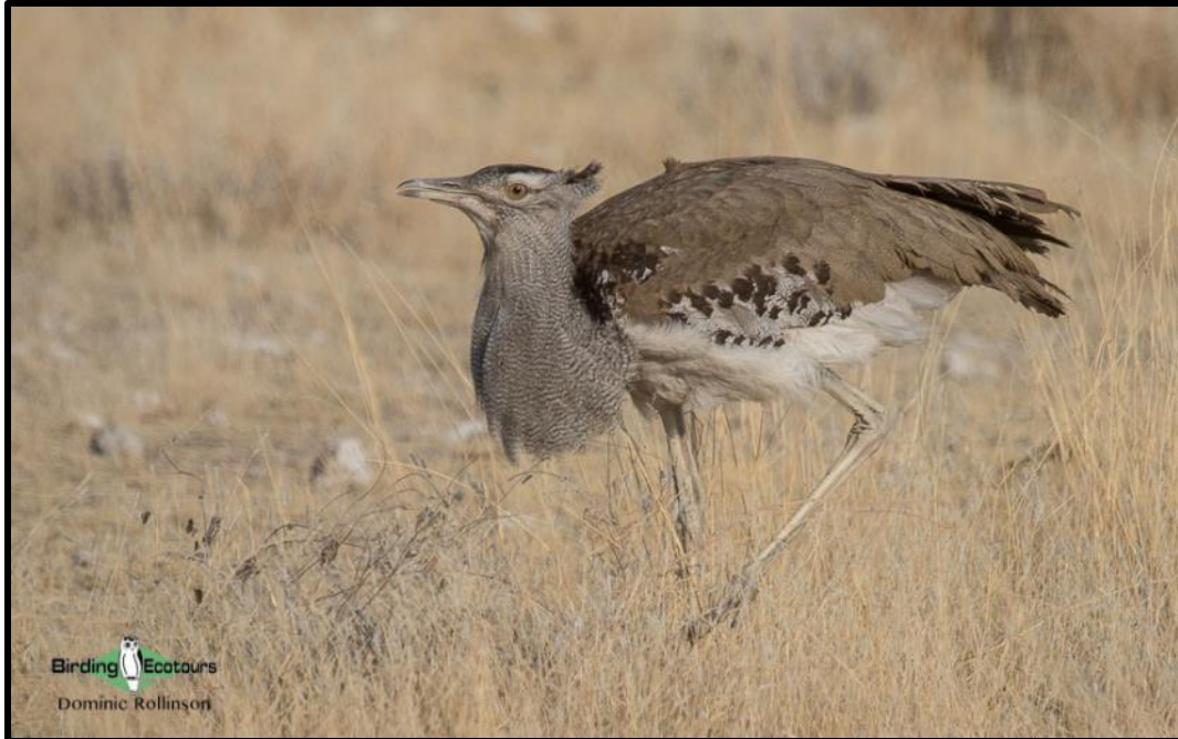
The massive Kori Bustard is often seen strolling across the open plains.

We'll arrive in time for lunch and take an afternoon game drive for some of the big game animals and local birds like Kori Bustard (the world's heaviest flying bird), several of the seven species of vultures here, including Egyptian, Hooded, Rüppell's, Lappet-faced, and White-headed, Secretarybird, Coqui Francolin, Von der Decken's Hornbill, Hildebrandt's Starling, Red-fronted, Spot-flanked and Usambiro Barbets, Northern White-crowned Shrike, and Silverbird.