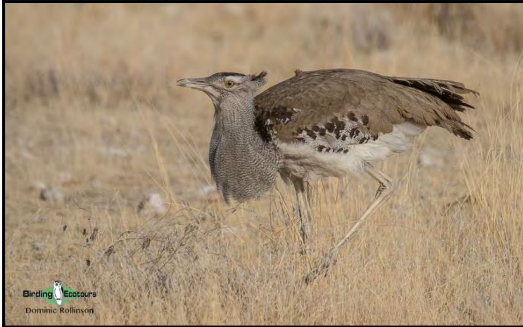
The massive Kori Bustard is often seen strolling across the open plains.

We'll arrive in time for lunch and take an afternoon game drive for some of the big game animals and local birds like Kori Bustard (the world's heaviest flying bird), several of the seven species of vultures here, including Egyptian, Hooded, Rüppell's, Lappet-faced, and White-headed, Secretarybird, Coqui Francolin, Von der Decken's Hornbill, Hildebrandt's Starling, Red-fronted, Spot-flanked and Usambiro Barbets, Northern White-crowned Shrike, and Silverbird.