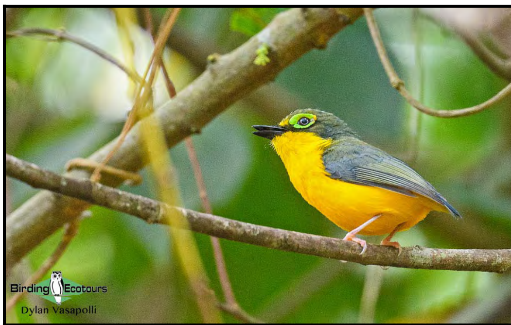
The brightly colored Yellow-bellied Wattle-eye is found in Kakamega Forest.

Overnight: Rondo Retreat Center , Kakamega Forest