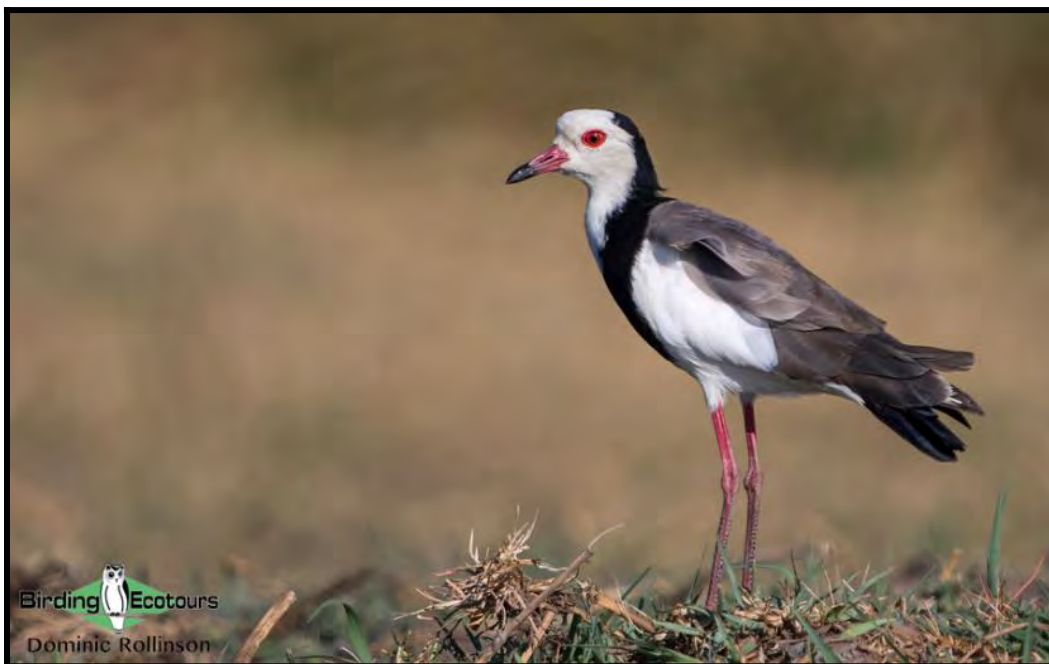
The strikingly colored Long-toed Lapwing can be seen at Lake Naivasha.

Up to 80 waterbird species have been recorded during censuses, including White-backed Duck , Saddle-billed Stork , Marabou Stork , African Spoonbill , Great Crested Grebe , the ubiquitous but attractive African Jacana , and various striking lapwing species such as Long-toed and Spur-winged Lapwings .