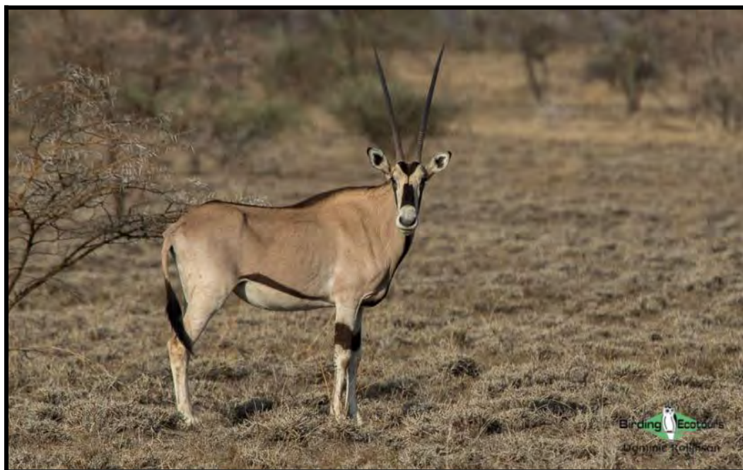
Samburu National Reserve is home to large numbers of mammals, including this impressive Beisa Oryx .