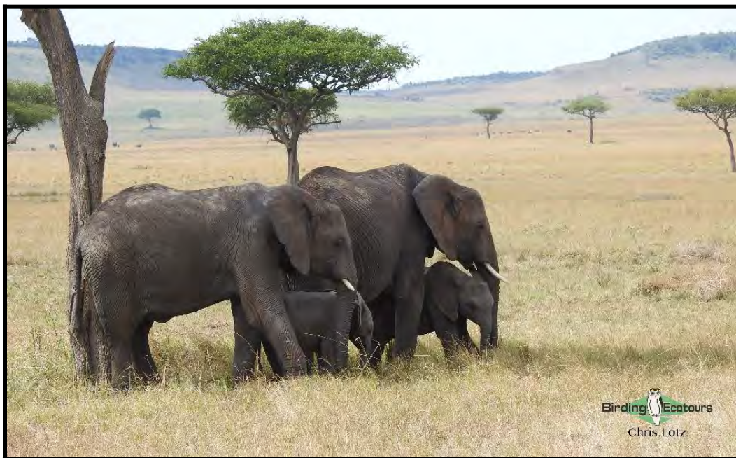
African Elephants with youngsters in the Maasai Mara.

Kenya is smaller than Texas yet boasts an incredible 1,162 bird species. A relatively modest ten of these species are single-country endemics, but Kenya also boasts a range of East African endemics, including a number of species that occur only in Kenya and Tanzania. The country has 62 Important Bird Areas (IBAs) and some of the most famous game parks in the world, including the Maasai Mara and its endless migrating wildebeest herds, Amboseli with Mount Kilimanjaro as a backdrop, and many others.