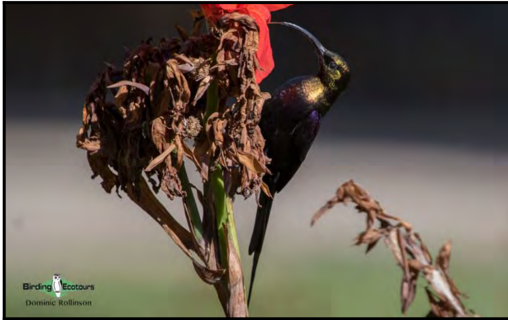
Tacaze Sunbird is one of the many beauties we will look for at Thomson's Falls.

In the afternoon, we will arrive on the forested slopes of the mighty Mount Kenya – Africa's second-highest peak at 17,060 feet (5,199 meters)! Our lodge is situated on the southern slopes of Mount Kenya, surrounded by lush montane forests. During our first birding session, we may encounter species like Hartlaub's Turaco , Grey , Black-collared , and Black-throated Apalis , Mountain Oriole , Red-fronted Parrot , Silvery-cheeked Hornbill , Bar-tailed Trogon , Kikuyu Mountain Greenbul , African Hill Babbler , Kandt's Waxbill , Scarce Swift , and Black-fronted Bushshrike , among so many other fantastic birds.