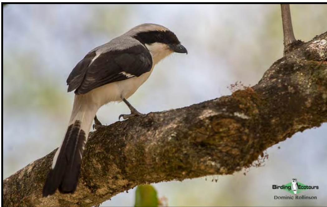
Grey-backed Fiscal may be seen at Lake Nakuru National Park.