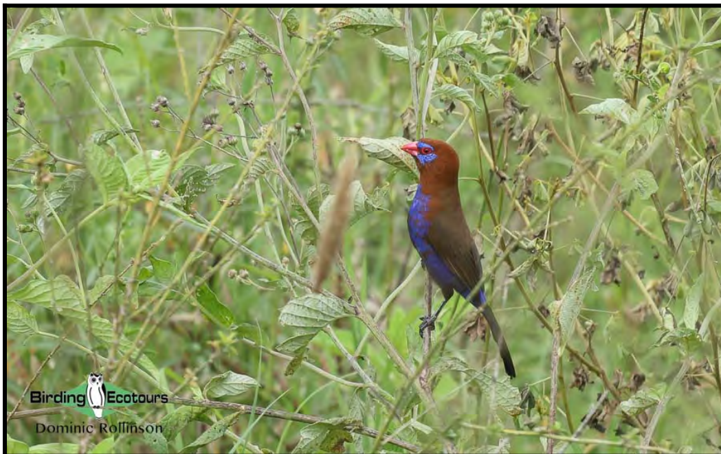
The gorgeous Purple Grenadier is common on this tour.