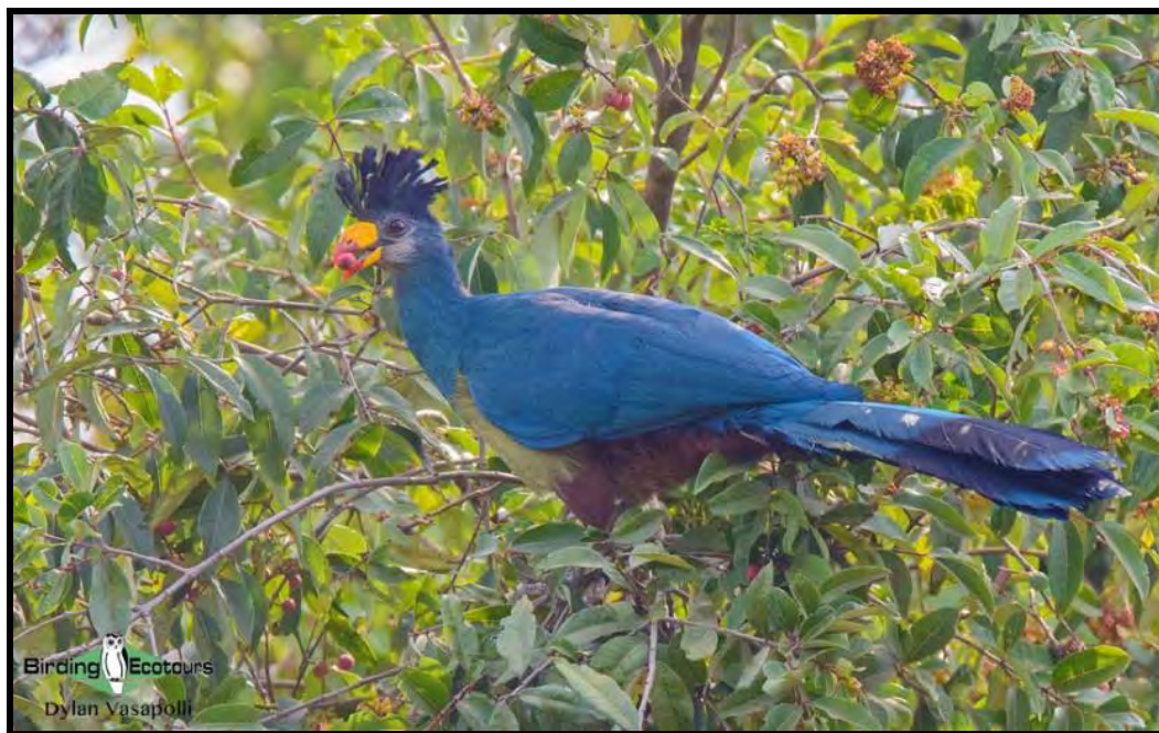
Great Blue Turaco is loud and conspicuous in Kakamega Forest.

Overnight: Rondo Retreat Center , Kakamega Forest