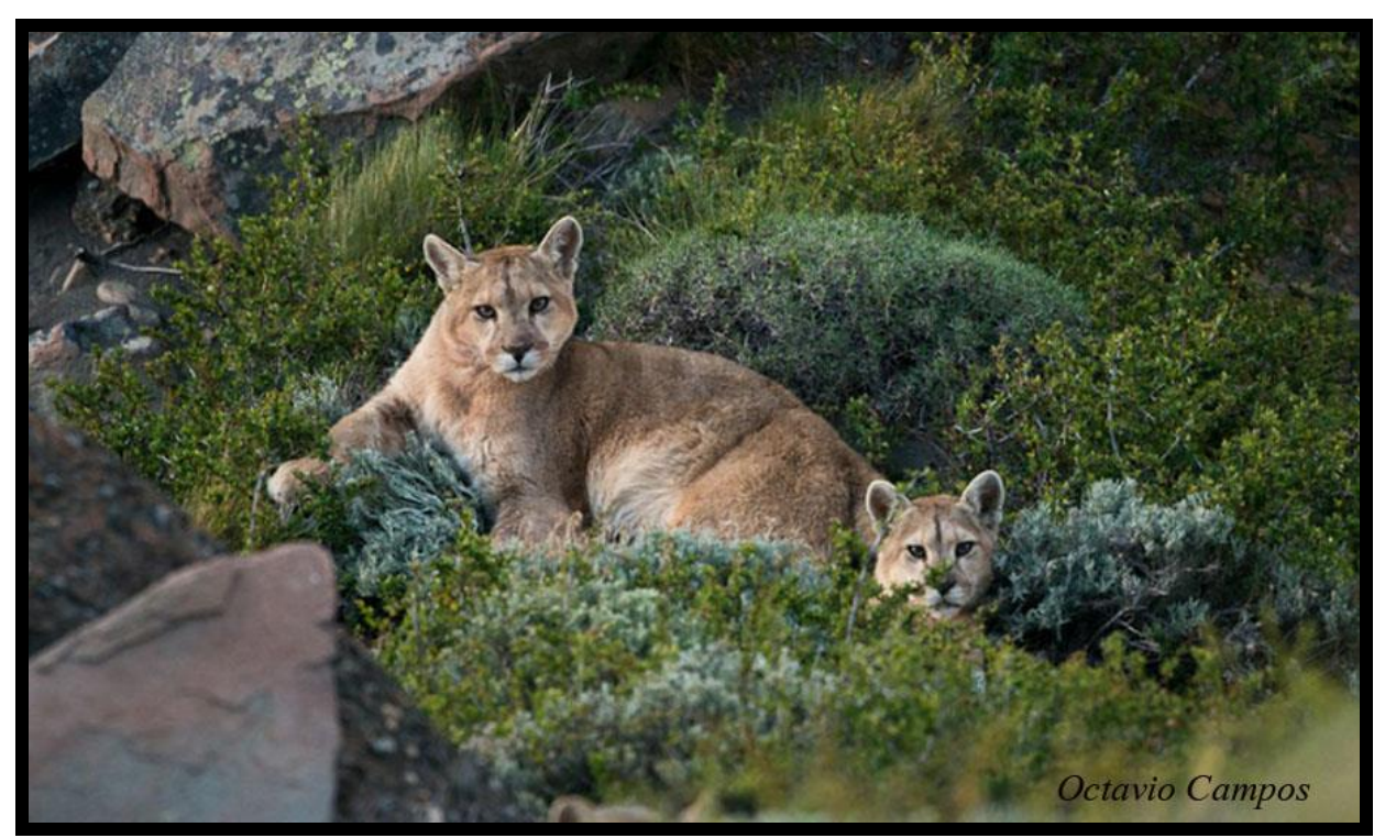
Three full days will be spent in Torres del Paine National Park searching for Puma , the "lord of the Andes".

13 – 20 OCTOBER 2024 11 – 18 OCTOBER 2025 11 – 18 OCTOBER 2026