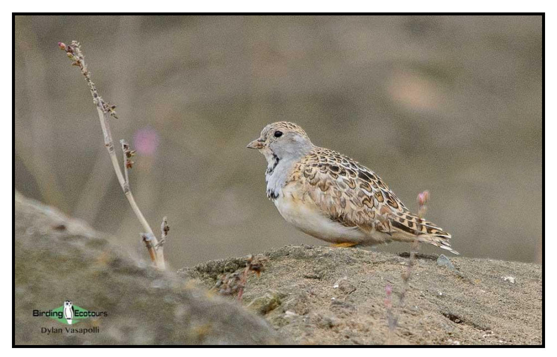
Lesser Seedsnipe should be seen in the Patagonian steppes.

Overnight: Hostería Pehoé, Torres del Paine