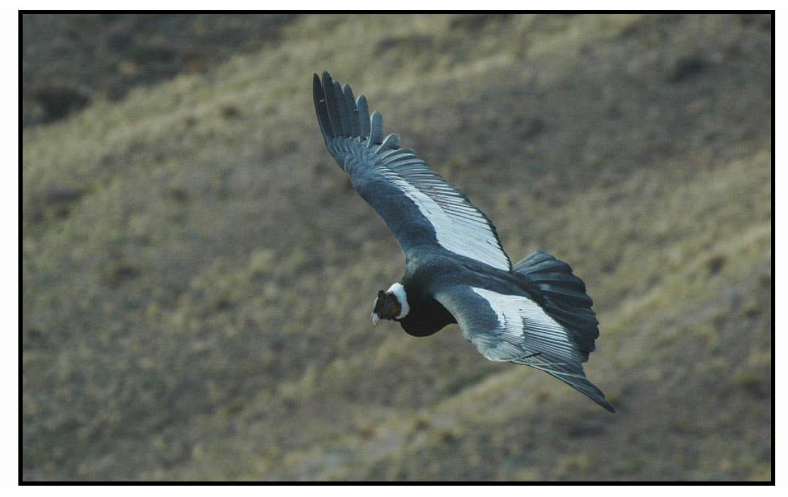
Andean Condor is one of the big targets in the Andes.

Torres del Paine is a remote refuge where the Patagonian wildlife is tame and abundant. Here we can expect to see the inquisitive Guanaco , Patagonian Fox , Patagonian Huemul (Andean deer), Large Hairy Armadillo , Andean Condor , Black-faced Ibis , and Torrent Duck , which all share the mountain landscape with the top predator of the region, Puma or mountain lion. This <u>Chile</u> birding and mammal tour focuses on the observation and photography of this large, elegant cat in the most spectacular area of its entire range.