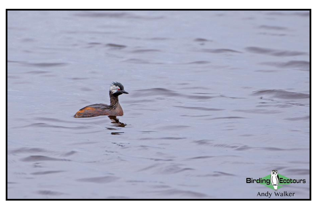
We may see White-tufted Grebe in Puerto Natales.

Overnight: Hotel Cabo de Hornos or similar, Punta Arenas