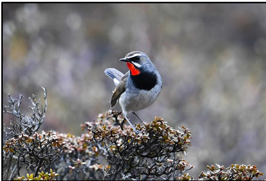
The gorgeous Chinese Rubythroat is always a highly desired species (Photo P. He).

Overnight: Sun Lake Holiday Hotel, or similar, Yushu