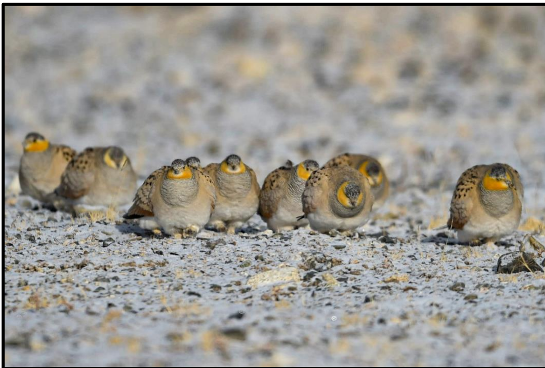
A family of Tibetan Sandgrouse is a delightful sight while birding on the plateau.

The tour begins in Xining, where we start our birding in the local hills, and ancient conifer woods of Dongxia Forest Park to the north of Xining, for Przevalski's Partridge , the beautiful White-browed Tit-warbler , and Crested Tit-warbler , Przevalski's Nuthatch , endemic thrushes, leaf warblers, and vivid Qilian Bluetail (recently split and now a breeding endemic). Leaving the capital, we drive to our next hotel located on the shores of the vast and spectacular Qinghai Lake . Against a breathtaking mountainous backdrop we will bird the wetlands around the lake, targeting