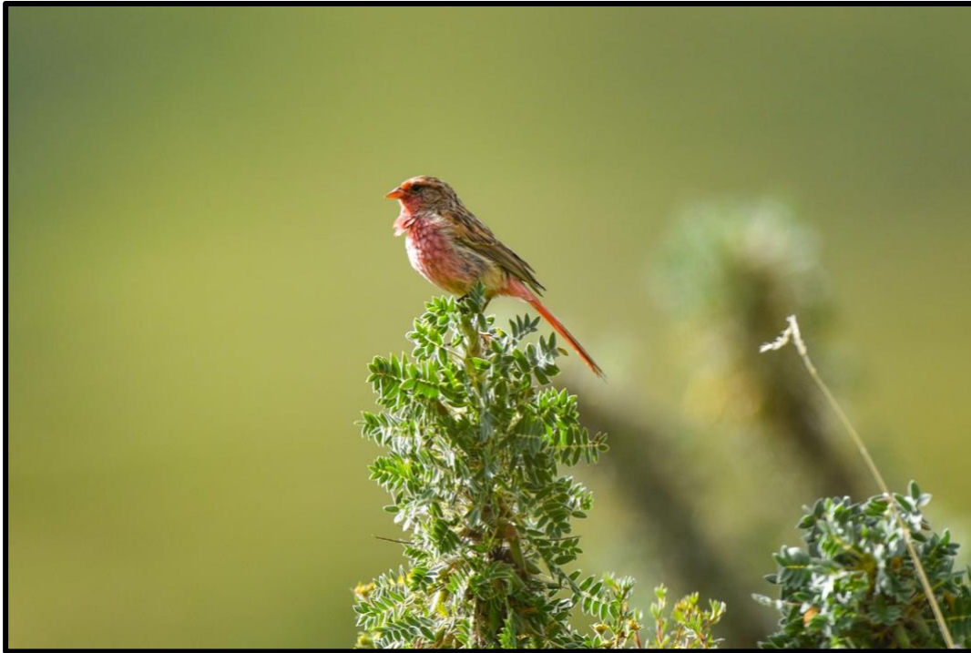
Przevalski's Finch is a monotypic family and is always a tour highlight.

some specials of the eastern Qinghai-Tibet Plateau. The scenery here is especially striking, with sweeping views across scrub-covered slopes and open alpine meadows, which should be in bloom during our visit. The mixture of flowering pastures and dense low vegetation makes this one of the more bird-rich mountain areas of the tour.