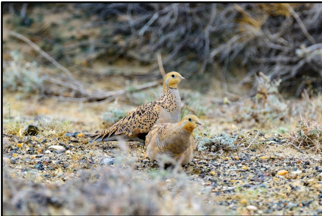
Pallas's Sandgrouse can be found in the Chaka area.

We will enjoy two full days' birding around the Chaka area. Some of the areas we might visit while here include Chaka Valley , Chaka Salt Lake , Chaka Flats , and the nearby Lake Xiligou . We will spend time birding the striking, starkly beautiful desert and rugged mountain ranges of Chaka, searching for plateau and desert species. These are some of the most remote and evocative landscapes of the tour. We have two full days to ensure we have a good chance of connecting with our special targets here, as some require a lot of patience to see, being well camouflaged in these vast and unforgiving surroundings. Our main targets include the gorgeous high-altitude desert specialist, Pallas's Sandgrouse , which is perfectly adapted to the desert steppe it thrives in. Other major targets include the brilliant Mongolian Ground Jay , Pere David's Snowfinch , Blanford's Snowfinch , and a whole host of special gamebirds such as Tibetan Partridge , Daurian Partridge , Przevalski's Partridge , the amazing Tibetan Snowcock , and with luck, Himalayan Snowcock . Other ground-based desert and mountain specialists include a long list of larks, pipits, and their allies, likely to include Isabelline Shrike , Chinese Grey Shrike , Ground Tit , Horned Lark , Hume's Short-toed Lark , Mongolian Lark , Tibetan Lark , Asian Short-toed Lark , Desert Wheatear , Eastern Yellow Wagtail , Citrine Wagtail , Rosy Pipit , and Mongolian Finch .