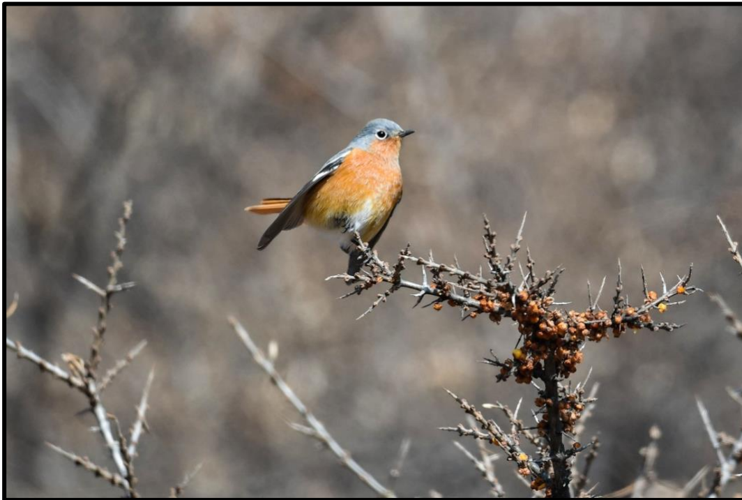
Przevalski's Redstart is one of the many stunning localized species we target.

Overnight: Plateau Sapphire Hotel, or similar, Gangcha