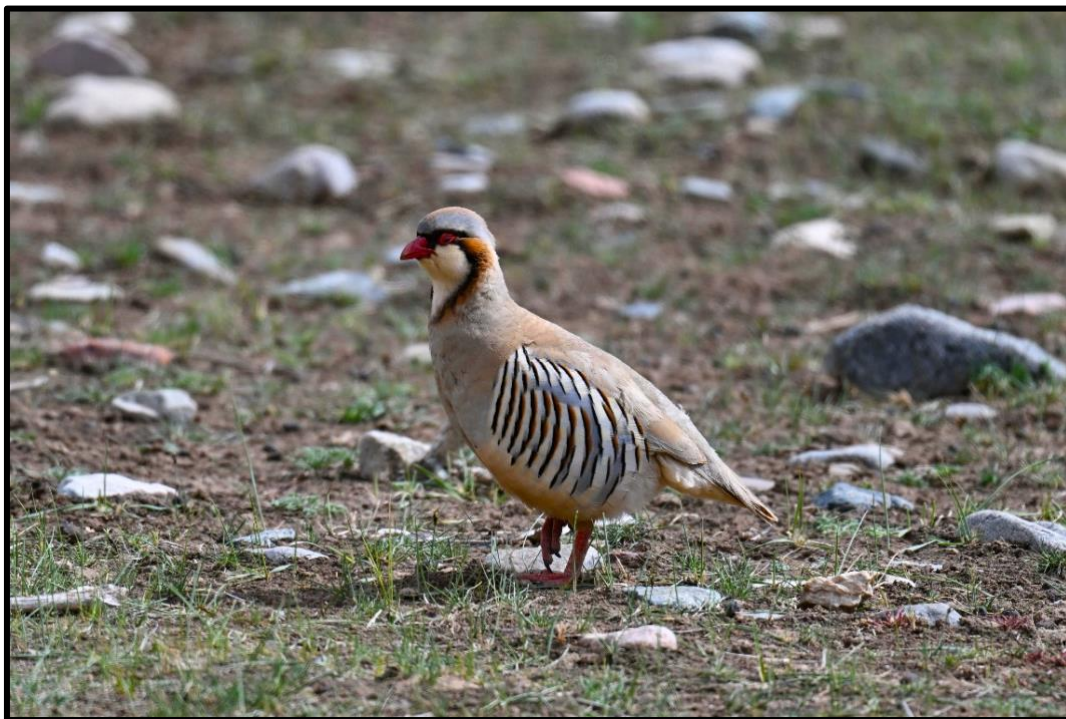
Przevalski's Partridge is one of our early tour targets and one of many interesting and localized gamebirds we can find on the tour.

Overnight: Boli Yabu Hotel, or similar, Xining