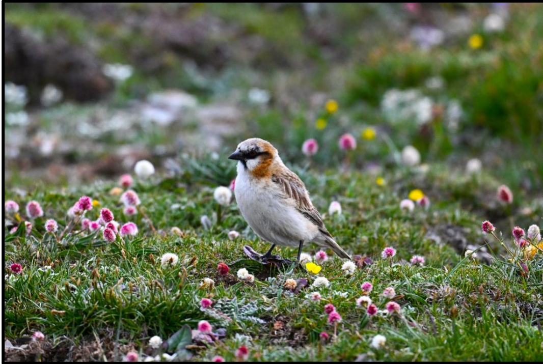
Rufous-necked Snowfinch is one of six beautiful snowfinches that we will target on this tour.

Overnight: Hainan Shenghu Yuelan International Hotel, or similar, Gonghe