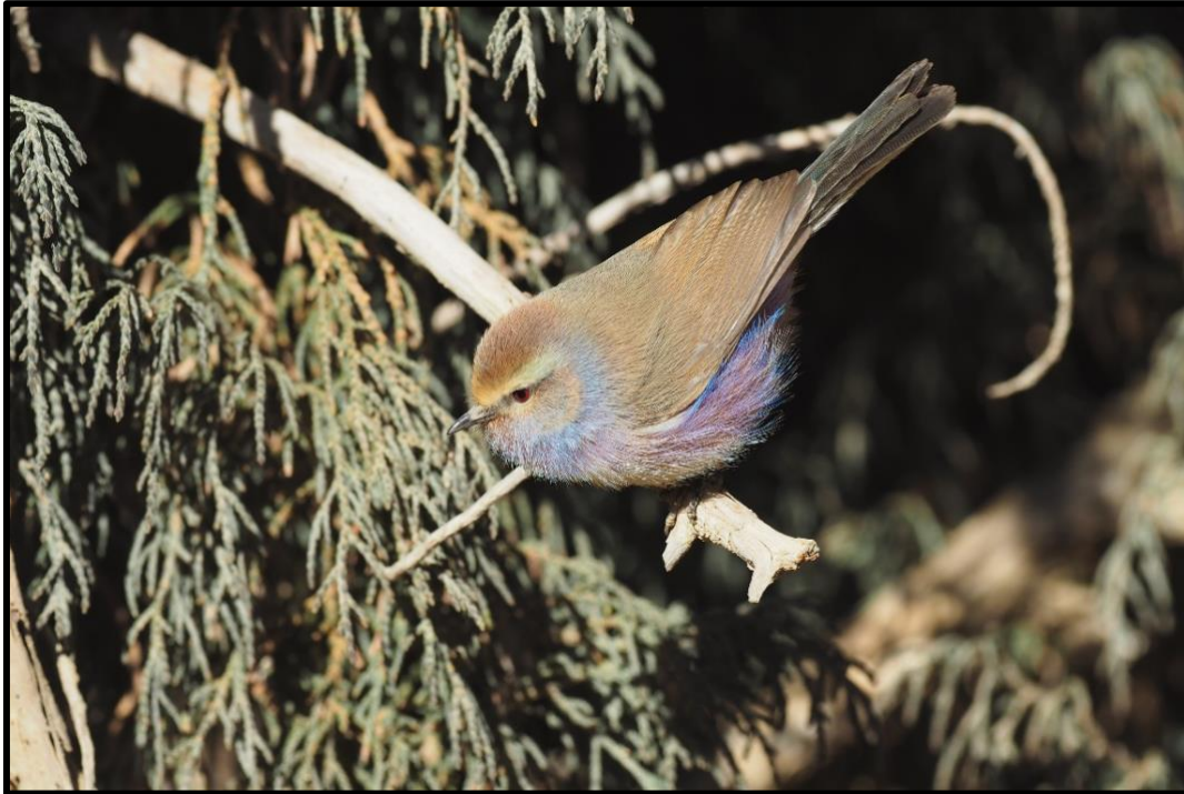
The beautiful White-browed Tit-warbler can be seen along the Kanda Shan pass.

golden hours to search for pheasants. Alongside the endemic Buff-throated Monal-Partridge , we have chances for White Eared Pheasant , Blood Pheasant , Tibetan Snowcock , and Tibetan Partridge . As the day unfolds, we will walk quiet forest trails and scan alpine meadows, focusing on a wide range of woodpeckers, tits, warblers, roserfinches, and others. High-priority targets include localized species such as Sichuan Tit , Chinese Fulvetta , Tibetan Babax , Przevalski's Nuthatch , and Tibetan Serin , along with beautiful and impressive species like Crested Tit-warbler , Giant Laughingthrush , Himalayan Bluetail , Maroon-backed Accentor , and Three-banded Rosefinch .