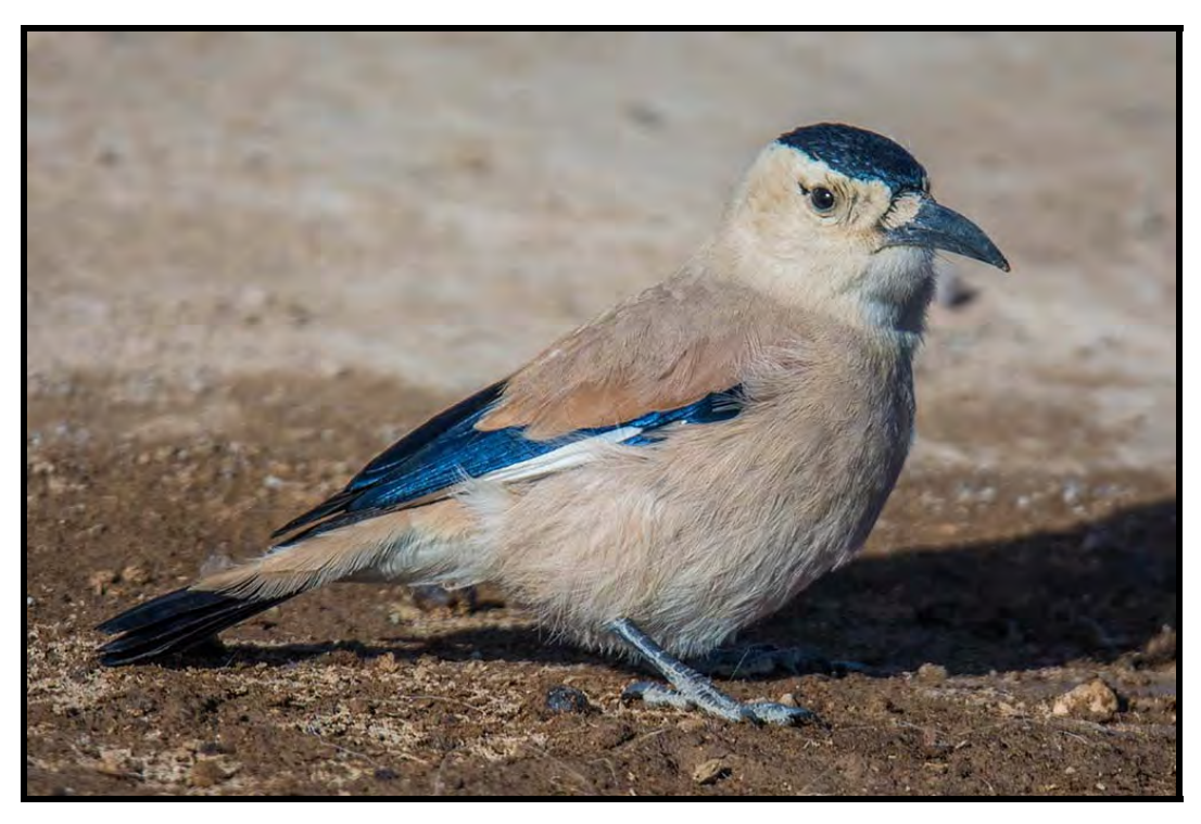
We will be in the realm of Henderson's Ground Jay today and we will be on the look out for this great and highly sought-after species.