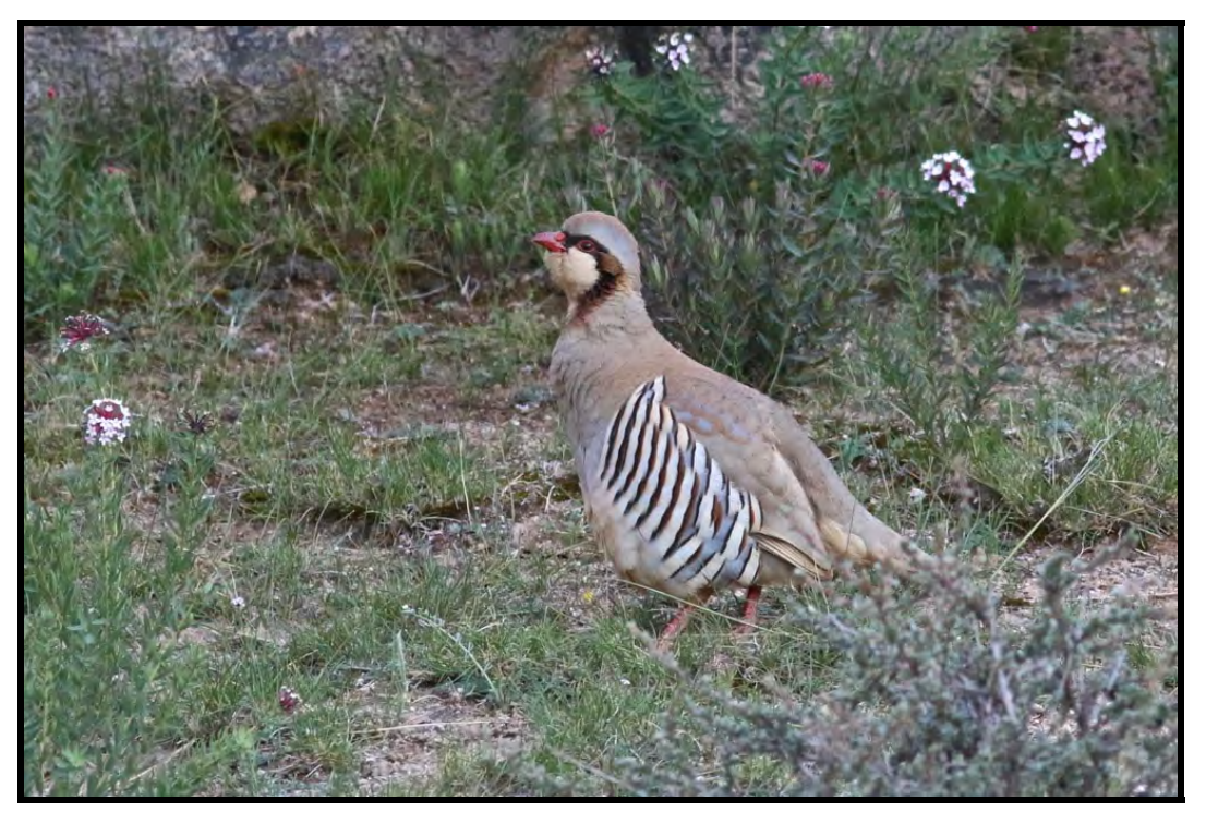
Przevalski's Partridge is one of our early tour targets and one of many interesting and localized gamebirds we can find on the tour.