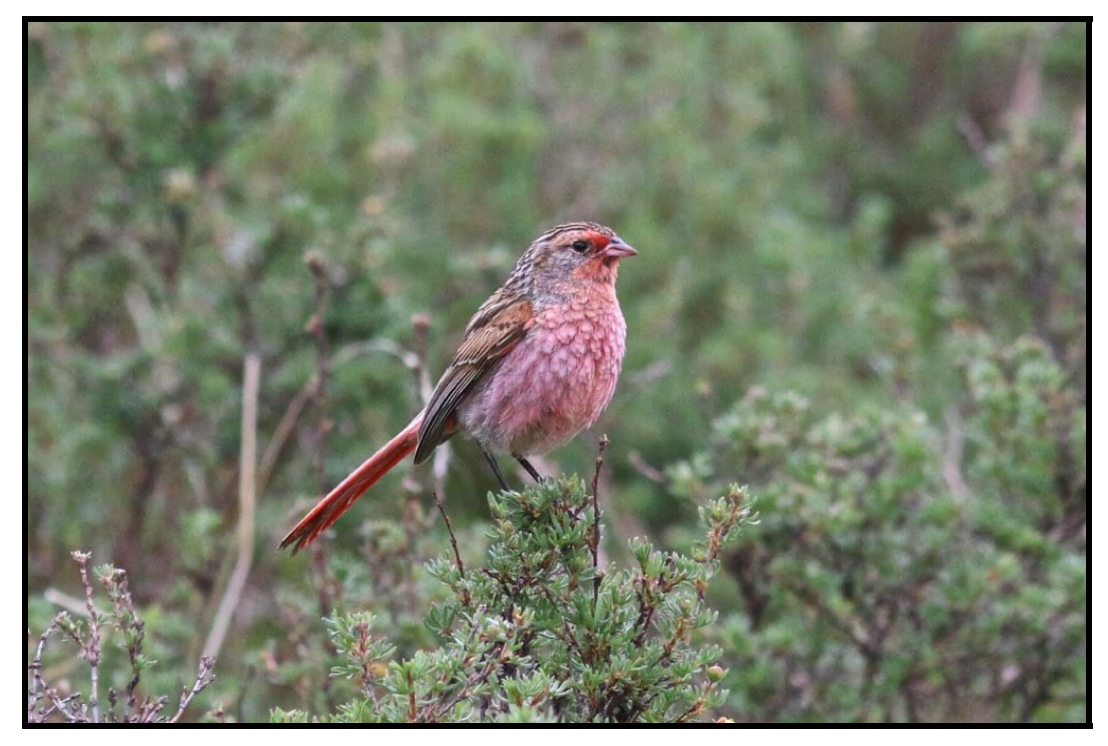
Przevalski's Finch is another monotypic family and a big target.