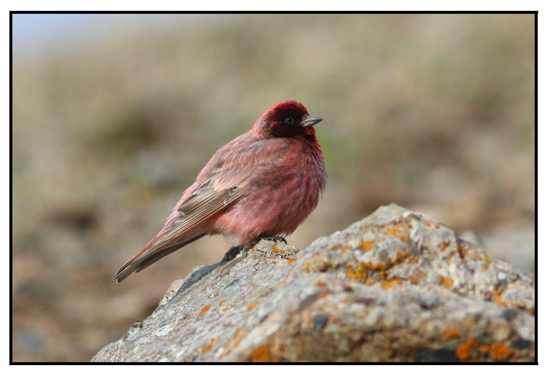
As we make our way through the spectacular mountains of this region, we can come across some fantastic birds, such as this Tibetan Rosefinch.