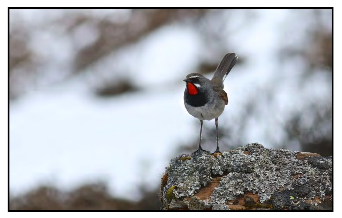
The gorgeous Chinese Rubythroat is always a highly desired species.

The morning's birding will see us in Gonghe, where we will look for Mongolian Finch, Desert Finch, Lesser Whitethroat, Pine Bunting, Black-faced Bunting, Isabelline Wheatear, Desert Wheatear, Rock Sparrow, Twite, Chinese Rubythroat, White-rumped Snowfinch, and Rufous-necked Snowfinch.