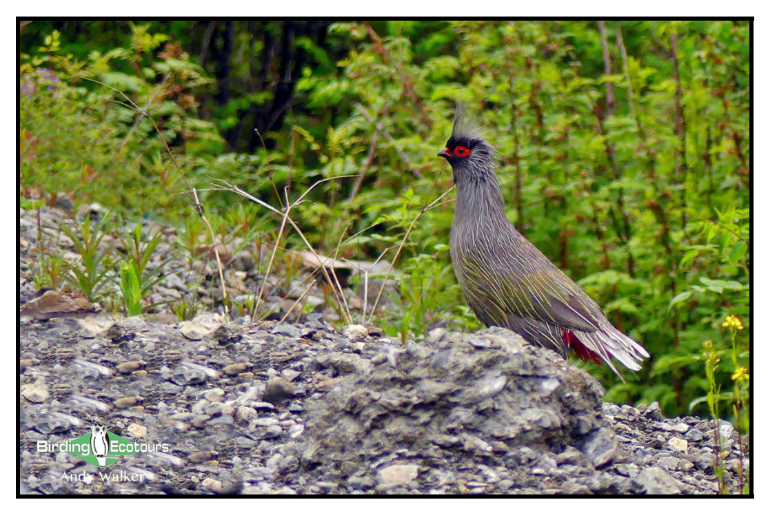
Blood Pheasant is often encountered at Baizha Forest.