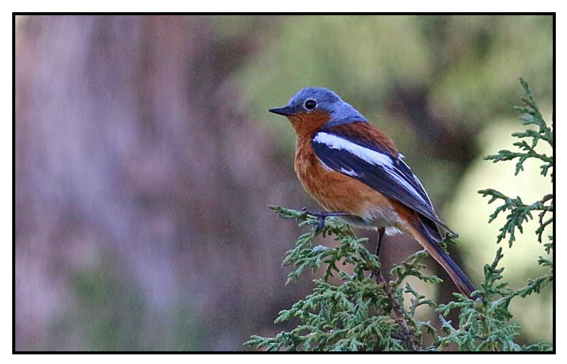
Przevalski's Redstart provides a great flash of color and is a delightful bird. We will look for these while within their range.