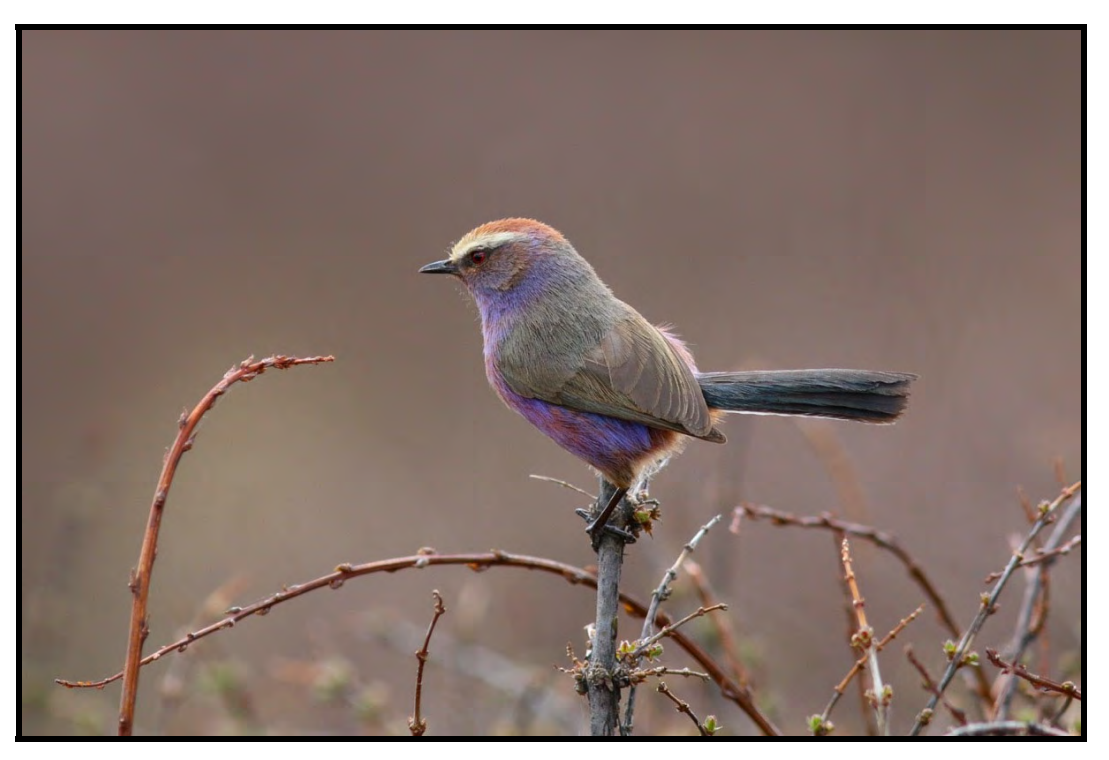
The beautiful White-browed Tit-warbler can be seen along the Kanda Shan pass.