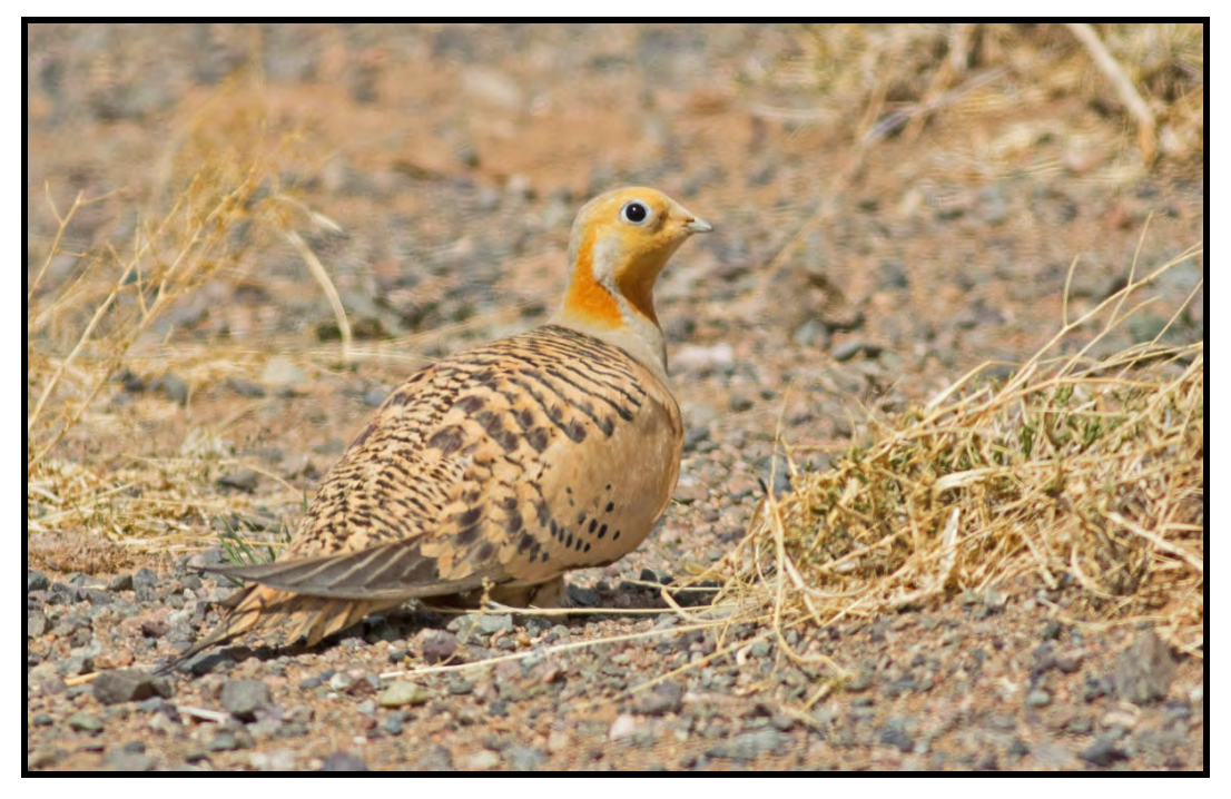
Pallas's Sandgrouse can be found in the Chaka area.

We will enjoy two full days birding around the Chaka area. Some of the areas we might visit while here include: <u>Chaka Valley</u>, <u>Chaka Marsh</u>, and <u>Chaka Salt Lake</u> and <u>flats</u>. There are a lot of targets for us here, with some very special gamebirds being possible, such as Tibetan Snowcock , Himalayan Snowcock , Tibetan Partridge , Chukar Partridge , Daurian Partridge , and Przevalski's Partridge . While scanning the ground we will also look for Pallas's Sandgrouse , Henderson's Ground Jay , and Ground Tit , along with a long list of larks, pipits and relatives likely to include Mongolian Lark , Horned Lark , Hume's Short-toed Lark , Asian Short-toed Lark , Oriental Skylark , Desert Wheatear , Isabelline Wheatear , Brown Accentor , and Rosy Pipit .