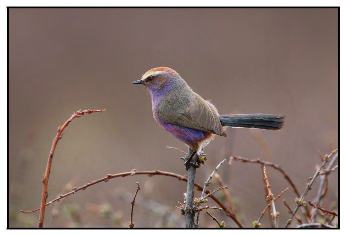
The beautiful White-browed Tit-warbler can be seen along the Kanda Shan pass.