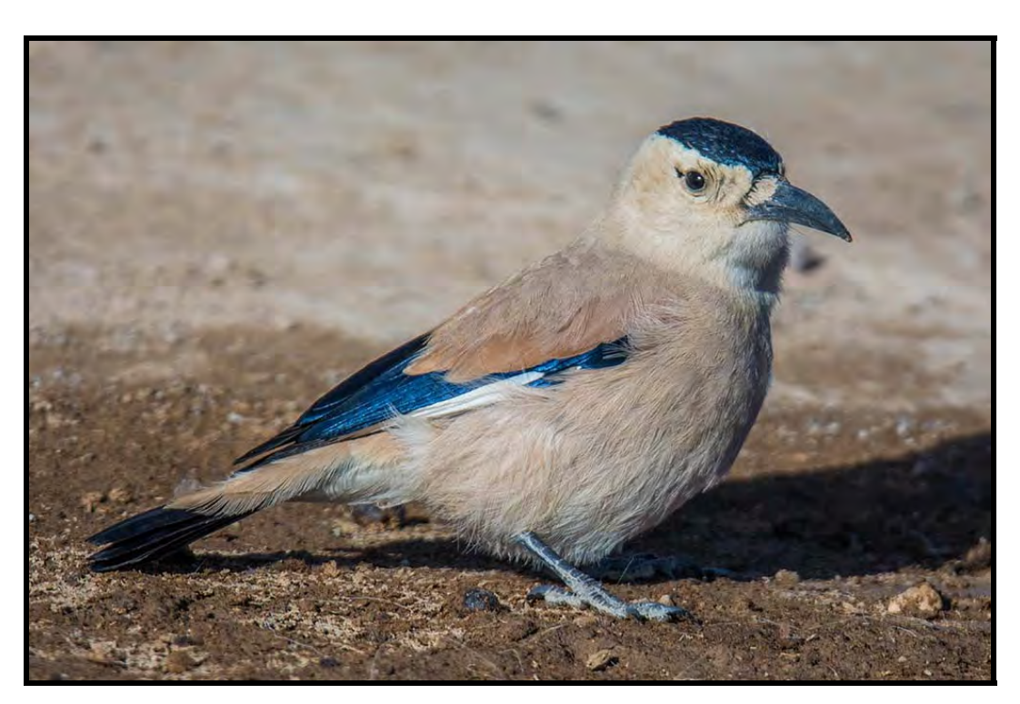
We will be in the realm of Henderson's Ground Jay today and we will be on the look out for this great and highly sought-after species.