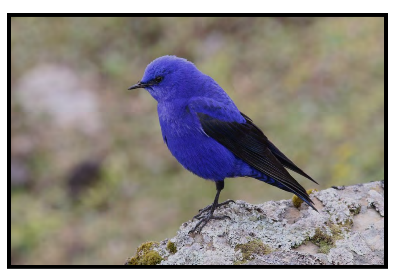
Grandala is one of our stunning targets on this amazing trip.

05 – 19 JUNE 2024 04 – 18 JUNE 2025 30 MAY – 13 JUNE 2026