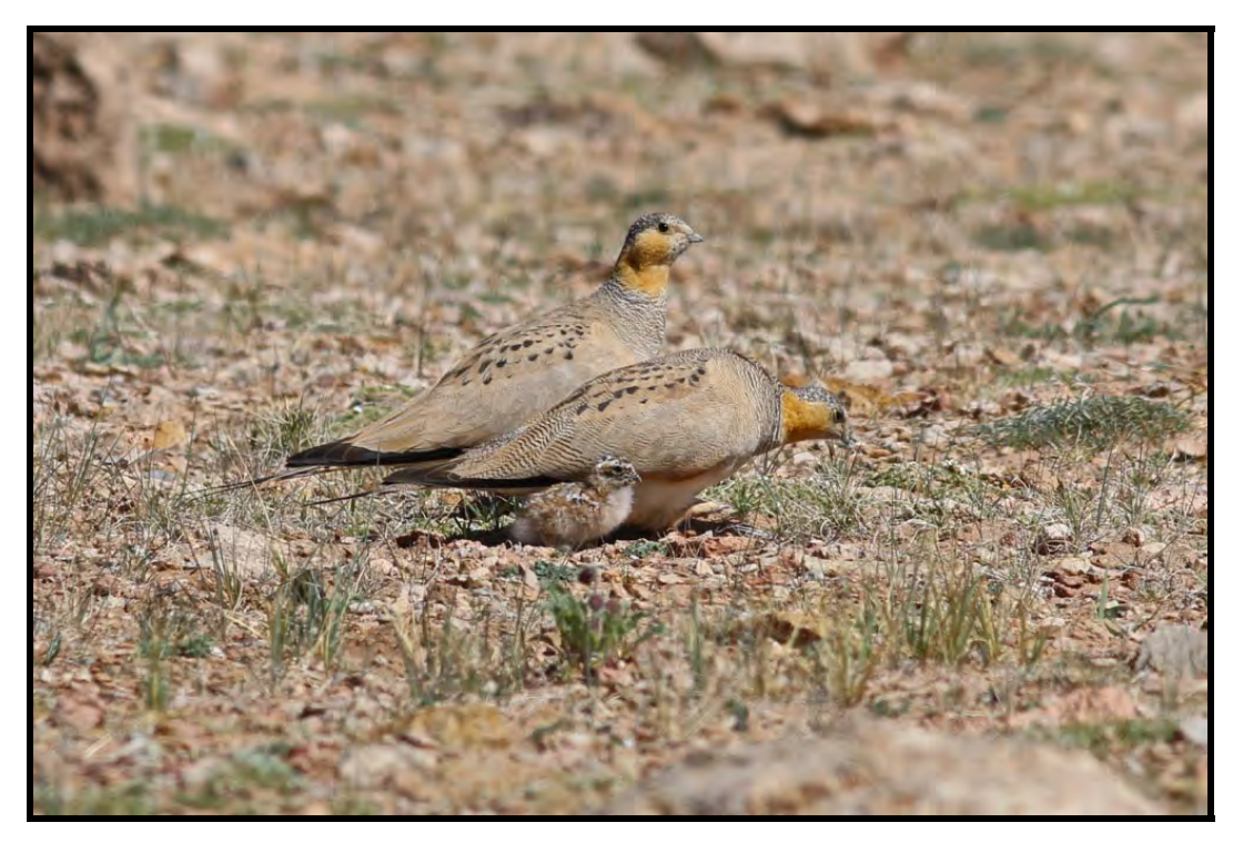
A family of Tibetan Sandgrouse is a delightful sight while birding on the plateau.

Our two-week birdwatching tour traverses some stunning landscape in pursuit of a number of exceptional birds of this high-elevation zone, the sights of this region are truly breathtaking. The birds available on this tour include some localized species, some globally threatened species, and some absolutely stunning ones. Some of the highlight birds we expect to see during our tour include Tibetan Sandgrouse, Pallas's Sandgrouse, Tibetan Snowcock, Tibetan Partridge, Himalayan Snowcock, White Eared Pheasant, Blood Pheasant, Szechenyi's Monal-Partridge, Ibisbill, Crested Tit-warbler, White-browed Tit-warbler, Snow Pigeon, Blacknecked Crane, Tibetan Snowfinch, Tibetan Rosefinch, Tibetan Bunting, Tibetan Babax, Tibetan Serin, Henderson's Ground Jay, and Grandala.