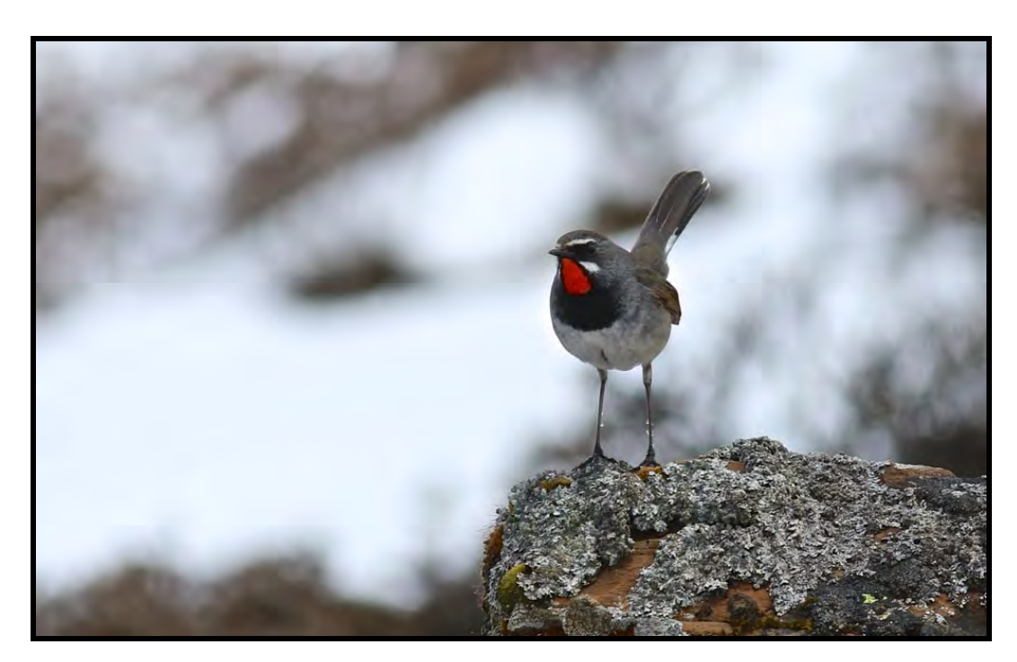
The gorgeous Chinese Rubythroat is always a highly desired species.

The morning's birding will see us in Gonghe, where we will look for Mongolian Finch, Desert Finch, Lesser Whitethroat, Pine Bunting, Black-faced Bunting, Isabelline Wheatear, Desert Wheatear, Rock Sparrow, Twite, Chinese Rubythroat, White-rumped Snowfinch, and Rufous-necked Snowfinch.