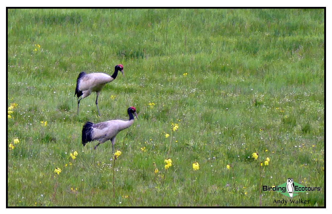
Black-necked Crane is a beautiful member of the family and we will look for them in this area.