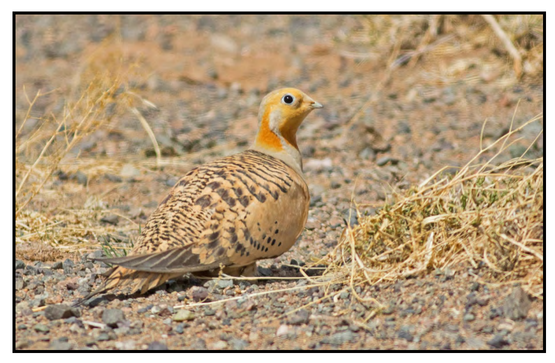
Pallas's Sandgrouse can be found in the Chaka area.

We will enjoy two full days birding around the Chaka area. Some of the areas we might visit while here include: Chaka Valley, Chaka Marsh, and Chaka Salt Lake and flats. There are a lot of targets for us here, with some very special gamebirds being possible, such as Tibetan Snowcock, Himalayan Snowcock, Tibetan Partridge, Chukar Partridge, Daurian Partridge, and Przevalski's Partridge. While scanning the ground we will also look for Pallas's Sandgrouse, Henderson's Ground Jay, and Ground Tit, along with a long list of larks, pipits and relatives likely to include Mongolian Lark, Horned Lark, Hume's Short-toed Lark, Asian Short-toed Lark, Oriental Skylark, Desert Wheatear, Isabelline Wheatear, Brown Accentor, and Rosy Pipit.