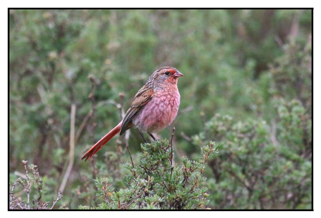
Przevalski's Finch is another monotypic family and a big target.