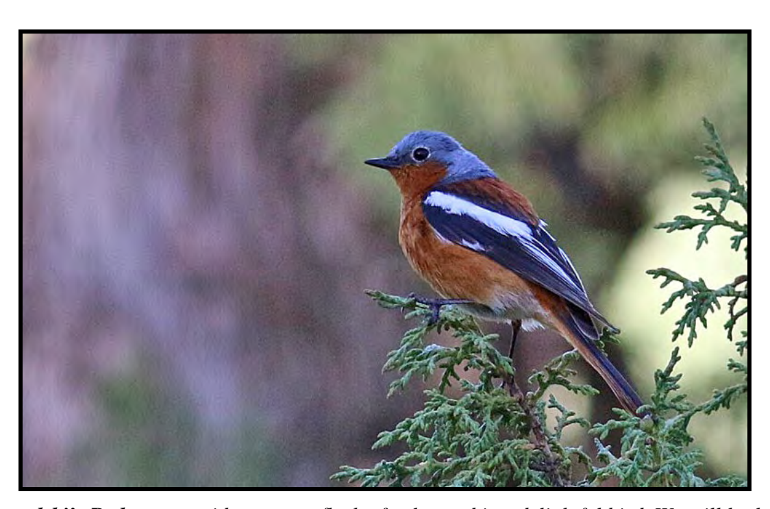
Przevalski's Redstart provides a great flash of color and is a delightful bird. We will look for these while within their range.