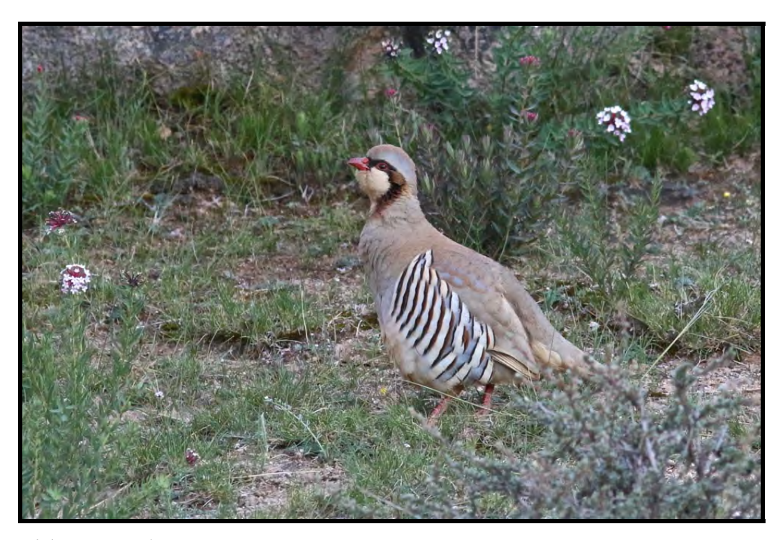
Przevalski's Partridge is one of our early tour targets and one of many interesting and localized gamebirds we can find on the tour.