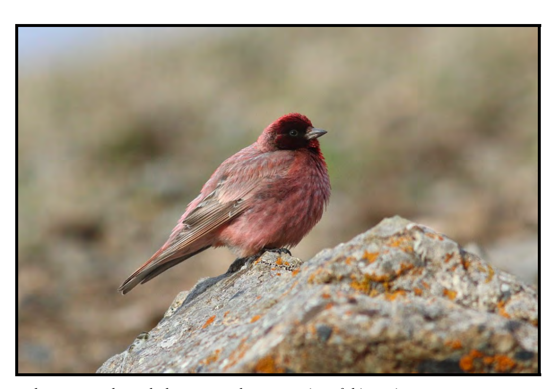
As we make our way through the spectacular mountains of this region, we can come across some fantastic birds, such as this Tibetan Rosefinch.