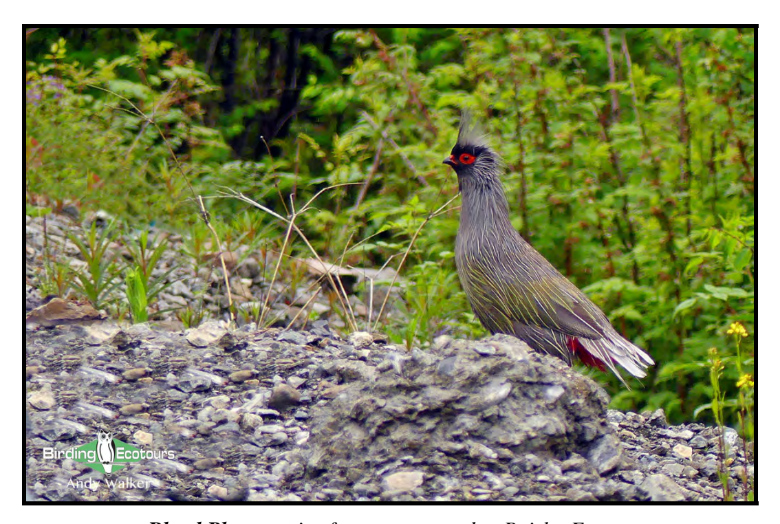
Blood Pheasant is often encountered at Baizha Forest.