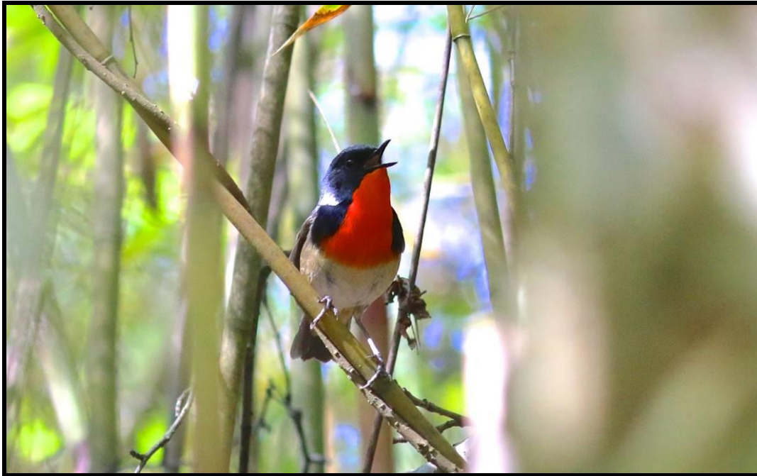
One of the most highly sought-after and beautiful birds in the world, we will have a good opportunity to find Firethroat while in the Longcanggou area (photo Summer Wong).

The forests themselves hold some amazing birds and we could find Red-headed Trogon , Great Barbet , Speckled Piculet , White-backed Woodpecker , Darjeeling Woodpecker , Great Spotted Woodpecker , Crimson-breasted Woodpecker , Bay Woodpecker , and Grey-headed Woodpecker . Open areas in the woodlands could hold Tiger Shrike , Brown Shrike , Long-tailed Shrike , Grey-backed Shrike , and Eurasian Hoopoe . Corvids, tits, and flycatchers are well represented, with five, ten, and 14 species possible respectively, as are leaf warblers, with at least 22 species available! Emei Leaf Warbler , Kloss's Leaf Warbler , and Sichuan Leaf Warbler being the top picks.