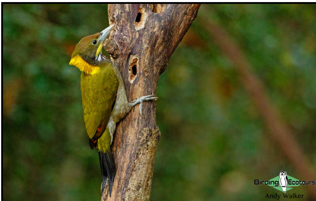
Greater Yellownape is one of several woodpecker targets here.