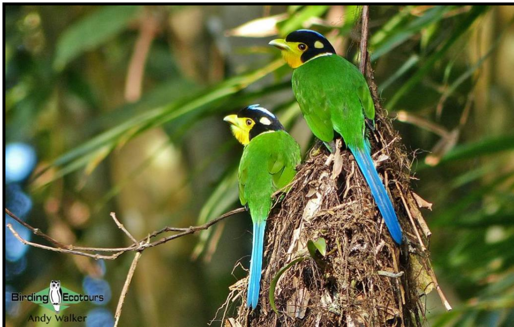
The almost plastic-looking Long-tailed Broadbill can be seen on this tour, it is a real beauty.

Overnight: Chonglou Hostel, or Similar, Baihualing