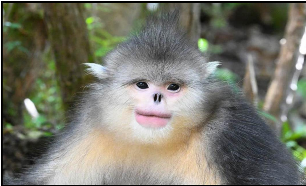
Black Snub-nosed Monkey are beautiful, and we hope to see these up close during the tour.

This exciting birding tour explores the far southwest of China in biodiverse Yunnan Province, which packs an extraordinary range of habitats into a relatively small part of the country, from tropical forests to rugged alpine mountains. As we travel, the scenery is often spectacular and changes dramatically within a single day. Our route takes us from the Kunming basin across the dry pinewood slopes of Zixi Mountain and the dramatic snow-capped peaks around Lijiang, through to the lush forests of the Gaoligong Mountains near the Myanmar border. Here we target three highly range-restricted species - Brown-winged Parrotbill , Yunnan Nuthatch , and White-speckled Laughingthrush , plus many others, including a high diversity of gamebirds, barbets, parrotbills, laughingthrushes, and fulvettas. We also make a special effort to visit a remote mountain valley where the rare endemic , and beautiful Black Snub-nosed Monkey can be found.