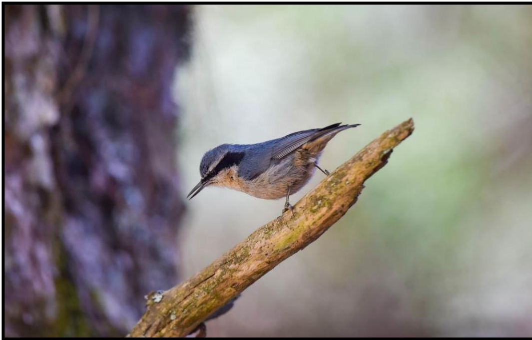
Yunnan Nuthatch is one of our localized targets in Yunnan.

Zixi Mountain Forest Park lies about 12 miles (20 kilometers) west of the city of Chuxiong. Covering approximately 16,000 hectares, it is the largest natural park in Yunnan Province. The landscape is dominated by both lush broadleaf, and evergreen Yunnan pine forest, providing excellent habitat for many nuthatches, including our two main targets - Giant Nuthatch and Yunnan Nuthatch . Over 250 bird species have been recorded here, including several species with limited global distribution, such as Black-browed Bushtit , Spectacled Fulvetta , White-collared Yuhina , Black-streaked Scimitar Babbler , Black-headed Sibia , elusive Long-tailed Thrush , and Chinese Thrush .