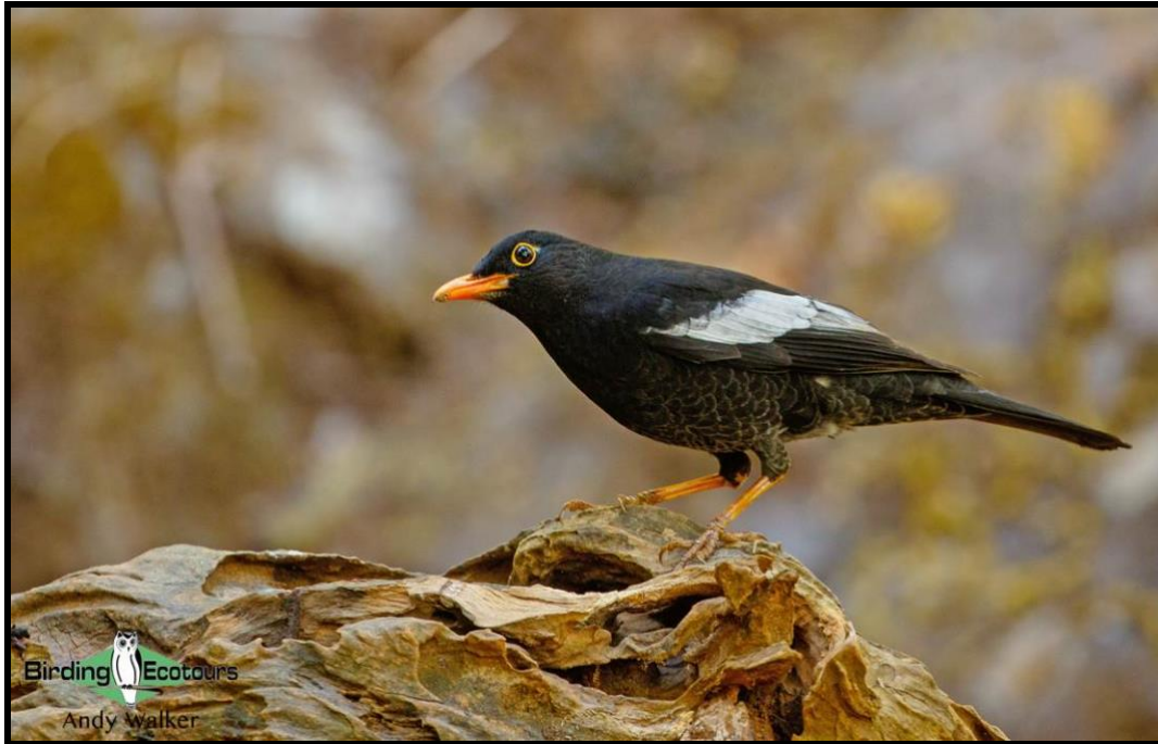
Grey-winged Blackbird is a beautiful member of the thrush family.

Babbler, Spectacled Fulvetta, and Eye-ringed Parrotbill , with Lijiang being the best place globally to see the latter, along with Salim Ali's Swift, Black-bibbed Tit, Black-browed Bushtit, White-collared Yuhina, Black-streaked Scimitar Babbler, Black-headed Sibia, Chinese Babax, and Black-headed Greenfinch.