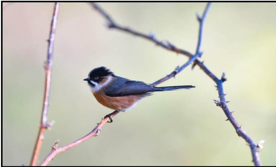
Black-browed Bushtit can be found in Zixi Mountain Forest Park.

Overnight: Ji Hotel, or similar, Lijiang