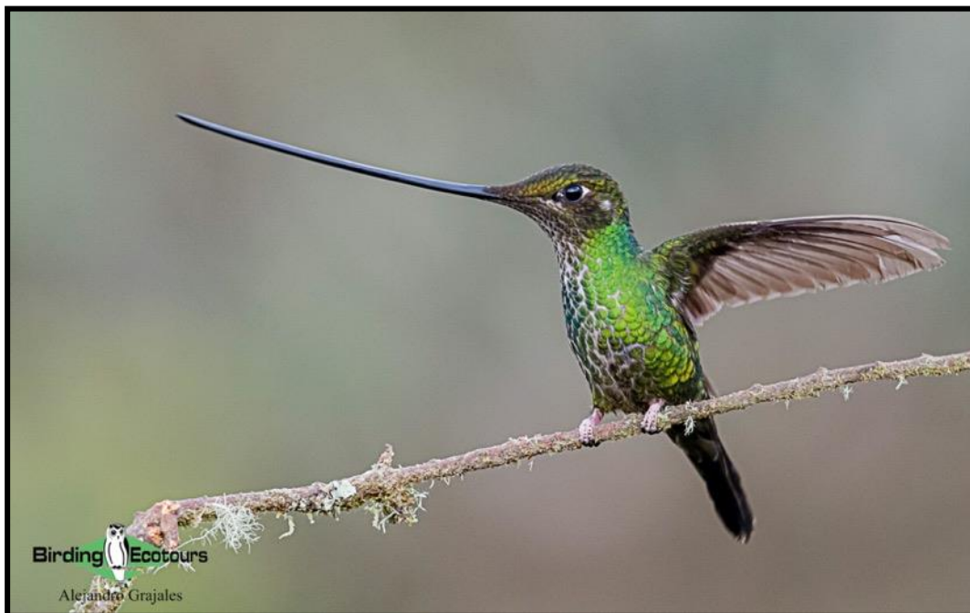
Sword-billed Hummingbird — a neotropical dream bird!

Overnight: Hotel Marriot Courtyard , Bogotá