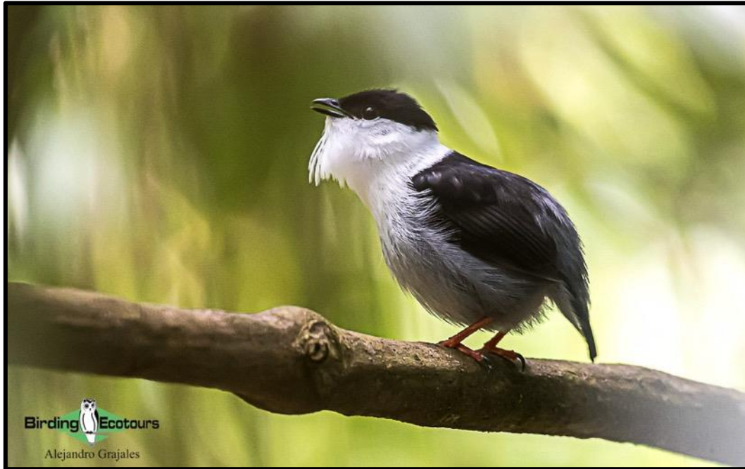
White-bearded Manakin can be seen in Las Margaritas Reserve.