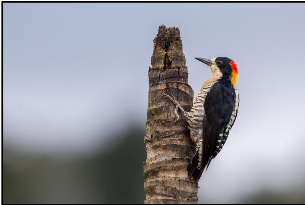
Beautiful Woodpecker, one of the many endemics we will be searching for on this Colombian tour (photo Daniel Orozco).

Overnight: Los Colores Ecoparque Hotel , Rio Claro