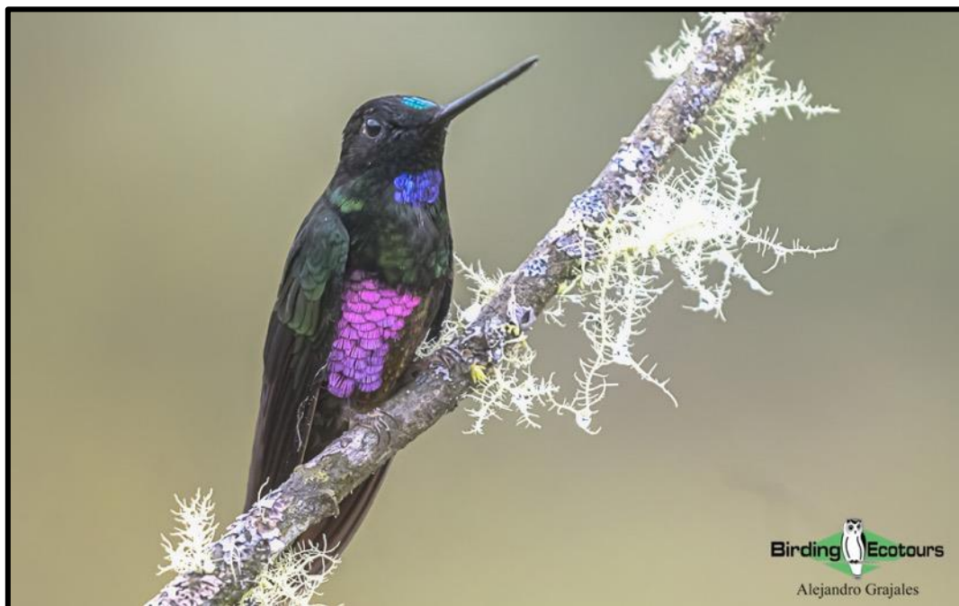
The stunning Blue-throated Starfrontlet is one of our targets at Observatorio de Colibries.

During our time around Bogotá, we will make a special trip to Chingaza National Natural Park to look for Spectacled Bear . This area has become a reliable area for South America's only bear species and we look forward to hopefully finding this most-wanted mammal. If you would like to create your own custom (and shorter) trip focusing only on Spectacled Bear , please get in touch as we can happily arrange this for you.