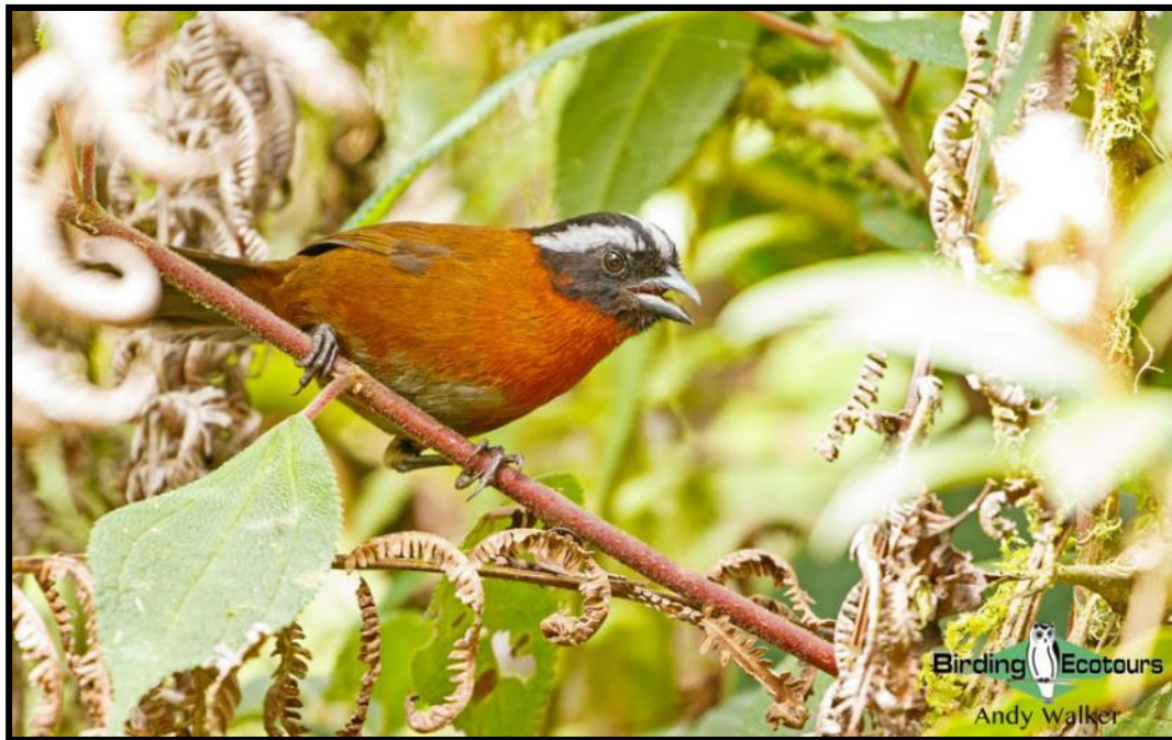
Tanager Finch will be searched for in the ProAves Yellow-eared Parrot Reserve.

We will then leave Medellín and head towards the picturesque town of Jardín in the southwest region of Antioquia, which will be our base from which to explore the ProAves Yellow-eared Parrot Reserve to look for our main target, the Endangered (BirdLife International) Yellow-eared Parrot . Other target species in the area include Tanager Finch , Chami Antpitta (recently split from the Rufous Antpitta complex), Purplish-mantled Tanager , Chestnut-breasted Chlorophonia , and with luck Ocellated Tapaculo and Chestnut-crested Cotinga .