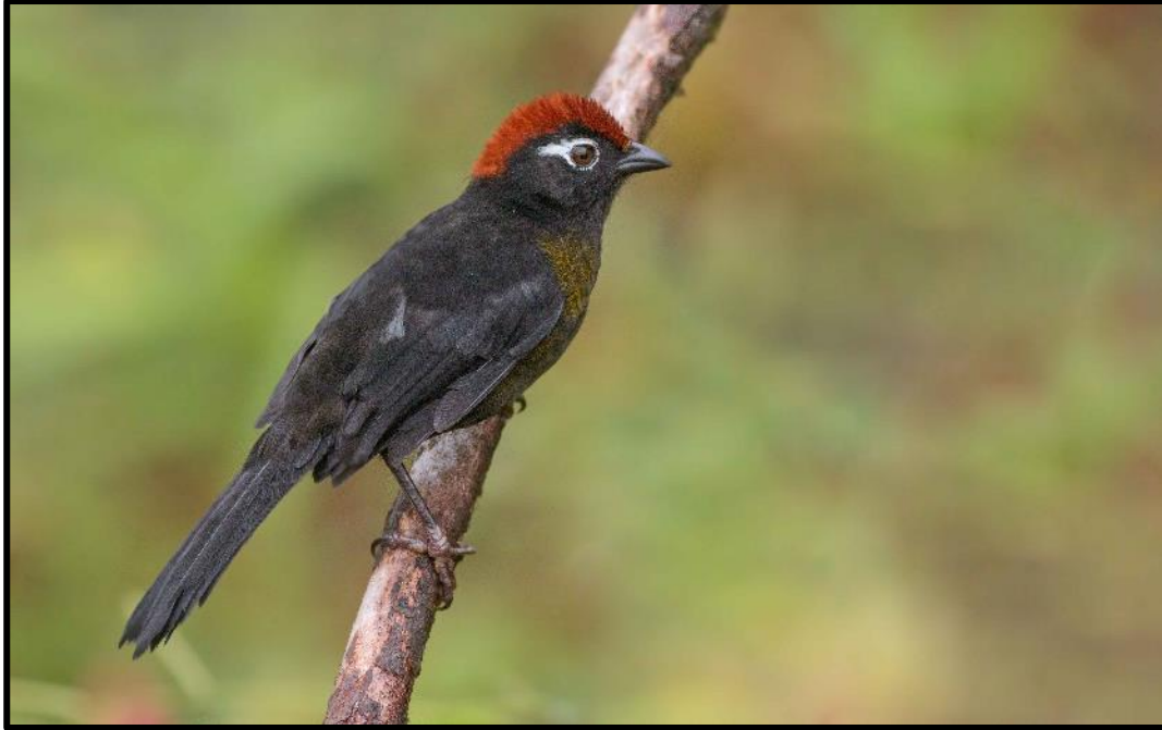
We'll look for the rare White-rimmed Brushfinch along the Trampolin Road.