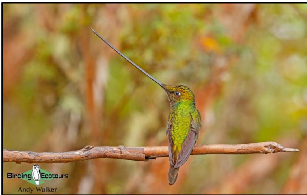
The ridiculous-looking Sword-billed Hummingbird.

Overnight: Hotel Dann Monasterio Popayan