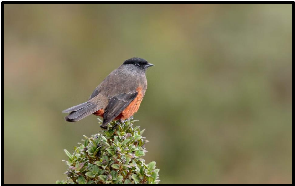
The poorly known and incredibly localized Chestnut-bellied Cotinga.