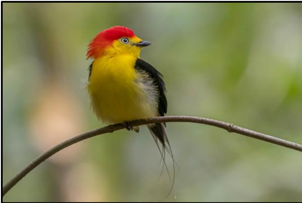
The cute Wire-tailed Manakin in the Llanos.