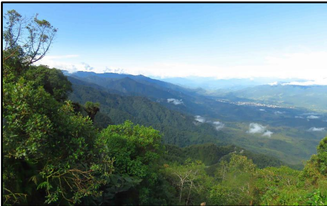
The Amazonian foothills provide for another new set of birds.

The upper tropical forest where the Andes meets the Amazon will provide a feast of birds such as Coppery-chested Jacamar and other avian jewels including White-eared Jacamar , Brown Jacamar , White-chinned Jacamar , Scarlet-crowned Barbet , Amazonian Umbrellabird , White-chested Puffbird , Western Striolated Puffbird , Black-streaked Puffbird , Scaled Fruiteater , Vermilion Tanager and Golden-collared Toucanet .