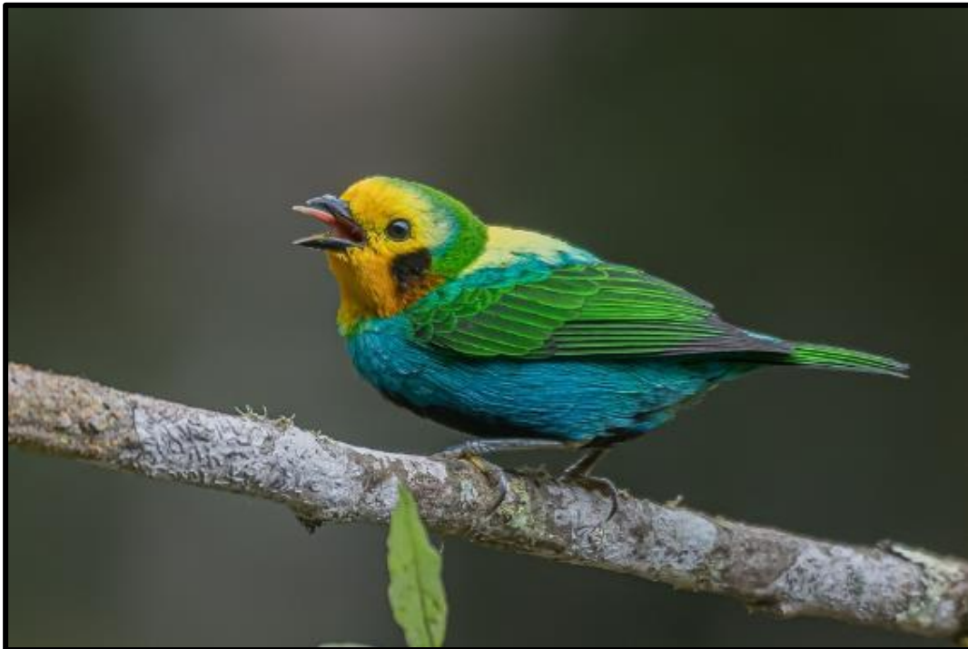
Multicolored Tanager , one of the most beautiful tanagers may be seen at Reserva La Florida.