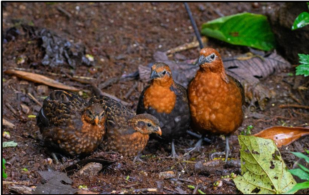
We will look for a family of Chestnut Wood Quails in Reserva La Florida.

This trip provides the opportunity to travel across Colombia along a completely different route compared to our classic itinerary above. We will start the trip in the city of Cali, and after visiting a new private reserve, where we should get excellent views of two Colombian endemics, Chestnut Wood Quail and Multicolored Tanager , as they regularly visit bird feeders here, we will then travel south to Nariño and Putumayo states to enjoy further unique birding experiences.