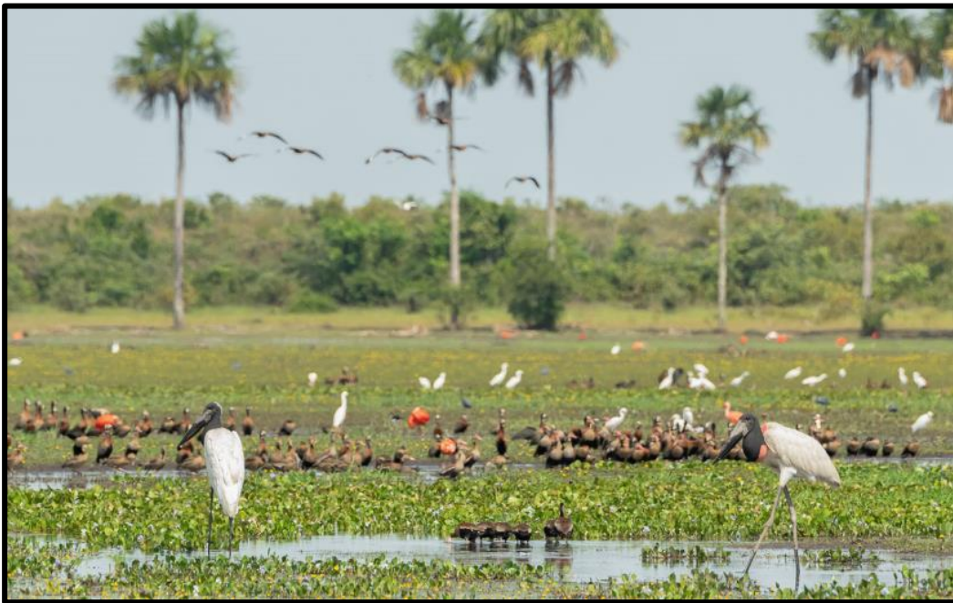
Jabiru and hordes of other waterbirds can be seen near Juan Solito Lodge.