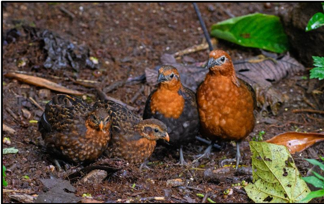
We will look for a family of Chestnut Wood Quails in Reserva La Florida.

This trip provides the opportunity to travel across Colombia along a completely different route compared to our classic itinerary above. We will start the trip in the city of Cali, and after visiting a new private reserve, where we should get excellent views of two Colombian endemics, Chestnut Wood Quail and Multicolored Tanager , as they regularly visit bird feeders here, we will then travel south to Nariño and Putumayo states to enjoy further unique birding experiences.