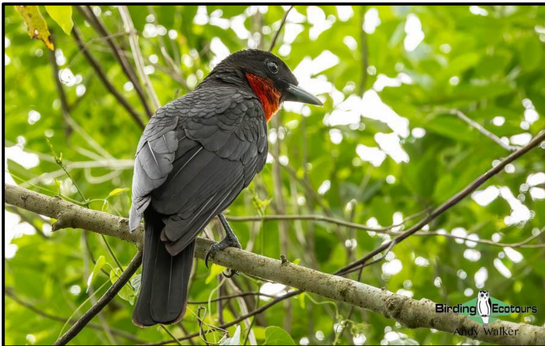
Red-ruffed Fruitcrow can be seen in the Amazonian foothills.

The upper tropical forest where the Andes meet the Amazon will provide a feast of birds such as Coppery-chested Jacamar and other avian jewels including White-eared Jacamar , Brown Jacamar , White-chinned Jacamar , Scarlet-crowned Barbet , Amazonian Umbrellabird , White-chested Puffbird , Western Striolated Puffbird , Black-streaked Puffbird , Scaled Fruiteater , Vermilion Tanager and Golden-collared Toucanet .