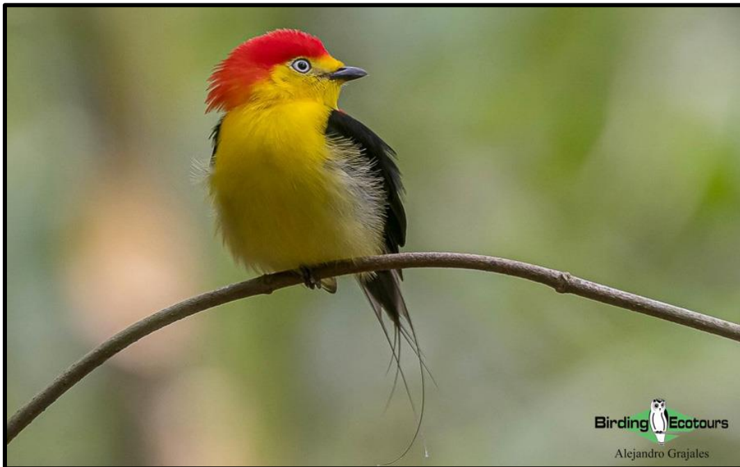
The cute Wire-tailed Manakin in the Llanos.