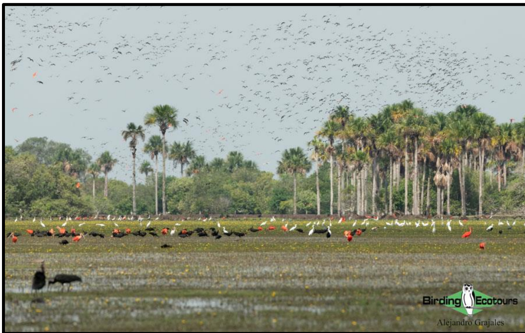
We will find large congregations of waterbirds while in Los Llanos.

Los Llanos are vast tropical grassland plains nourished by the waters of the Orinoco River . This habitat represents an amazing bird and wildlife refuge in northwestern South America. It is reminiscent of the Pantanal in Brazil, due to its high density of aquatic bird species. It was a popular destination among birdwatchers and nature lovers visiting Venezuela in previous decades, but due to the current political and social situation in the country, Venezuela is less popular to visit. The good news, however, is that you can still visit Los Llanos and not miss this incredible habitat, shared by only Colombia and Venezuela.