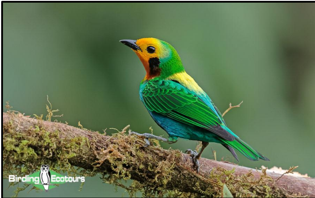
Multicolored Tanager , one of the most beautiful tanagers may be seen at Reserva La Florida.