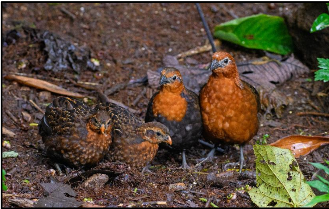
We will look for a family of Chestnut Wood Quails in Reserva La Florida.

This trip provides the opportunity to travel across Colombia along a completely different route compared to our classic itinerary above. We will start the trip in the city of Cali, and after visiting a new private reserve, where we should get excellent views of two Colombian endemics, Chestnut Wood Quail and Multicolored Tanager , as they regularly visit bird feeders here, we will then travel south to Nariño and Putumayo states to enjoy further unique birding experiences.