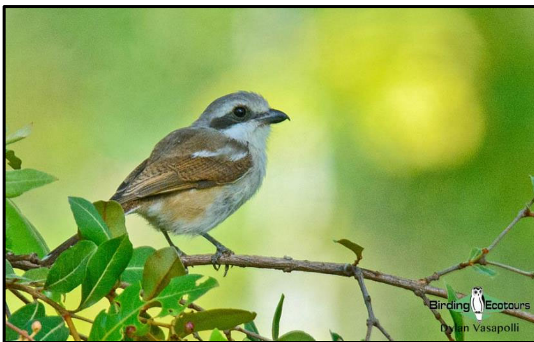
Dzalanyama is a reliable site for the uncommon and difficult-to-find Souza's Shrike.