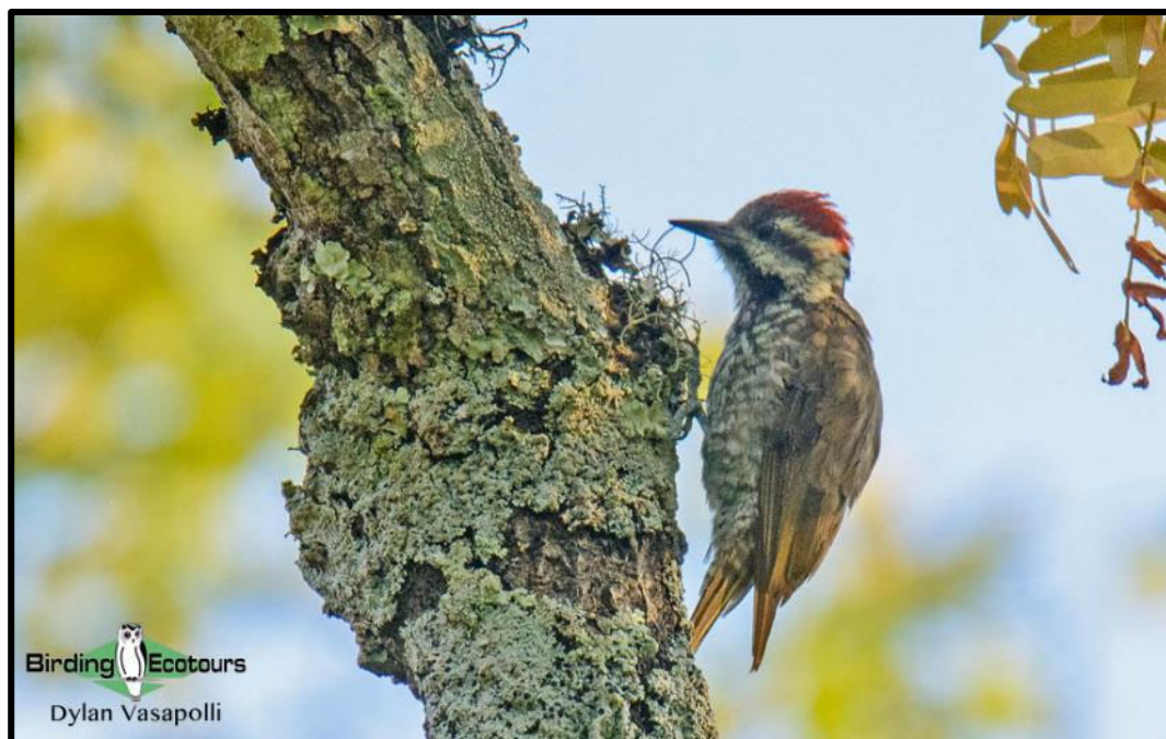
The highly localized Stierling's Woodpecker is only reliably seen in Malawi.

This tour begins and ends in Malawi's capital city, Lilongwe. After our arrival, we venture southwards and explore the remnant tracts of montane forest atop the Zomba massif . Here a number of highly localized species await, including Malawi's only endemic bird – Yellow-throated Apalis , along with the rare Thyolo Alethe and the stunning White-winged Apalis . The lush lowlands of the Shire River Valley follow next as we explore the excellent Liwonde National Park , gradually working our way northwards. Our bird and mammal list will grow rapidly here, where top specials such as Pel's Fishing Owl and Lilian's Lovebird await. What is arguably the best miombo woodland birding anywhere in the world follows - in the Dzalanyama Forest Reserve . This unique woodland is localized in south-central Africa and supports a whole host of species virtually confined to this habitat such as the highly localized Stierling's Woodpecker , African Spotted Creeper , Yellow-bellied Hyliota and Souza's Shrike .