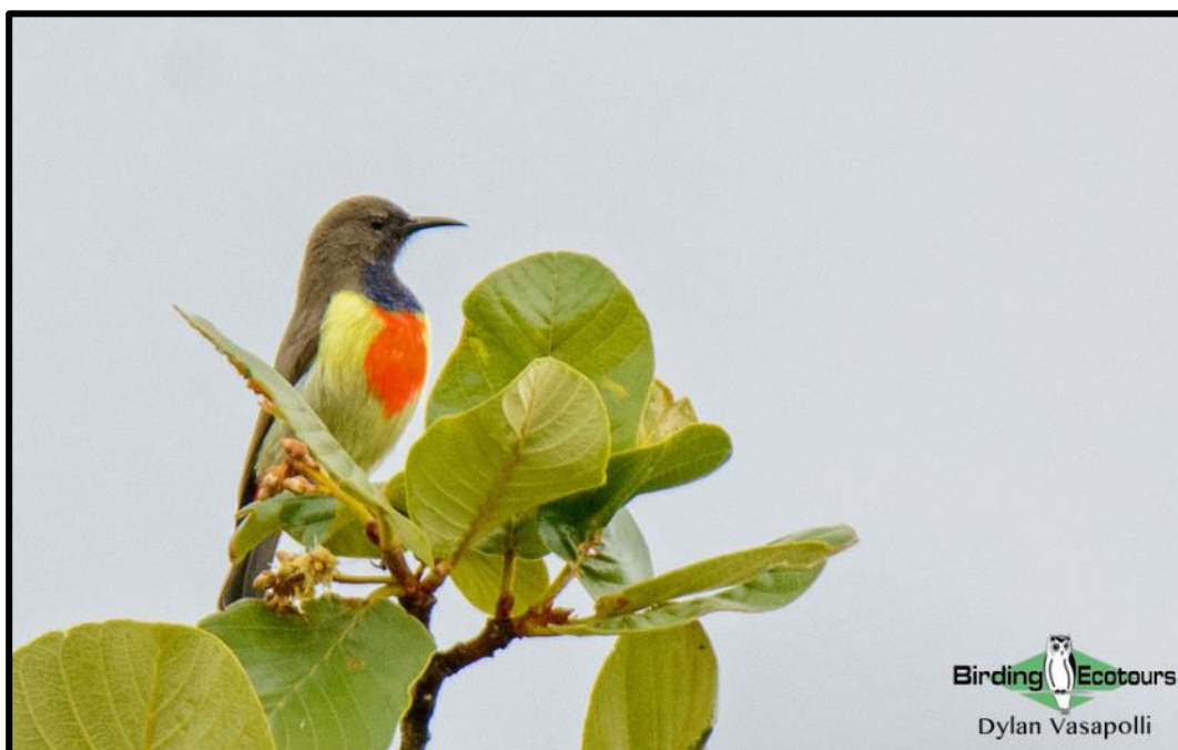
The stunning Anchieta's Sunbird is an inconspicuous miombo woodland specialist.

Overnight: Matunkha Safari Lodge, Rhumphi (or similar).