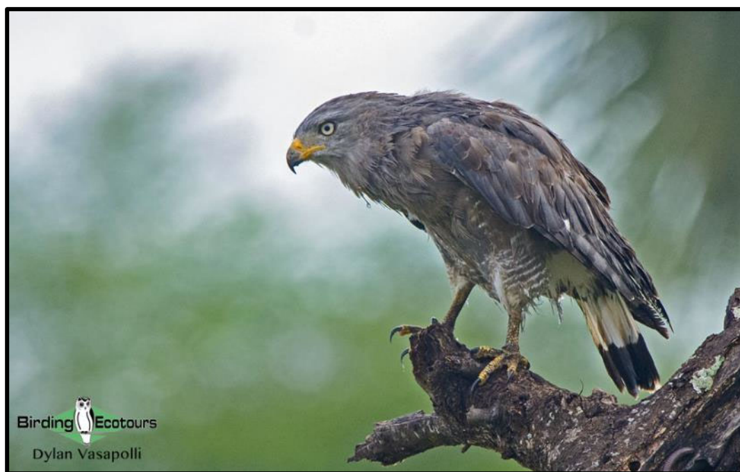
Western Banded Snake Eagle can be found in the woodlands along the Shire River.

White-backed Night Heron is another important target here, occurring in the over-hanging river vegetation. Dickinson's Kestrel is best sought in the open lala palm savannah on the edges of the floodplains, while Racket-tailed Roller , Speckle-throated Woodpecker and Arnot's Chat are best sought in the vast mopane woodlands further away from the river. A wide array of waterbirds can be found here, with numbers and species varying depending on the water levels of the Shire River. Some of the more important species we'll be searching for include African Skimmer , Saddle-billed Stork , Spur-winged Lapwing and in the adjoining reedbeds, Southern Brown-throated Weaver . Liwonde is a great place for raptors – we stand a good chance of seeing a number of different species, such as Palm-nut Vulture , African Cuckoo-Hawk , Western Banded Snake Eagle , Bateleur and African Hawk-Eagle . Owls are likewise well represented, and we stand good chances at finding African Barred Owlet , African Wood Owl and Verreaux's Eagle-Owl , in addition to the prized Pel's Fishing Owl . This is a list highlighting only our 'main targets' at Liwonde – we're assured to see many other birds whilst attempting to find these above-mentioned species.