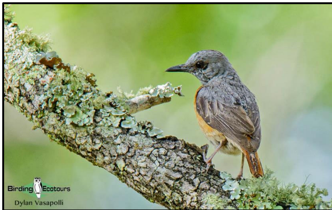
As its name suggests, Miombo Rock Thrush is a special of the miombo woodlands.

We have a final morning available for one last activity at Liwonde National Park, and may opt for a birding walk or boat cruise, depending on what species may still be eluding us. Following which, we'll transfer to the Dzalanyama Forest Reserve, via Lilongwe – this is a roughly five-hour drive. We anticipate arriving in the mid-afternoon, from where we'll check into our rustic, yet comfortable lodge, located in the heart of the reserve. We have two nights based here as we set about covering various locations in the area – most of our birding will be on foot allowing us to cover the area at our leisure. Set on the Mozambican border, the Dzalanyama Forest Reserve protects some of the finest patches of miombo woodland anywhere in Africa. Indeed, the stunning rocky hillsides blanketed in this visually appealing woodland make birding in this area a pleasure, and it is a firm favorite amongst our guides.