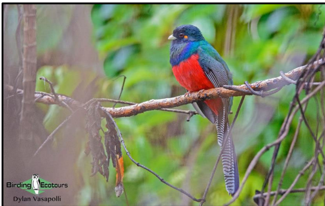
The incredible Bar-tailed Trogon is a major target whilst we're at Nyika!