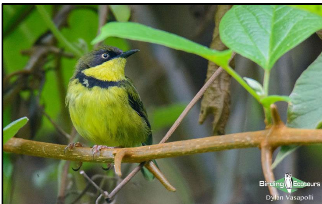
Yellow-throated Apalis is Malawi's only endemic bird, and should be seen around Zomba.

Our core focus will be in the remnant pockets of montane forest that exist on the plateau – much of which has been cut down unfortunately, as has happened with other sites in the country, such as the forests around Thyolo. These small pockets however, still support a wealth of birdlife and importantly still support some of Malawi's most prized birds. Foremost amongst those is the Thyolo Alethe – a shy forest robin that requires stealth and patience to see. Malawi's only endemic bird, the Yellow-throated Apalis is another primary target and is typically more easily sought on the forest edges. Noisy Livingstone's Turacos and Olive-headed Greenbuls are a regular sight in the canopy, with Long-crested Eagle and White-eared Barbet preferring exposed branches above the canopy. The forest interior supports a greater number of species and here we'll search for a wide range of species such as the unique dimorpha subspecies of Cape Batis , Black-throated Wattle-eye , Common Square-tailed Drongo , White-tailed Crested Flycatcher , Little and Placid Greenbuls , Yellow-throated Woodland Warbler , Black-headed Apalis , Orange Ground Thrush , White-starred Robin , Dark-backed Weaver , Green Twinspot and Red-faced Crimsonwing .