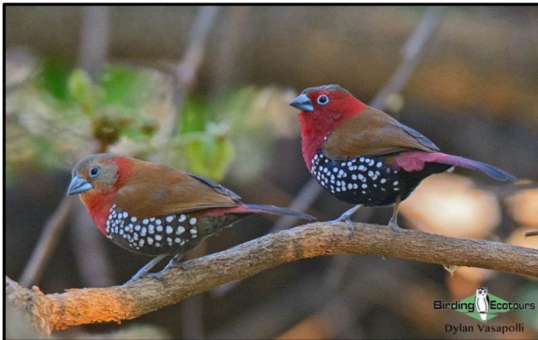
A pair of attractive Red-throated Twinspots – a species we should see on the tour.

Overnight: Kumbali Country Lodge, Lilongwe