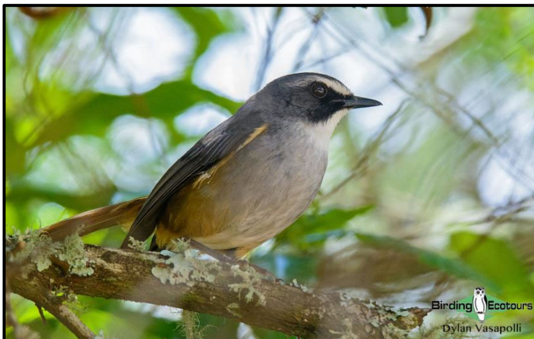
The shy Olive-flanked Ground Robin is another important target at Nyika.

Overnight: Chelinda Lodge, Nyika National Park