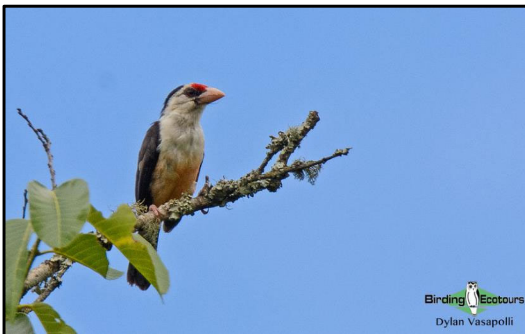
Black-backed Barbet can be reliably seen in Nyika.

entrance gate hold some excellent, and stunning miombo woodlands. Although we should have seen almost all of the miombo specials by this point on the trip, Nyika can also prove to be a reliable backup for tricky species such as Yellow-bellied Hyliota and Anchieta's Sunbird . Additionally, these woodlands are also reliable for other species we're only likely to see here such as Trilling Cisticola , White-winged Black Tit , Collared Flycatcher , Tree Pipit and Eastern Miombo Sunbird . Arguably our most important target here is the scarce Black-backed Barbet . As we near the top of the plateau, the miombo gradually begins changing and thinning out. Open areas with some rank growth will be searched for Red-winged Prinia and Marsh Tchagra , while the open woodlands here also host Brown Parisoma , Green-headed Sunbird and Brown-headed Apalis . Eventually, we emerge onto the top of the plateau, where rolling grasslands are dominant with the odd pocket of montane forest.