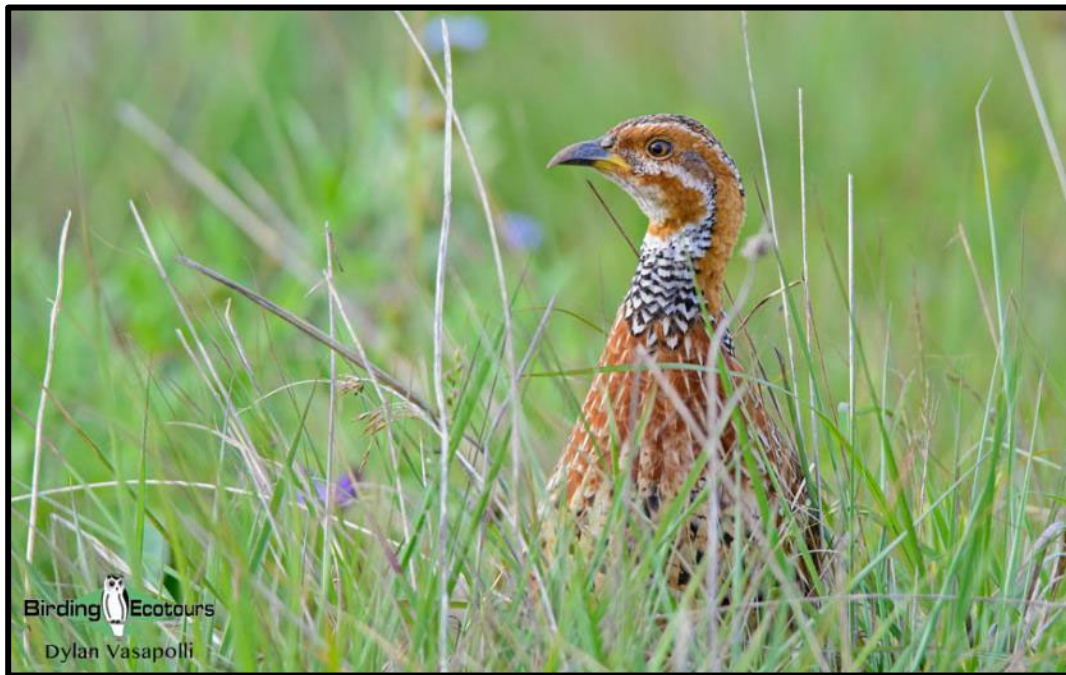
Nyika has its own endemic subspecies of Red-winged Francolin .

frequent the grasslands, and we should also keep an eye out for the likes of Rufous-breasted Sparrowhawk , Western Marsh Harrier and Augur Buzzard .