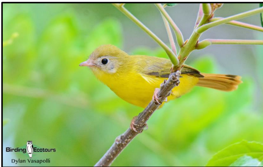
The lively Livingstone's Flycatcher is an important target bird in Liwonde National Park.

We have a final morning available on Zomba Mountain to try and find any species that we may still be searching for – which might include the tricky and difficult to see Thyolo Alethe , along with White-winged Apalis , before transferring to our next destination – Liwonde National Park. This is a short transfer of under two hours, from where we will call in at the very comfortable Mvuu Camp, set beautifully overlooking the Shire River, where we will be staying for two nights.