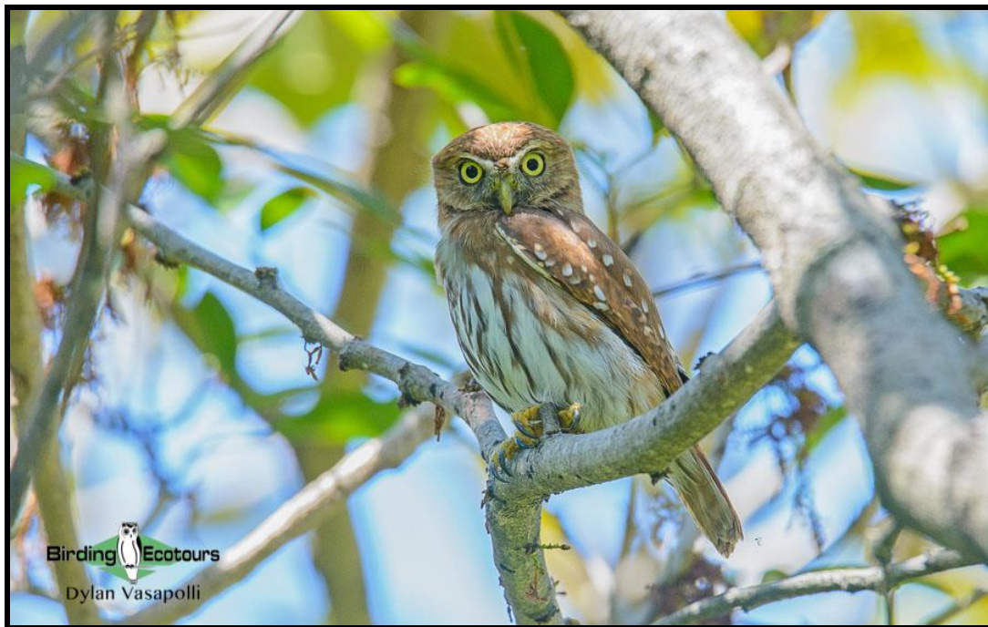
The fierce Ferruginous Pygmy Owl may be seen in San Jose.