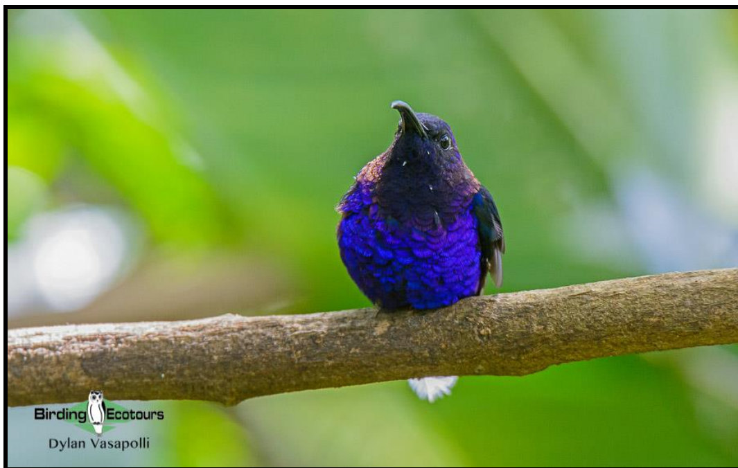
We may find Violet Sabrewing at La Paz Waterfalls.

We will spend some time birding the hotel grounds before breakfast to add any additional species to yesterday afternoon's birding. After breakfast, we will leave the hotel and head to La Paz Waterfalls. Here we should get species such as Mountain Wren, Slaty Antwren, Slaty-backed Nightingale-Thrush, Large-footed Finch , and a number of hummingbirds such as Violet Sabrewing, Green Hermit, Green-crowned Brilliant , the endemic Coppery-headed Emerald and with some luck Purple-crowned Fairy . We will of course spend some time admiring the impressive waterfalls of the area too!