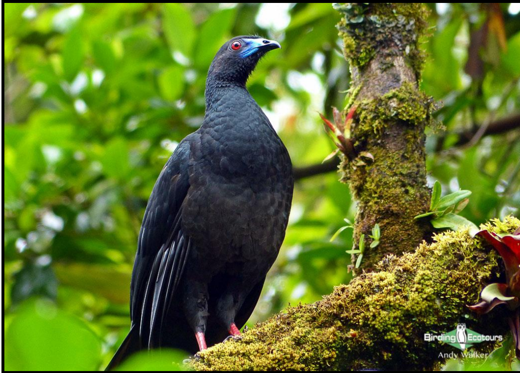
Black Guan can be seen at the Cinchona feeders.