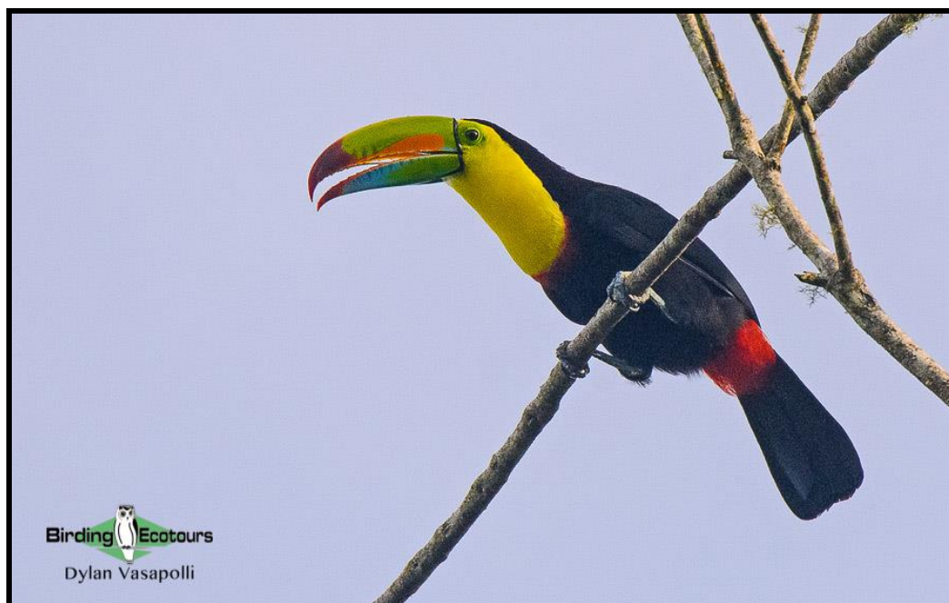
The large and brightly colored Keel-billed Toucan is always a popular sight.

Costa Rica offers perhaps the best birding in Central America, not only in terms of birds (the country holds 933 species) but also in terms of accommodation and tourist infrastructure. During this short tour we are staying at some of the most comfortable hotels available, perfect for birders and nature-lovers alike. If you do not have time to join our more comprehensive Complete Costa Rica Tour but still want to see beautiful and charismatic neotropical bird species, then this Costa Rica Escape Tour could be perfect for you. The tour is suited for both first-time birders to the neotropics and those more experienced birders trying to get a high number of species in the shortest amount of time. Not only does this tour offer an impressive species list but it also offers you the opportunity to see a number of neotropical dream birds such as Keel-billed Toucan , Resplendent Quetzal and a plethora of gorgeous hummingbird species.