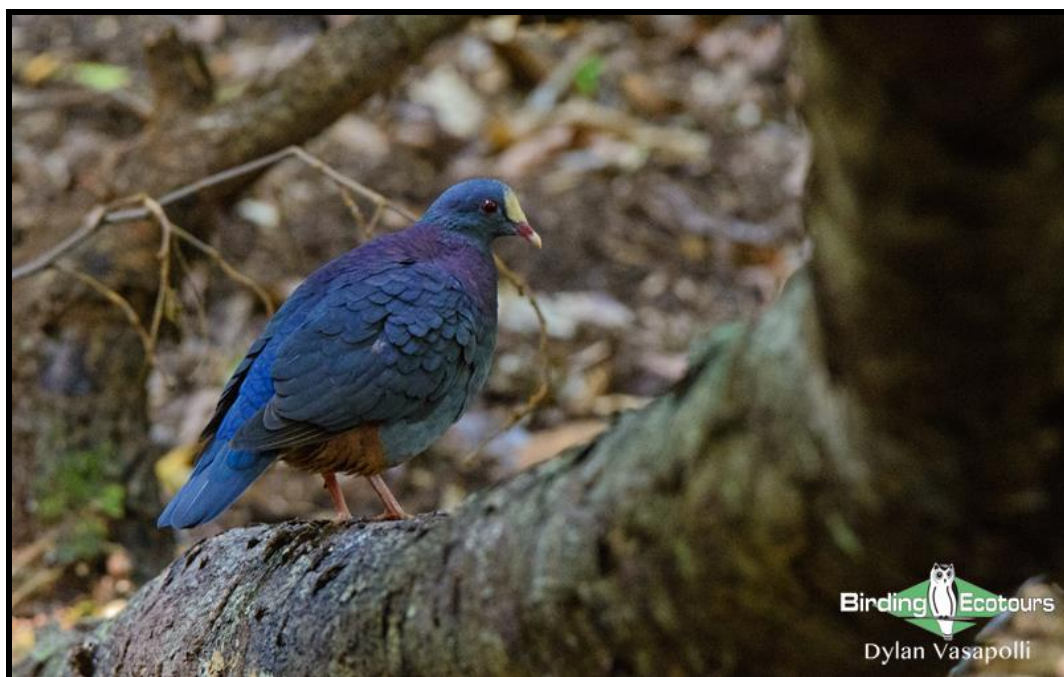
White-fronted Quail-Dove often requires some patience to find.