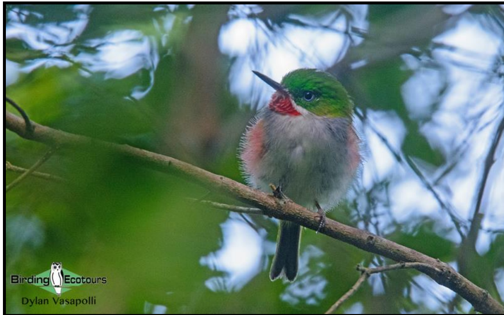
Narrow-billed Tody — another today we hope to find on this tour.

The pine forests are home to the scarce Hispaniolan Crossbill and Pine Warbler . As we begin descending from the Zapotén sector we will keep an eye out for the rare Golden Swallow , now sadly almost certainly extinct in Jamaica, along with Loggerhead Kingbird . There is a Northern Potoo stakeout along the road, and we are occasionally treated to day views of this bird. Lower down the road, in the foothills, the habitat changes to drier, broad-leaved forest, and here we will search for arguably the country's most difficult endemic, Bay-breasted Cuckoo . This rare and sadly declining species is notoriously difficult to find, and we would count ourselves lucky to see it. Flat-billed Vireo also occurs in this area and is normally a bit easier to find. The agricultural lands on the outskirts of Puerto Escondido are good to search for Hispaniolan Oriole , Greater Antillean Grackle , and occasional flocks of Antillean Siskins , while they also play host to other widespread species such as Common Ground Dove , Smooth-billed Ani , Burrowing Owl , American Kestrel , Olive-throated Parakeet , Northern Mockingbird , and Yellow-faced Grassquit . Our afternoon will be spent birding locally, such as on the Rabo de Gato trail or on the outskirts of Puerto Escondido, or at leisure for those who want a break.